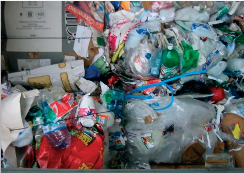
'Green List' waste being inspected at Rotterdam.

A working group was set up to deal with illegal waste movements out of the Republic of Ireland. This working group uses the combined skills of the local authorities, the EPA, government departments, An Garda Síochána, the National Bureau of Criminal Investigations, and the Environment and Heritage Service in Northern Ireland to identify the issues that need to be tackled in relation to TFS and to work together towards better enforcement.