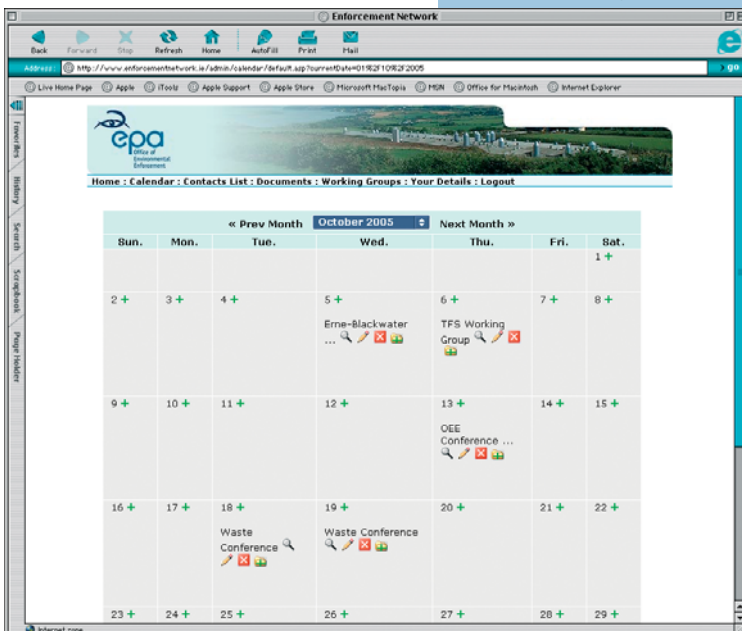
Extract from the Calendar on the Extranet Site.

If you would like to become a user of this extranet site and have not already registered, please visit the site at www.enforcementnetwork.ie and register your details.