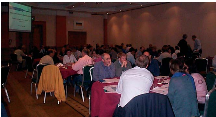
Delegates pictured during workshop discussions at the Enforcement Network Water Conference in June 2005

A cross compliance working group was established to develop a consistent approach to conducting farm inspections for the purpose of checking and reporting on cross compliance. The group developed and trialled a guidance document and checklist for conducting farm inspections with respect to control of sewage sludge and groundwater protection. These have been submitted to the DEHLG to forward on to the Department of Agriculture and Food. However, since the establishment of the group, it was decided that Department of Agriculture and Food inspectors will be responsible for carrying