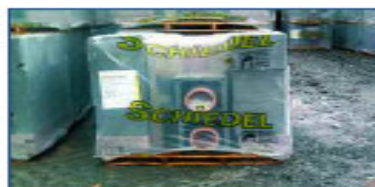
Photo 2 Existing System Packaged for dispatch

The aim of the project was to develop a new 'Storey High' modular chimney system to replace the current Swift Chimney System components kit. Basically supplying the chimney in assembled modular sections rather than in kit form.