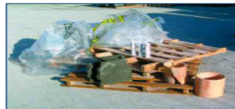
Photo 3 Existing system - Typical waste from one Schiedel Swift System

The new system eliminates packaging since it is transported to site in re-useable metal cradles, whereas the existing system uses two pallets with heavy duty shrink wrapped hoods and insulation and sealant supplied separately.