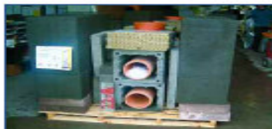
Photo 1 Existing Swift Chimney System components

As at the end of 2006, 12% of sales were of the new system. It is expected to take approximately 4 years to convert fully to the new system.