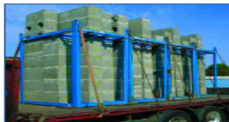
Photo 5 New system being dispatched in custom metal cradles which are reused

In June 2006 Schiedel Carrickmacross came joint top out of 25 plants within the Schiedel group in the area of safety and environmental awareness. This was achieved in spite of the Carrickmacross plant being much older than most of the other plants which are located across Europe.