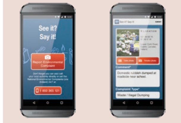
Figure 13.3. The EPA has developed a phone app, called See it? Say It! 4 to help people to report environmental pollution.

The State has stepped in to manage remediation at major waste infrastructural sites where companies ceased to trade resulting in significant cost to the public purse. The EPA has published two recent sets of guidance on measuring and providing for environmental liabilities, with the general aim that financial provisions must be Secure, Sufficient and Available .