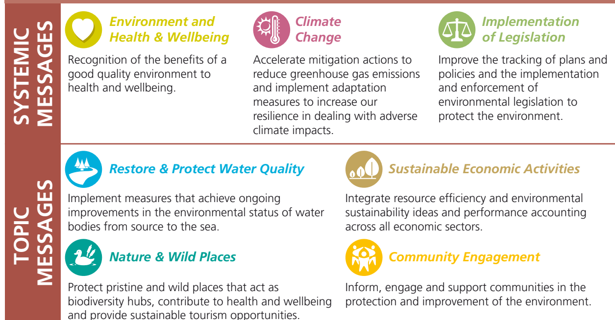
Figure 13.1 Seven Key Environmental Actions for Ireland on the State of the Environment in 2016

Following on from the information and evidence presented in earlier chapters, this section of the report highlights seven key environmental actions for Ireland. While the actions are listed as individual items, many are linked and the integration of actions across these areas will be important for the delivery of environmental protection and sustainable development. Many of these actions can also be linked to the Sustainable Development Goals from the UN.