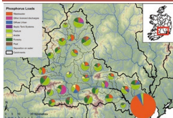
Figure 13.4 Sources of phosphorus in the Suir sub-catchments

2015g). The overwhelming majority of the respondents in the survey felt that local communities should have a say in how the water environment is managed. One of the main measures now being implemented to improve and protect water quality is the use of an integrated and evidence-based approach to managing water catchments. This new approach will require much better targeting of interventions such as the identification of the sources of nutrient loadings to catchments (see Figure 13.4 as an example), to restore and protect water quality as well as a greater community involvement in protecting and managing our water resources.