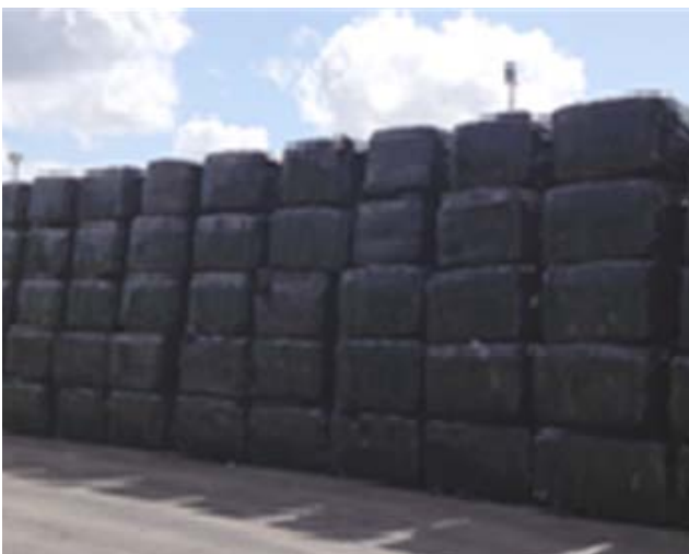
Figure 1.1 Baled waste stored externally

It is the responsibility of each WTS operator to ensure that they comply with all relevant legislation in relation to fire safety. Nothing in this guidance should be construed as negating the operator's statutory obligations or requirements under any other enactments or regulations.