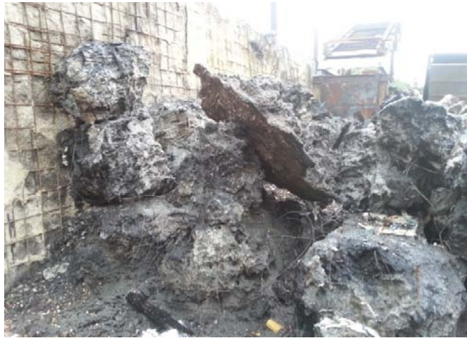
Figure 7.1 Fire Damaged Waste