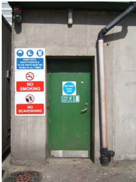
Figure 5.1 Fire exit free of obstruction