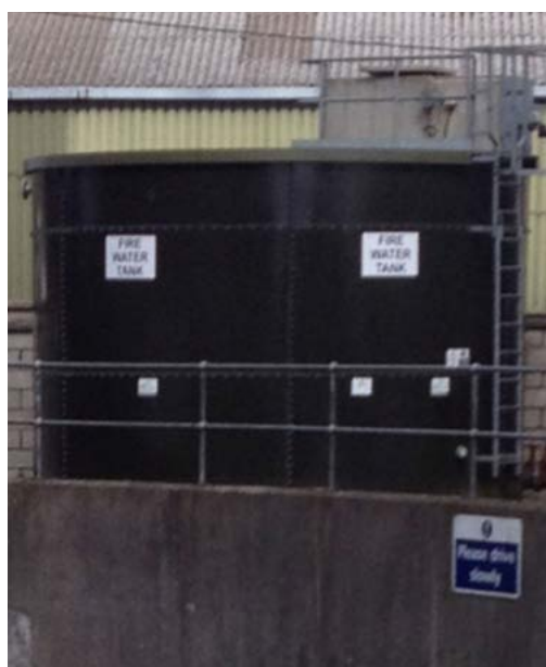
Figure 4.2 Static fire-fighting water supply tank

Firewater retention ponds are likely to become contaminated during a fire. Consequently their use as a source of fire-fighting water for further application onto the fire is generally not recommended. This option may, however, be examined on a case-by-case basis.