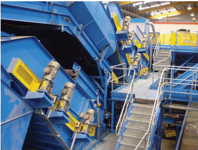
Figure 3.1 Complex WTS processing area

In more complex premises, particularly those with raised picking floors or sub-divisions where an alarm given from any single point is unlikely to be heard throughout the building (see Figure 3.1), an electrical system incorporating sounders and manually operated call points (break-glass units, see Figure 3.2) is likely to be required.