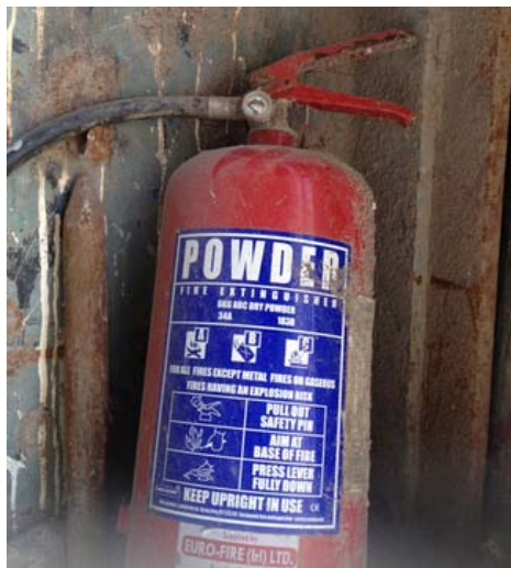
Figure 4.1 Poorly maintained fire extinguisher

This equipment will need to comprise enough portable extinguishers, designed to European Standard EN 3 series, suitable for the risk and will need to be properly maintained (unlike the example shown in Figure 4.1).