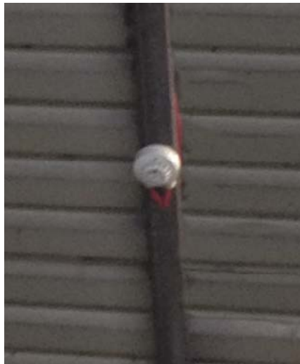
Figure 3.3 Smoke detector

Where a detection system is required as part of the system the choice of detection unit will usually be determined by the system designer/installer. In most areas of WTS, smoke detectors are the simplest and most cost-effective choice (see Figure 3.3). Dustier areas may require combination detector heads (to avoid false alarms due to contamination). Heat detectors may be appropriate in some parts of a building, where contamination potential is very high.