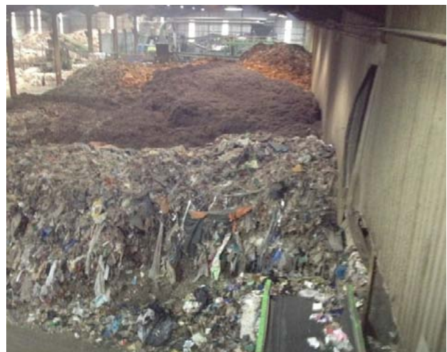
Figure 1.2 Large stockpiles of waste stored internally