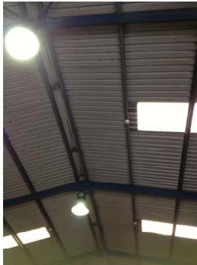
Figure 5.3 Emergency lighting

An emergency escape lighting system should normally cover the following: