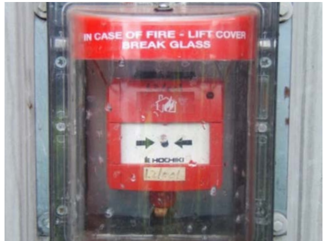
Figure 3.2 Break-glass unit

This type of system is usually acceptable where all parts of the building are occupied at the same time and it is unlikely that a fire could start without somebody noticing it quickly. However, where there are unoccupied areas or sub-divisions within the space that can inhibit early discovery of a fire, automatic fire detection may be necessary.