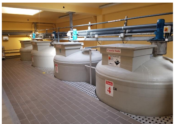
Photo 3 Caustic Soda tanks not in use and not banded