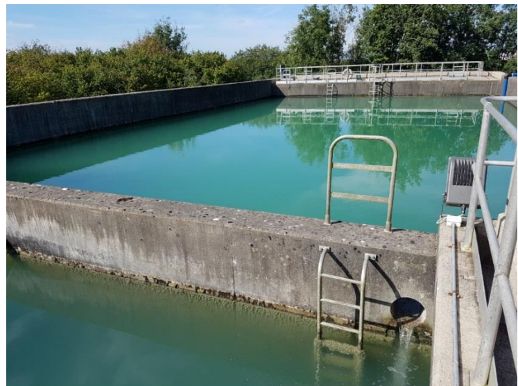
Photos 7 & 8 Redundant raw water balance tanks now in use to store supernatant allowing for additional settlement prior to discharge to Lough Corrib