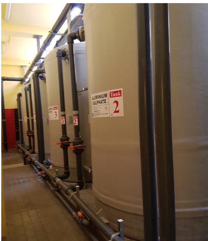
Photo 2 Alum tanks in use unbunded