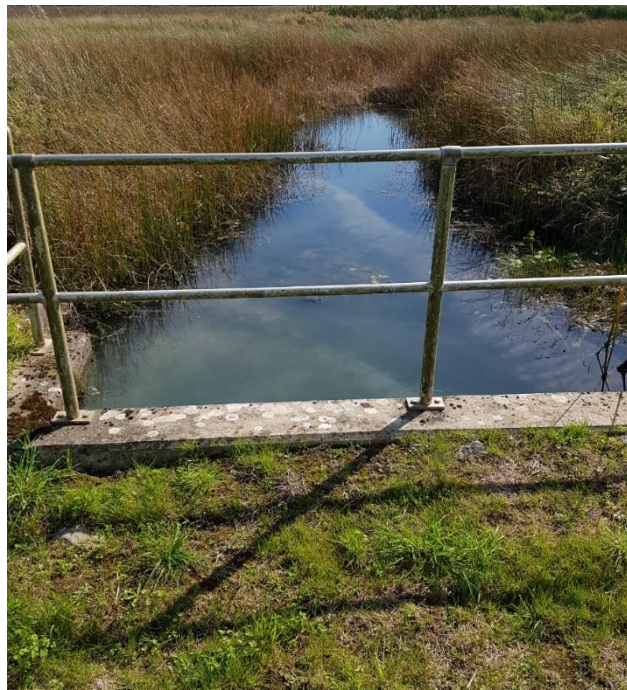
Photo 6 Sludge build up in drain to Lough Corrib at effluent/supernatant discharge point