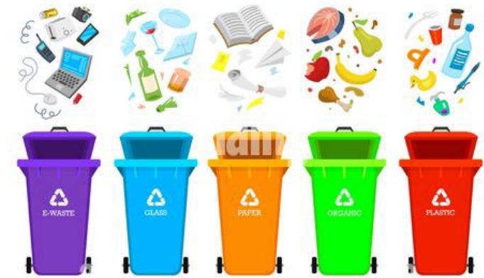
Food Waste Make-up