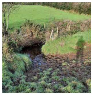
FIGURE 4: Raw water at Glaslough Tyholland PGS before implementing source protection measures.

The National Federation of Group Water Schemes works with private group schemes to protect and improve drinking water quality. They provide training to help private group schemes implement a water safety plan approach which is now required under the new Drinking Water Regulations (SI 99 of 2023). Its particular focus on integrated source protection planning (ISPP) has a dual benefit of improving drinking water quality and protecting natural water sources. The ISPP approach is welcomed by the EPA and is being implemented in a number of schemes around the country (see Figures 4 & 5).