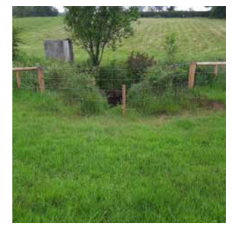
FIGURE 5: Raw water at Glasough Tyholland PGS after implementing source protection measures.