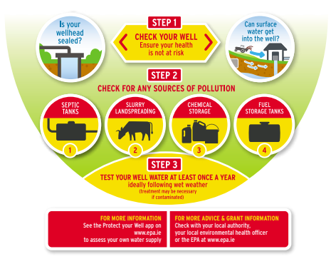
FIGURE 1: Steps to protect your well.

The water supplier (PGS or SPS) is legally responsible to ensure that all water supplied by them is wholesome and clean, does not present a risk to human health, and meets the requirements of the Drinking Water Regulations (SI 99 of 2023). Figure 1 below highlights steps that water suppliers with groundwater wells can take to protect their water supplies from contamination.