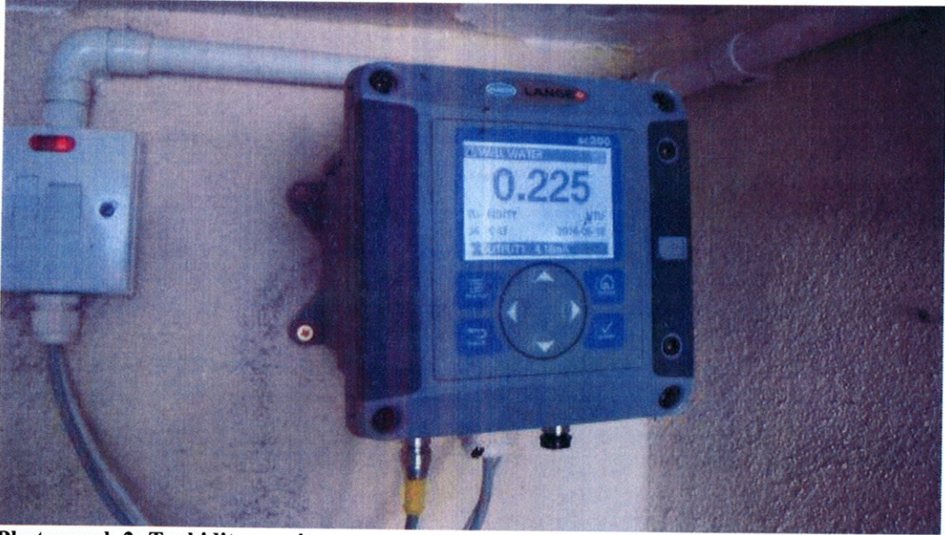
Photograph 2: Turbidity monitor