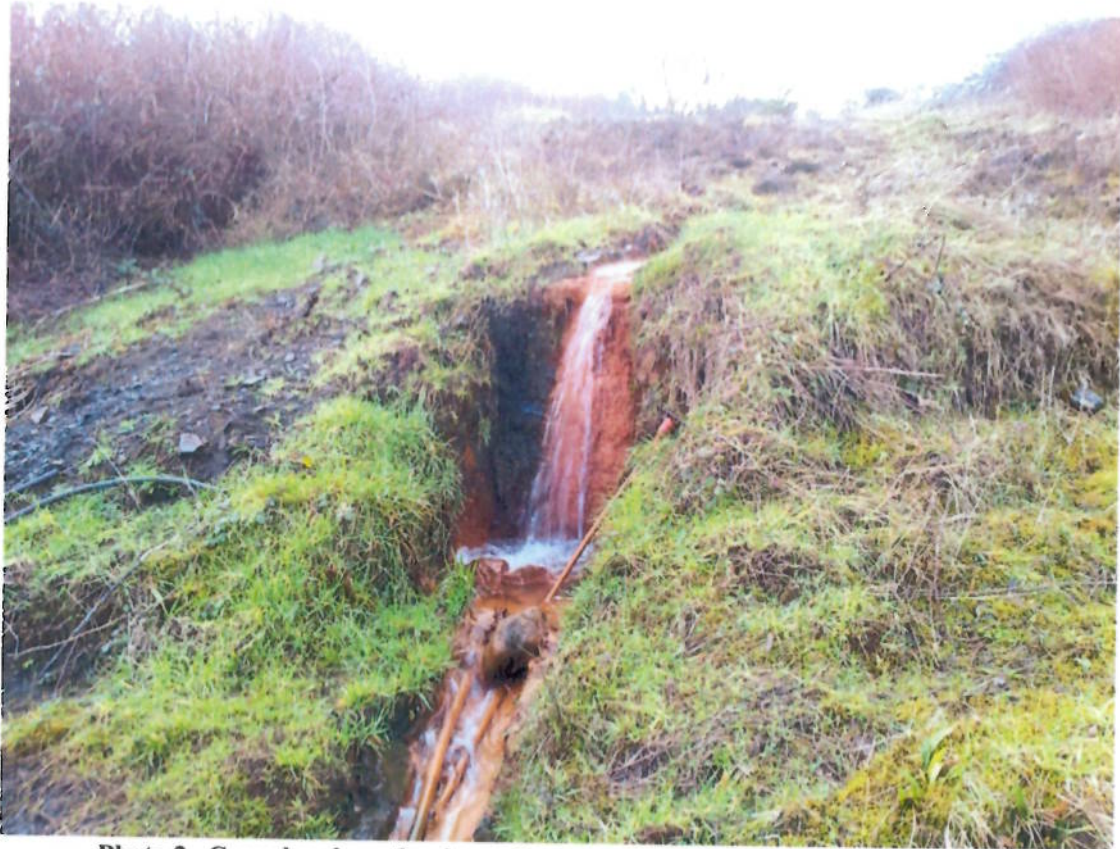
Photo 2. Cascades along the channelled stream prior to entry into the reservoir.