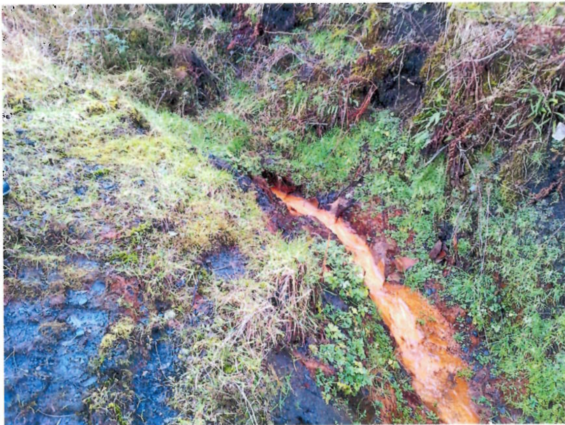
Photo 1. Source of the Treannagleragh PWS.