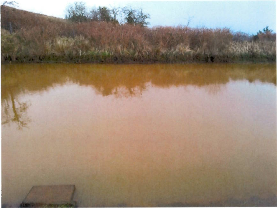
Photo 4. Open untreated reservoir supplying water to consumers of the Treannagleragh PWS.