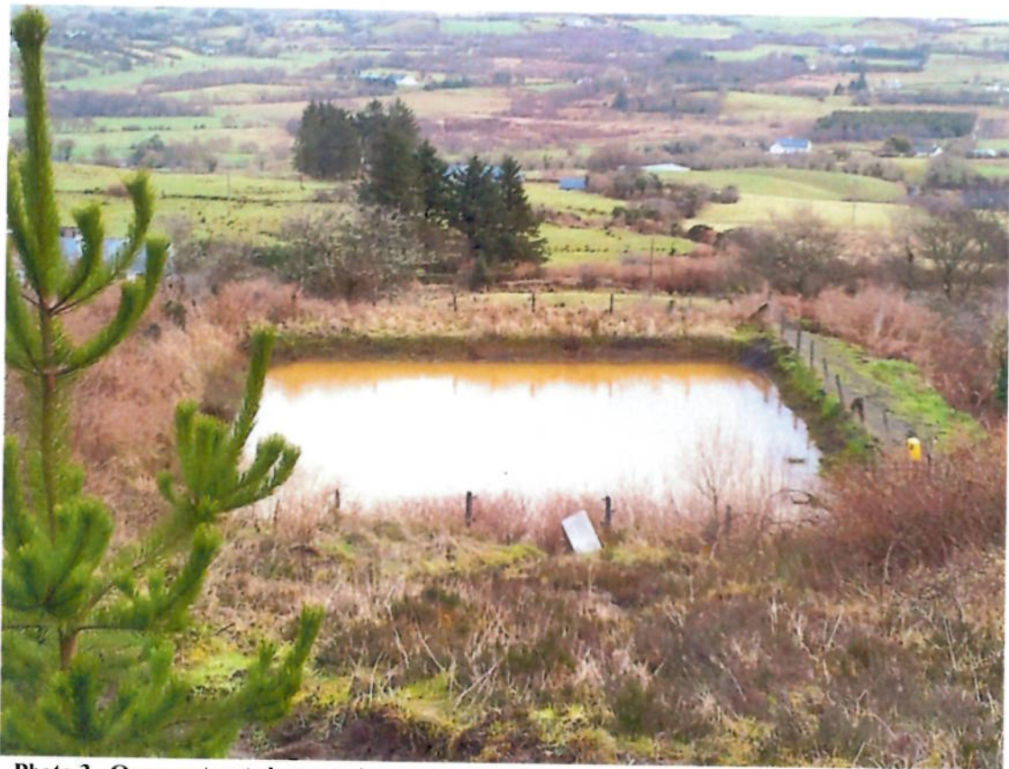
Photo 3. Open untreated reservoir supplying water to consumers of the Treannagleragh PWS.