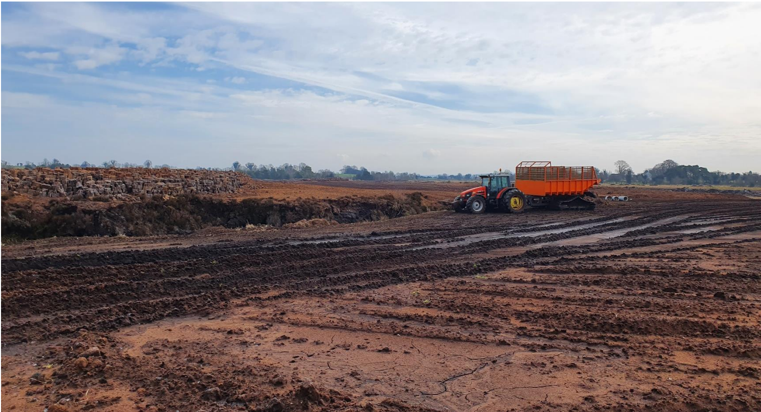
Photo 6: Tractor and tracked trailer for sod peat collection noted on the bog.