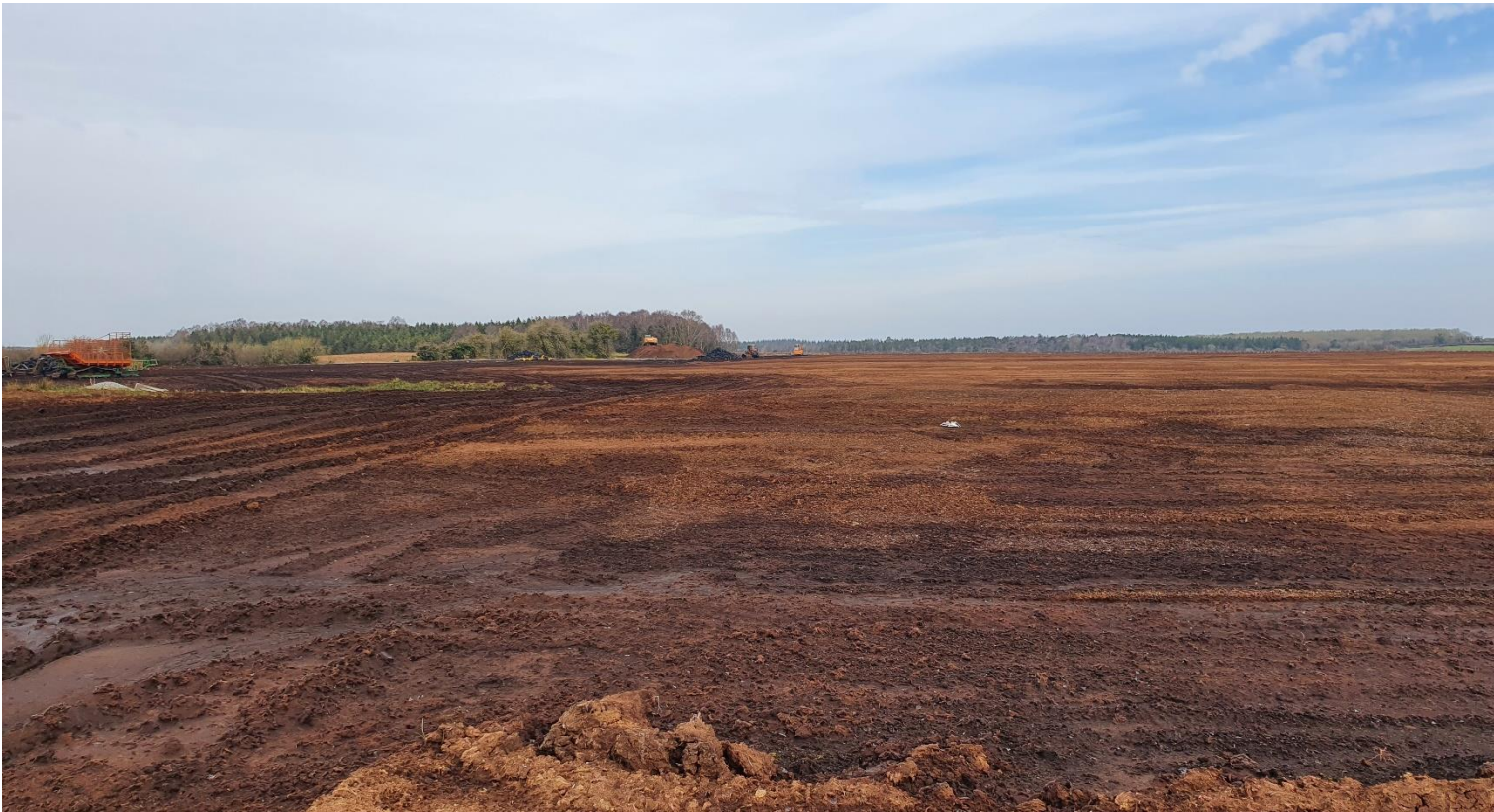
Photo 2: Milled peat area with stockpile of milled peat noted in the distance.