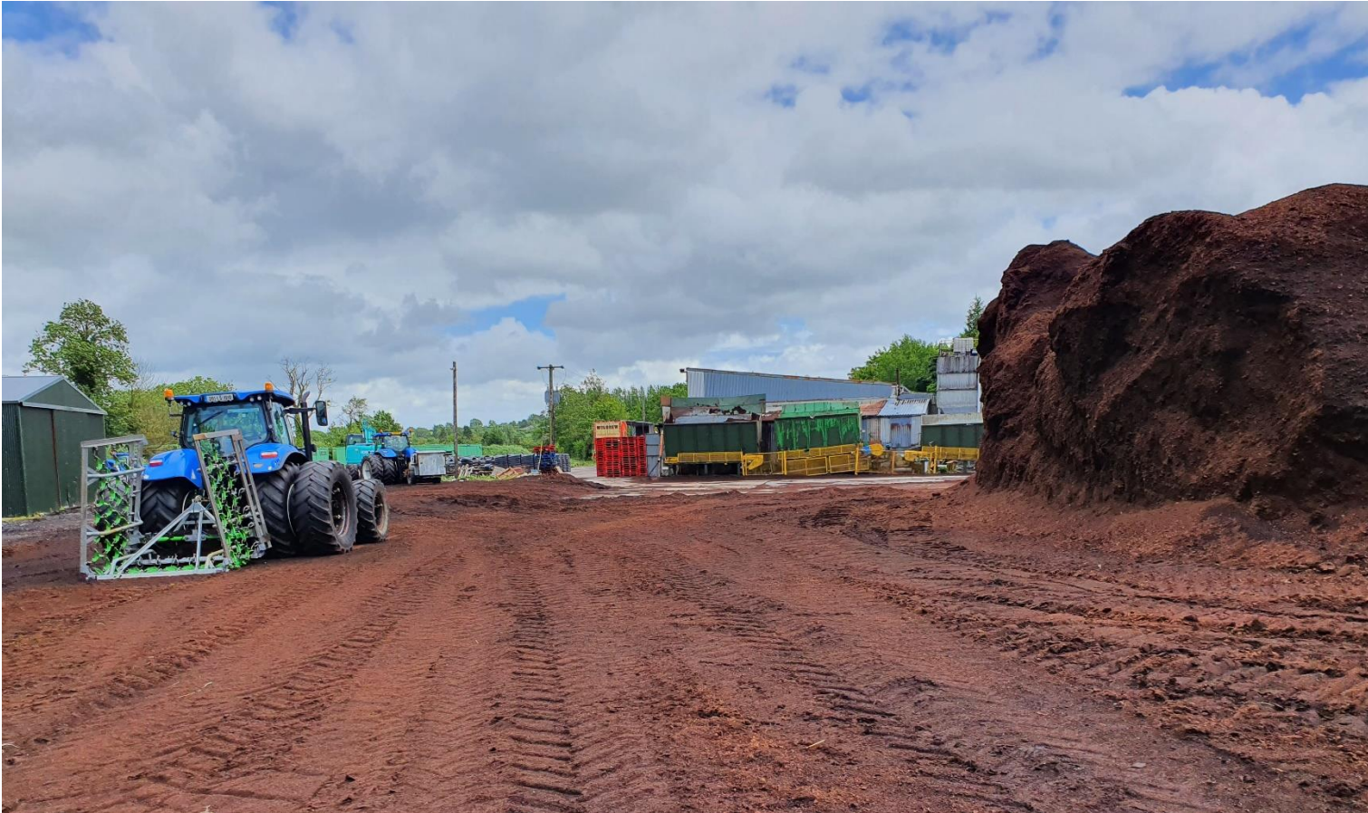
Photo 2: Peat harvesting equipment, peat processing/bagging plant and stockpile of peat noted at the site.