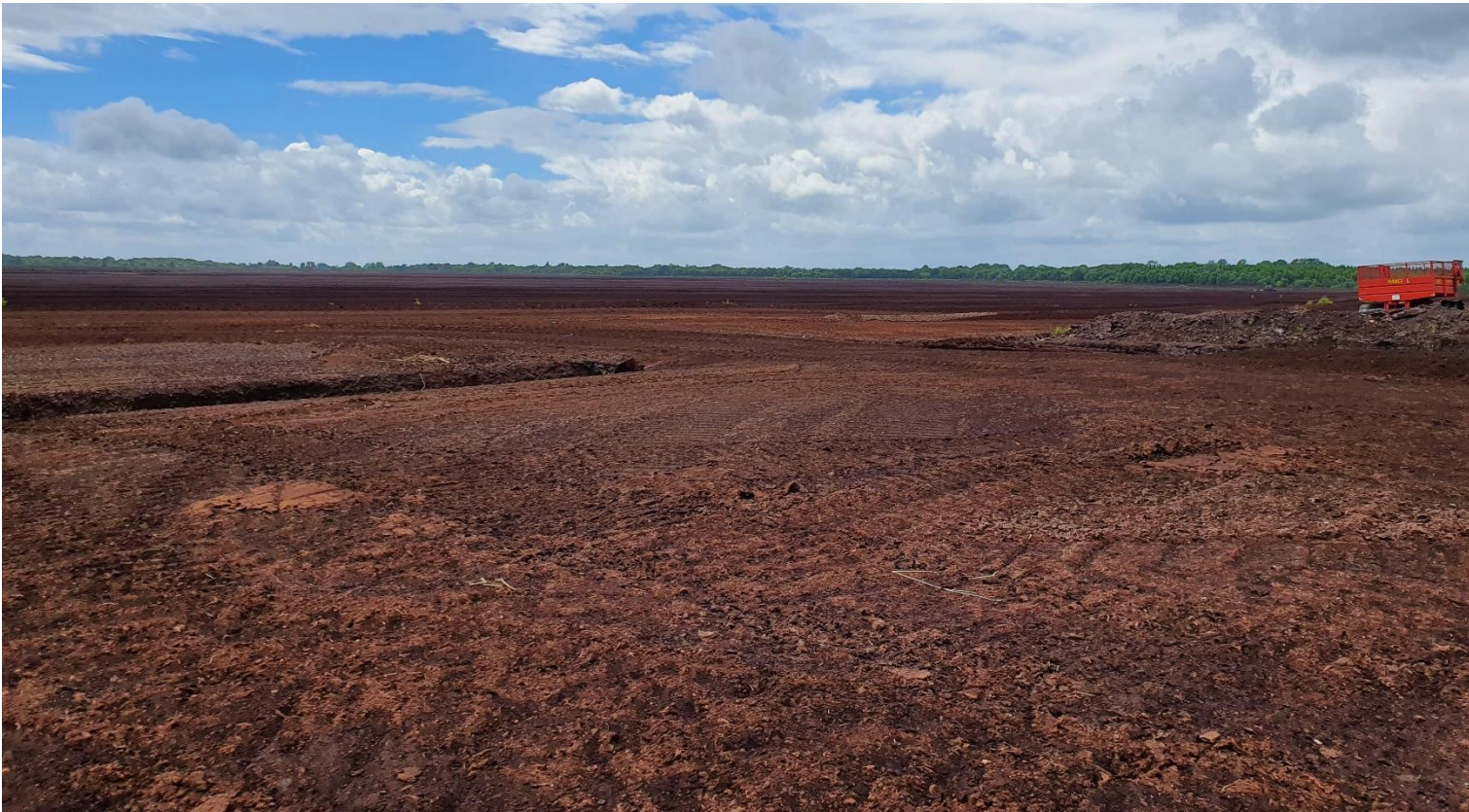
Photo 7: Peatland where milled peat was extracted, tractor operating in distance and peat harvesting equipment noted.