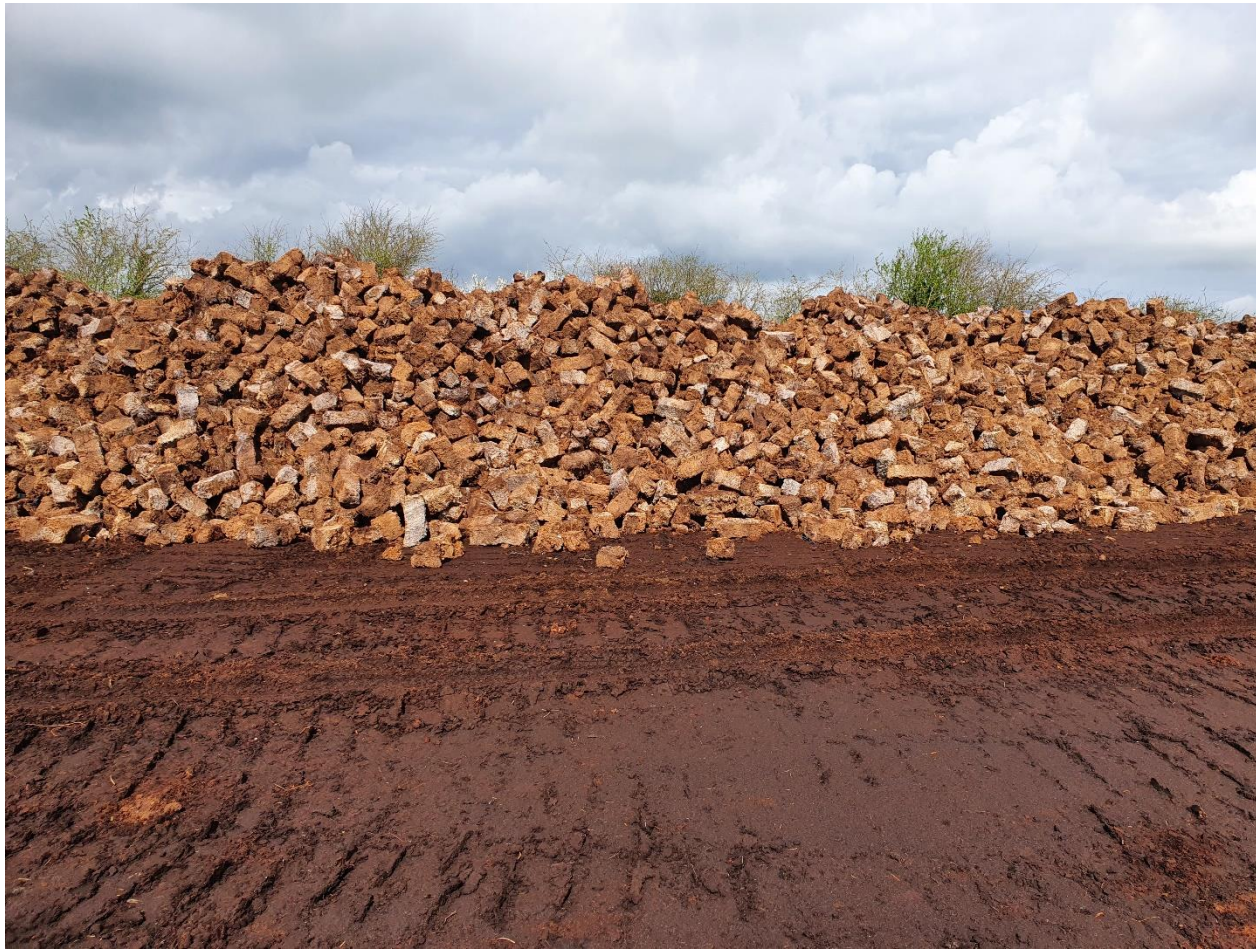
Photo 1: Recently collected stockpile of large sods noted on the bog.