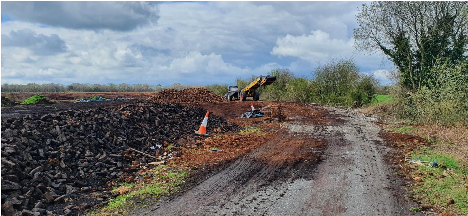
Photo 2: Escalator and tractor noted on the peatland for sod peat loading.