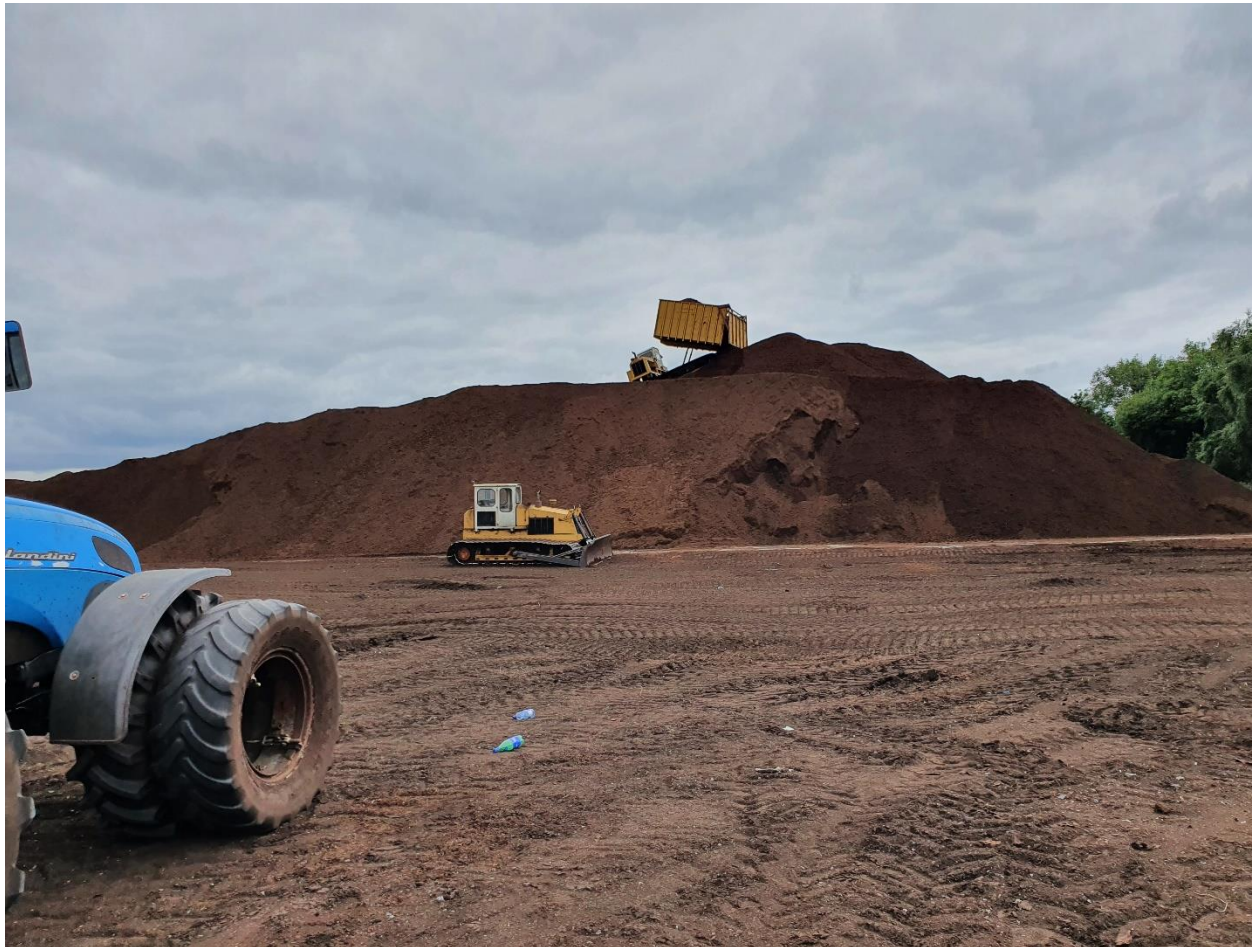
Photo 3: Tracked dumper unloading milled peat on top of the stockpile at the loading area.