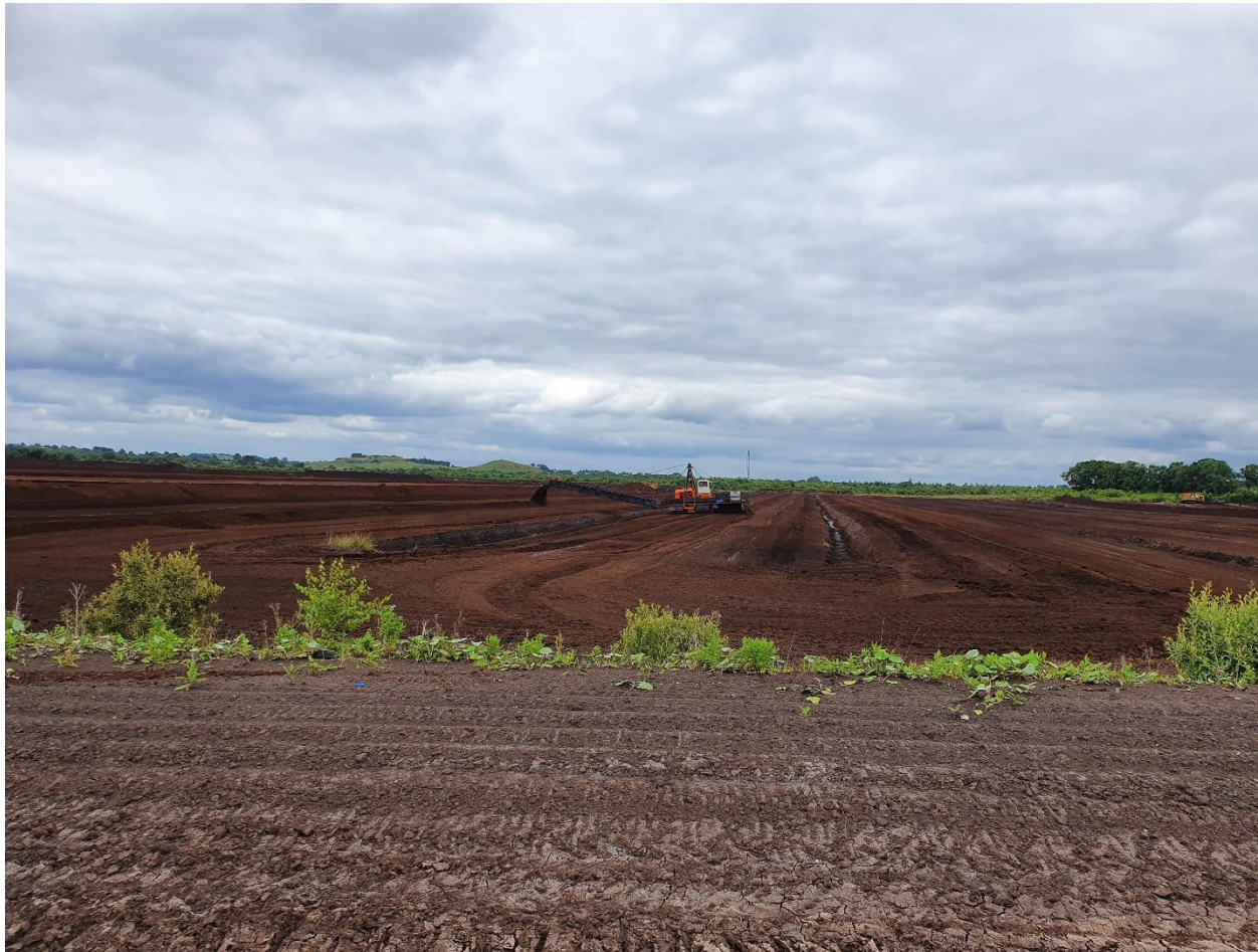
Photo 4: Collection of milled peat into stockpiles on the peatland.