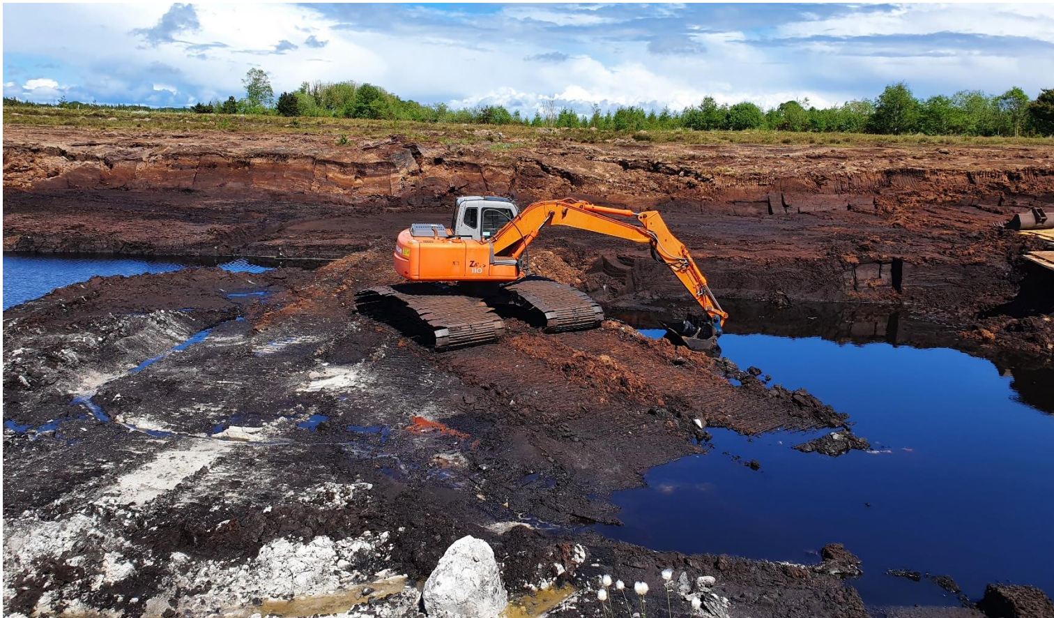
Photo 1: Excavator noted in the area where peat had been excavated.