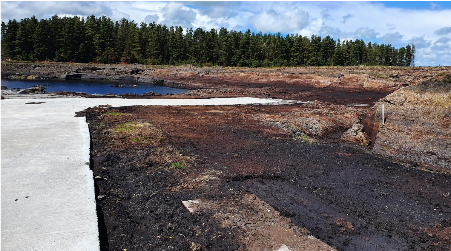
Photo 3: Permanent roadway constructed into the area where peat had been excavated.