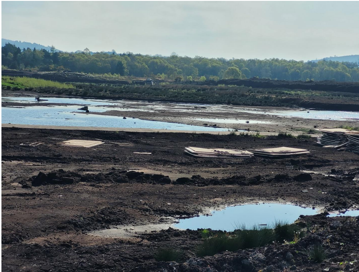
Photo 4: ponding of water, with water pump in the background noted at Area G.