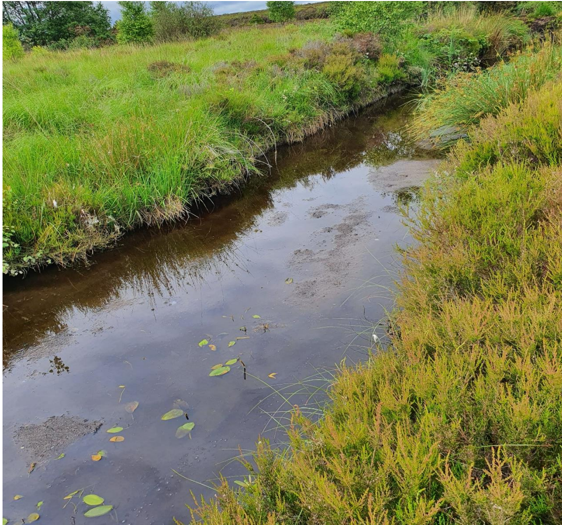
Photo 6: Siltation noted downstream of water abstraction pump outlet at Area G.