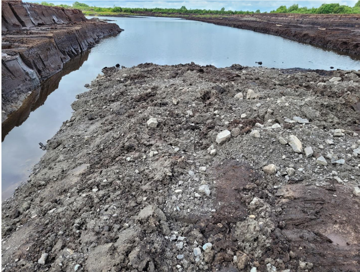
Photo 3: Peat extracted to the base of the peatland with significant ponding of water in the background (Area G).