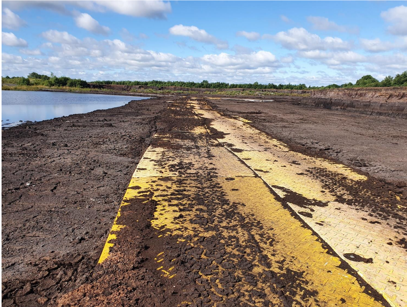
Photo 2: Section of temporary roadway remaining in place at Area G.