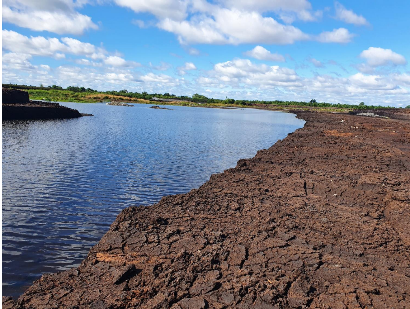
Photo 1: Ongoing significant ponding of water noted within Area G.