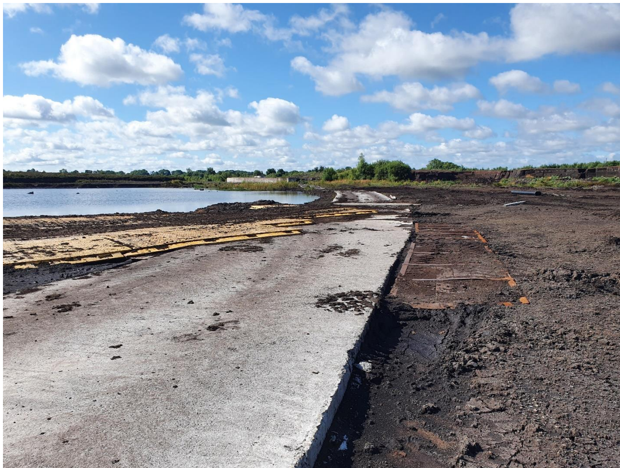
Photo 3: Section of permanent roadway leading to loading area at Area G.