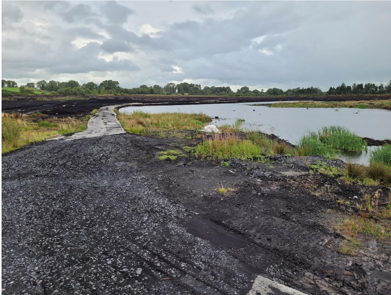
Photo 1: Ongoing significant ponding of water noted within Area G.