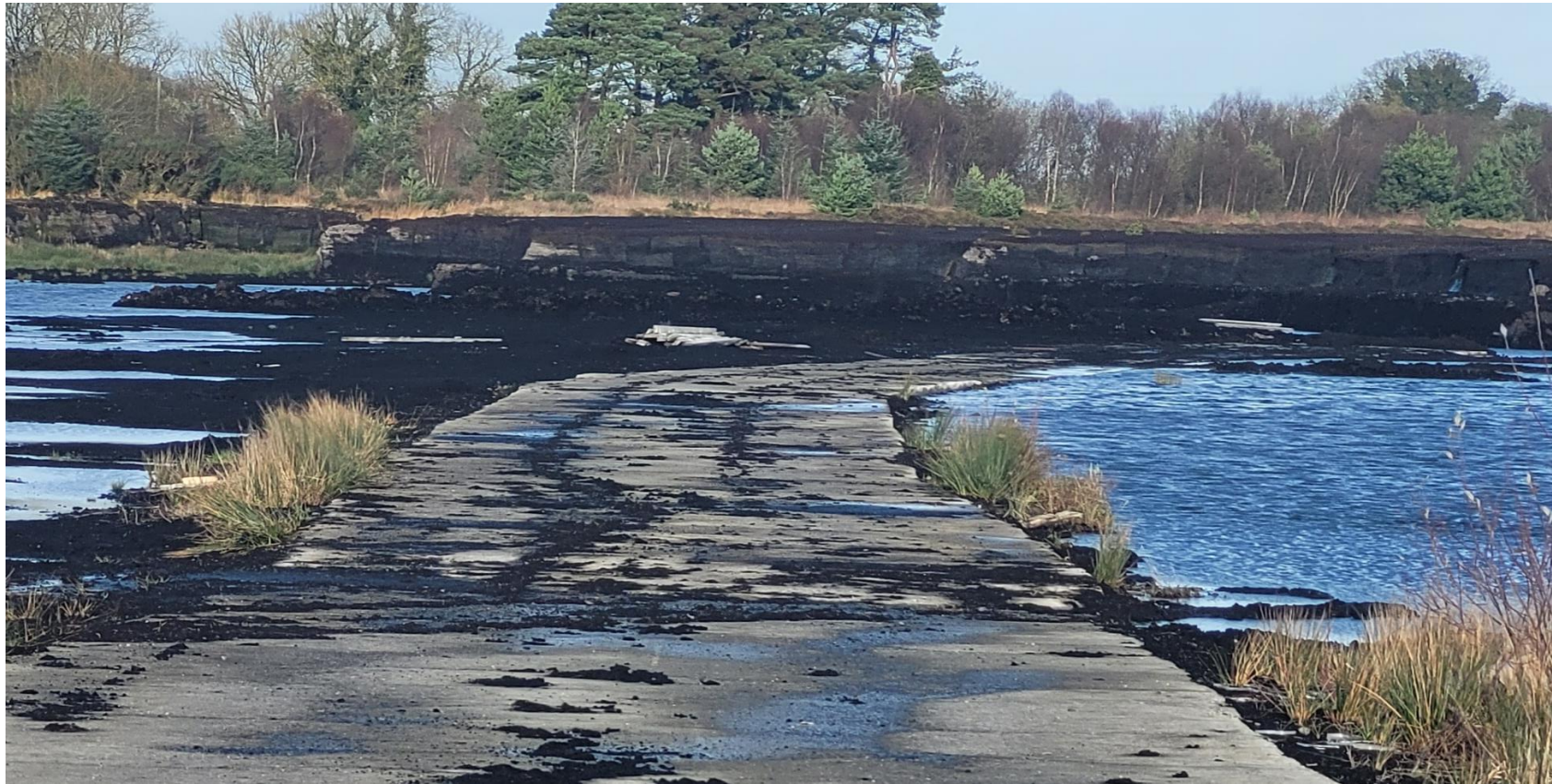
Photo 3: Water level lapping the edge of the haul road to Area G, 24 th November 2022.