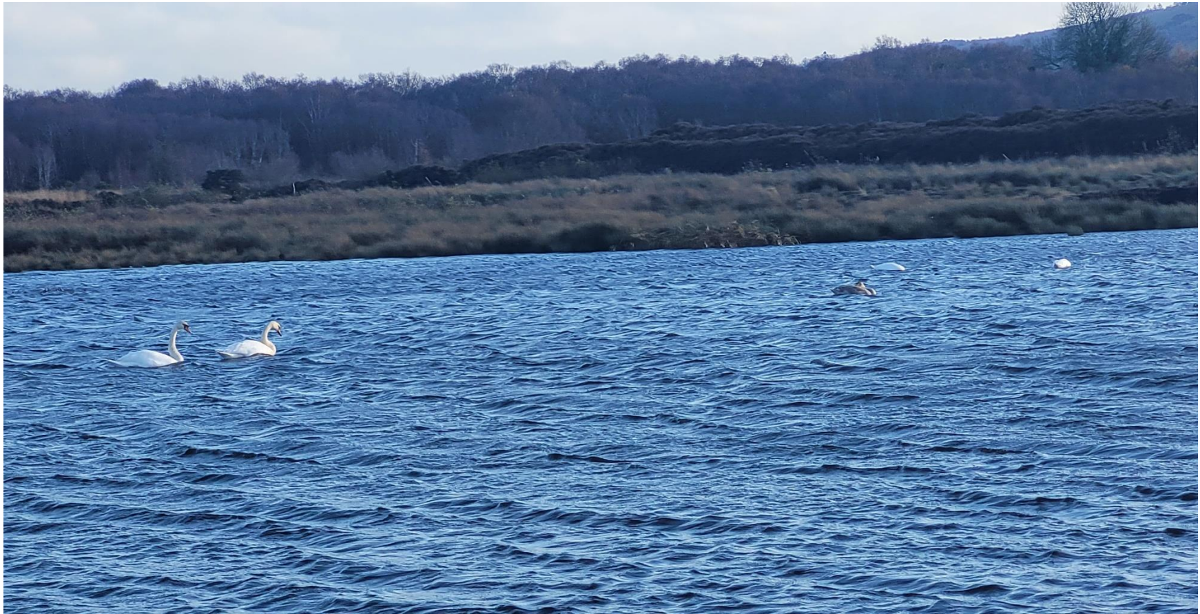
Photo 4: Significant water body forming 24 th November 2022, at Area G.