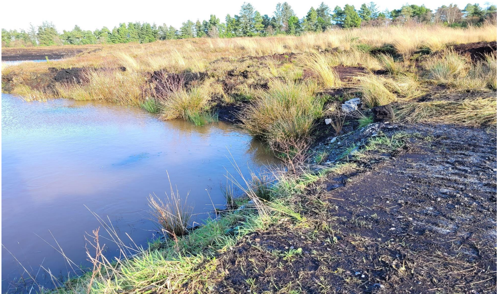
Photo 5: Location where the water pump was previously located in Area G (24 th November 2022).