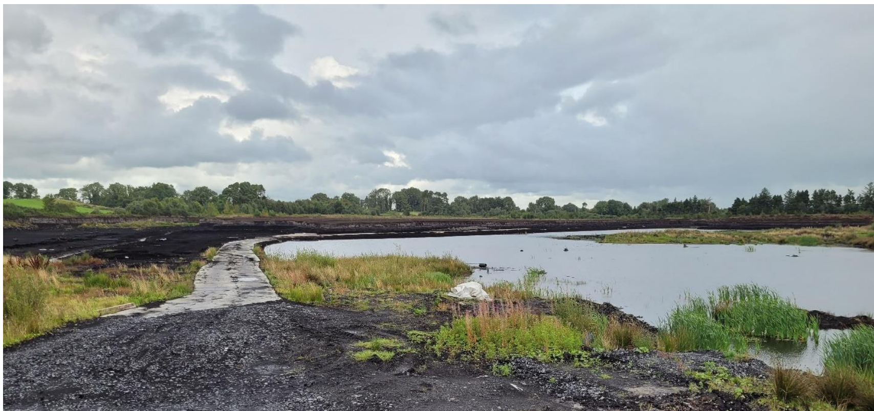
Photo 1: Significant ponding of water noted within Area G (7 th September 2022 visit).