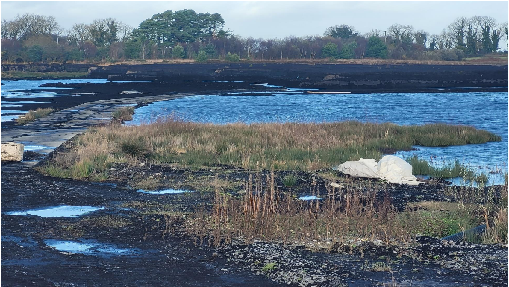
Photo 2: Significant ponding of water noted within Area G (24 th November 2022 visit).