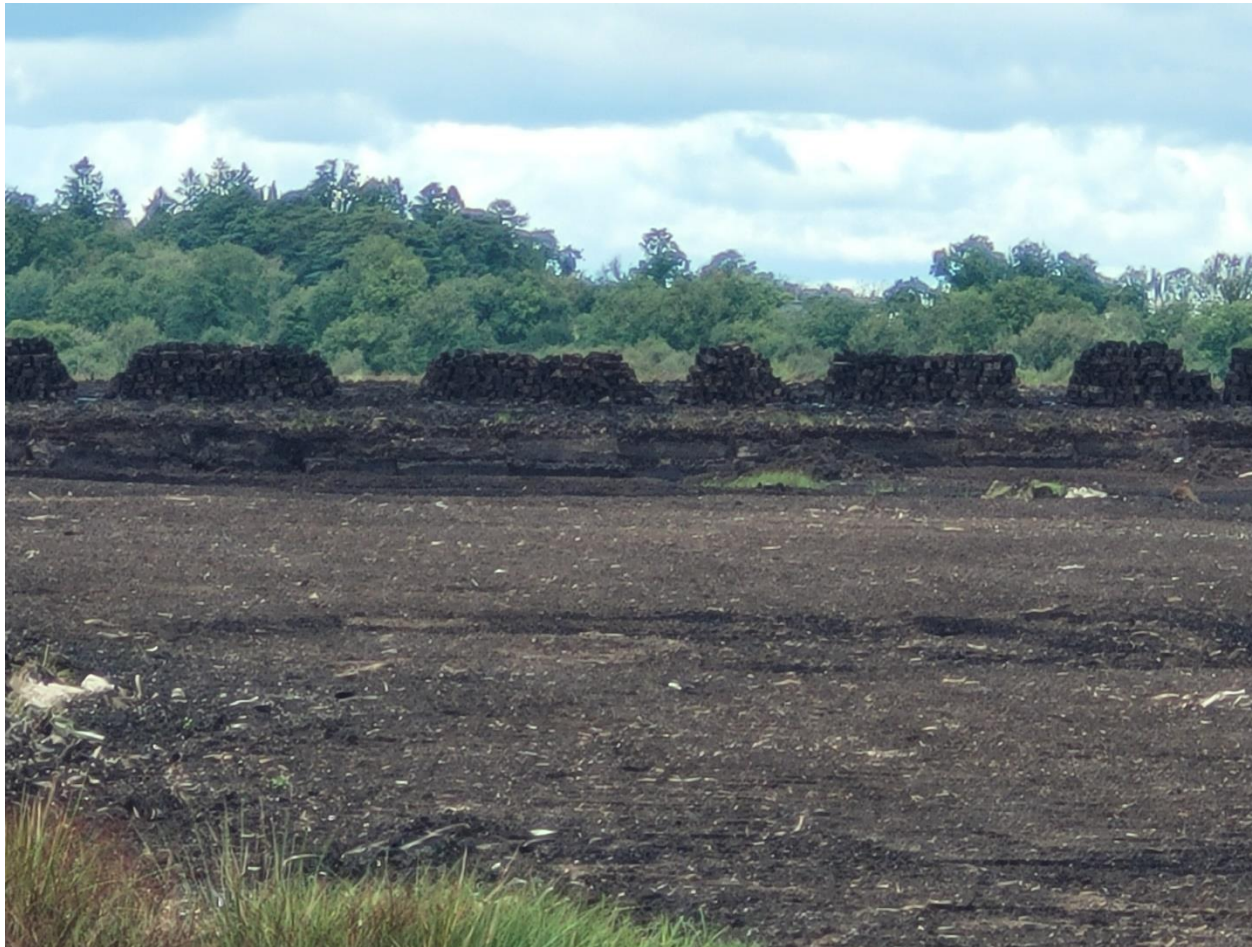
Photo 5: Excavated large sod peat left out on the peatland for drying.