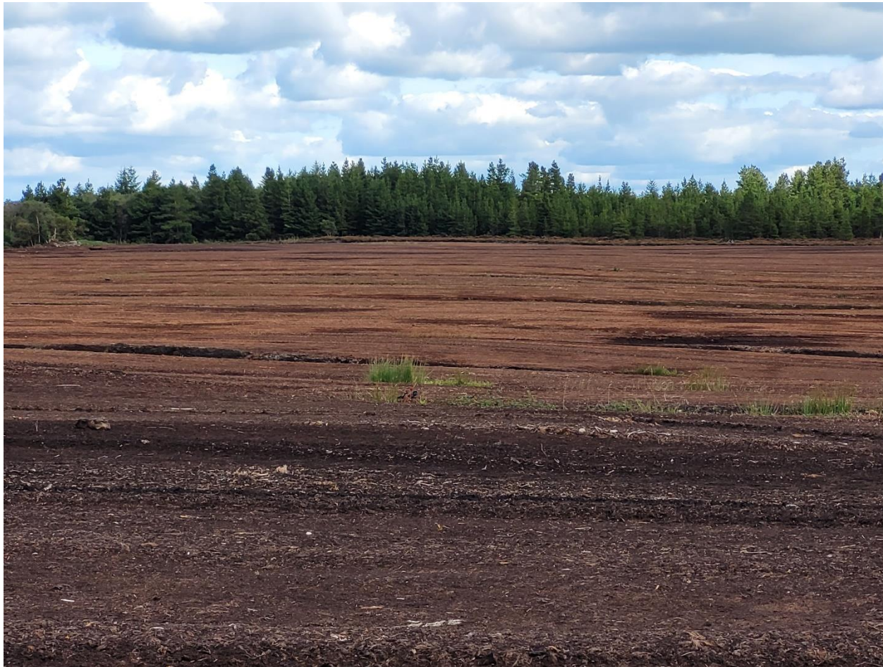
Photo 1: Recent milled peat area noted at the eastern side of the peatland.