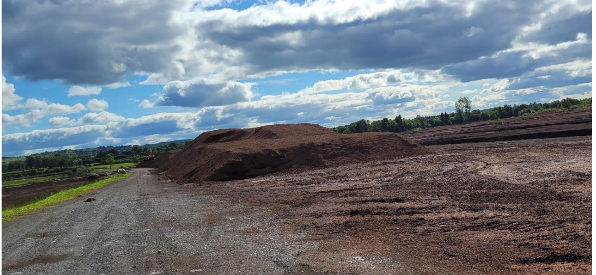
Photo 6: Significant stockpiles of milled peat noted during the visit.