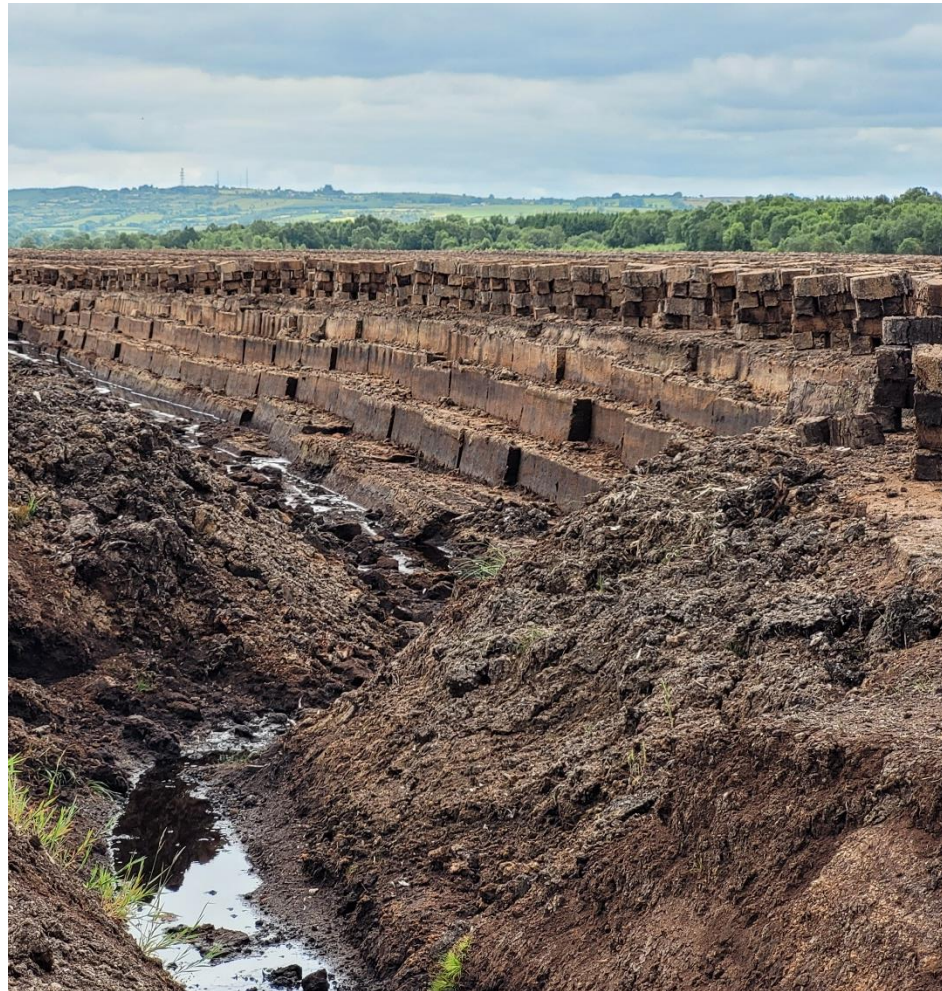
Photo 4: Recently excavated large sod peat left out on the peatland for drying noted.