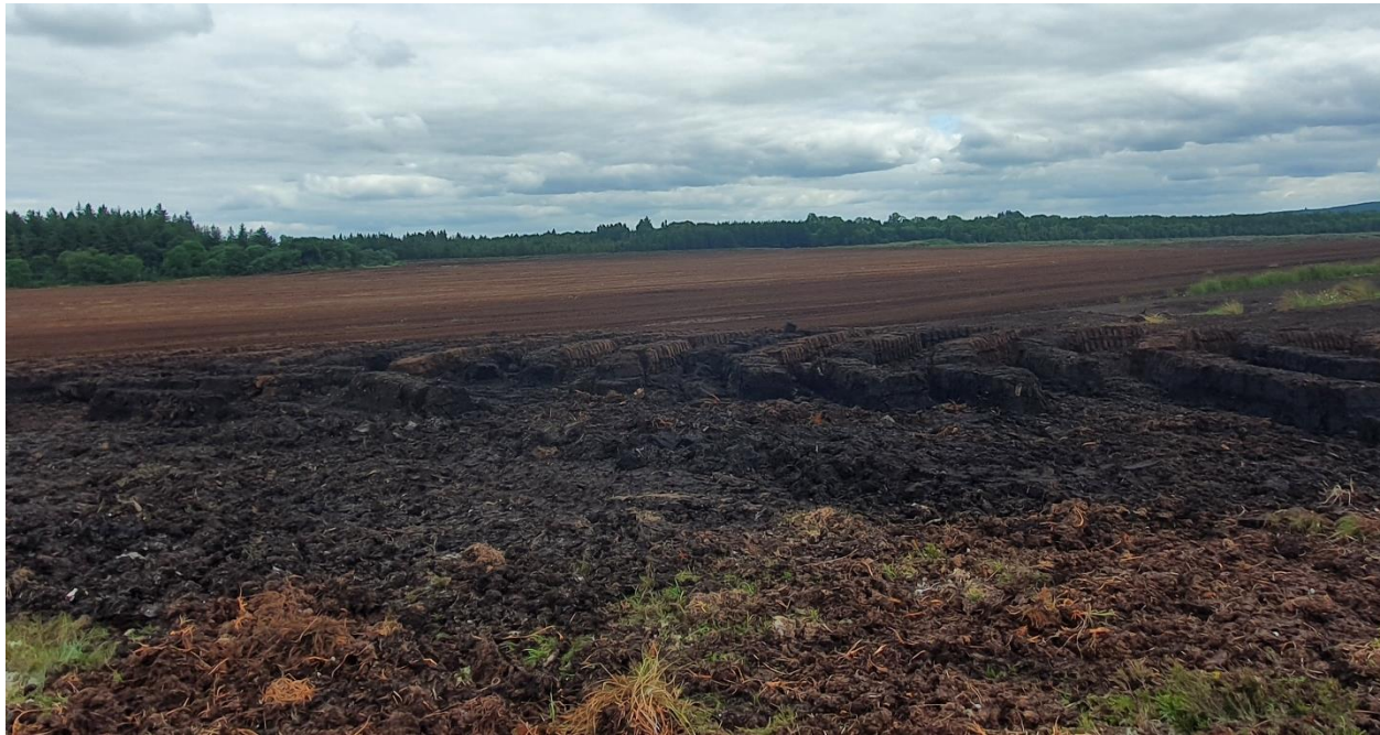
Photo 1: Recent sod and milled peat noted at northern section of the peatland.