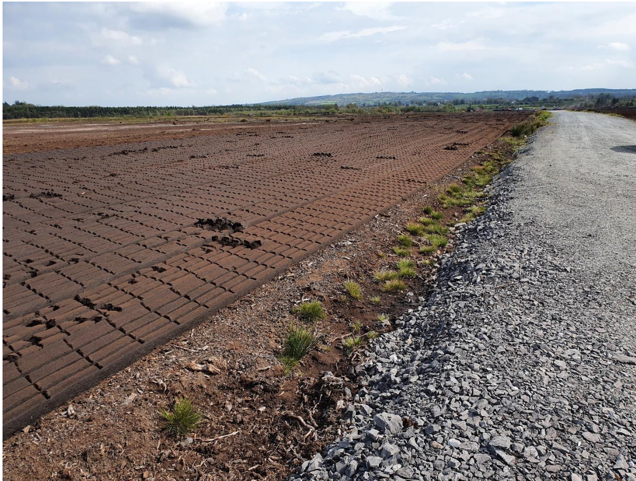
Photo 4: Recently excavated hopper peat spread out on the peatland for harvesting noted.