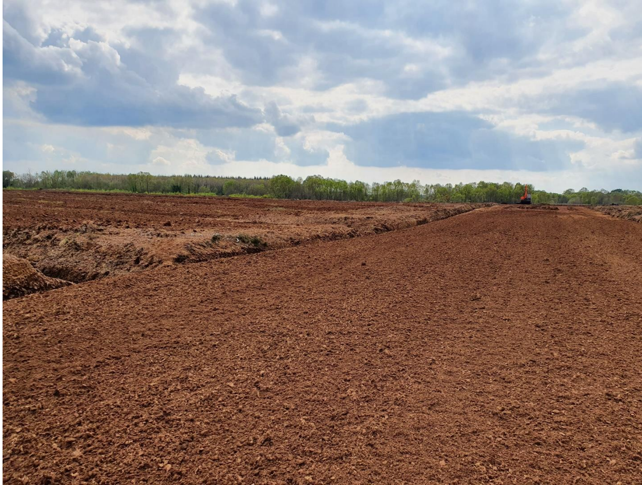
Photo 3: Milled peat with excavator in the distant background preparing for sod peat excavation noted