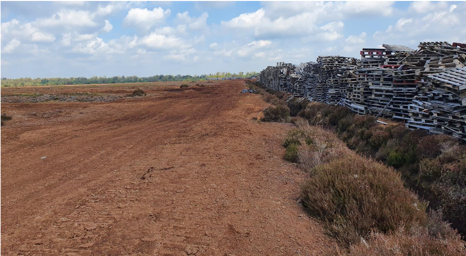
Photo 1: Stockpile of pallets with sod peat covered with plastic in distant background (Area 4).