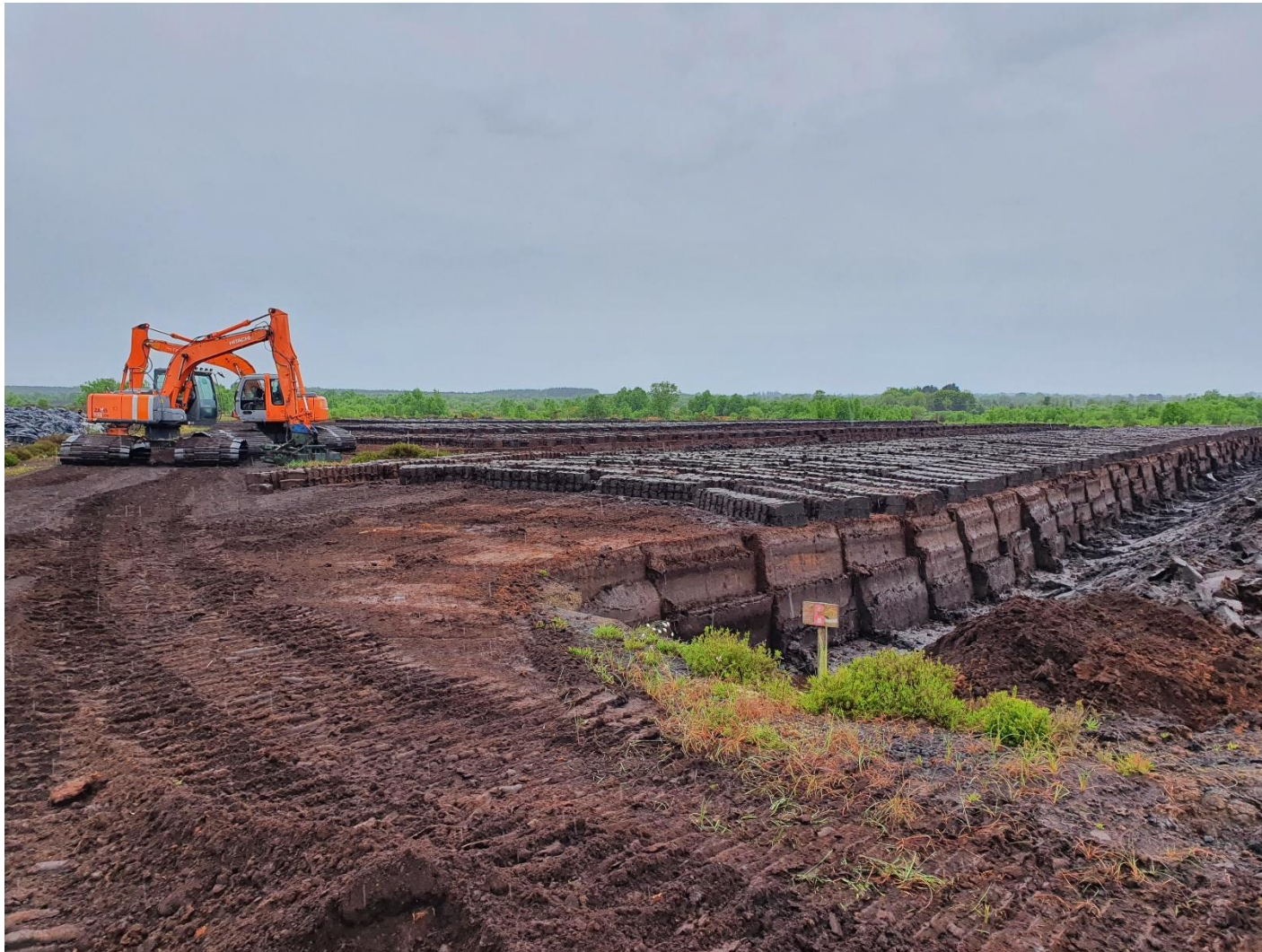
Photo 2: Sod peat excavators stopped working shortly after arrival onto peatland at Area 4.