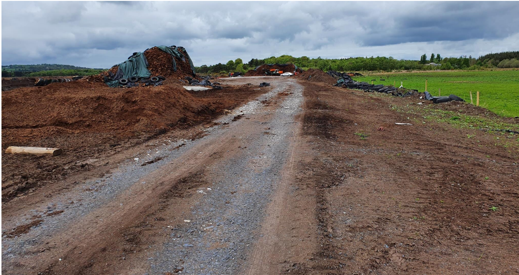
Photo 1: Remains of peat stockpiles (sod and milled peat) noted at the loading area.