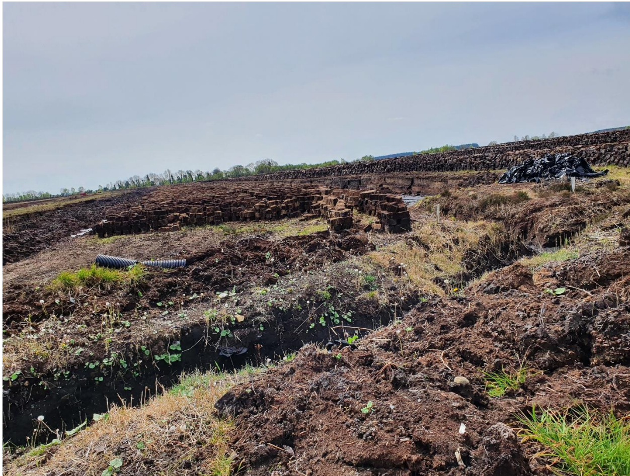
Photo 5: Sod peat left out and turned for drying noted on the bog.