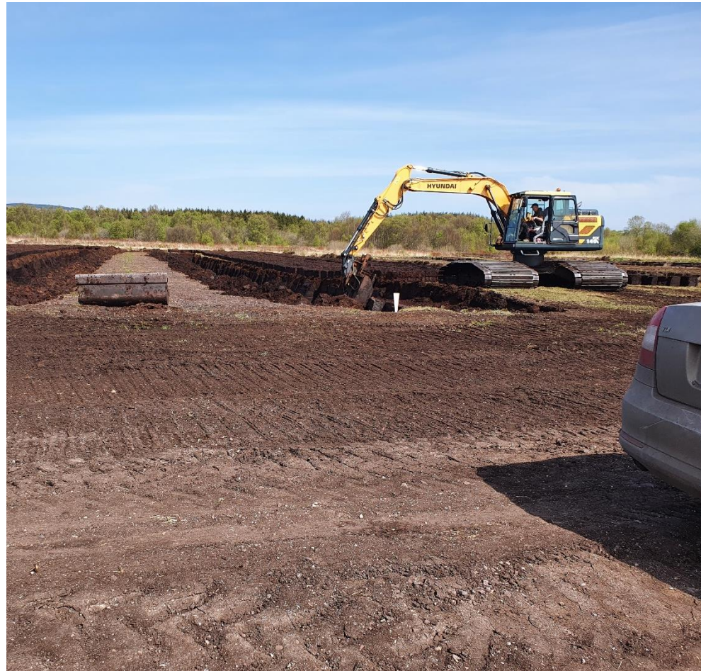
Photo 1: Sod peat excavation noted to be ongoing during the visit .