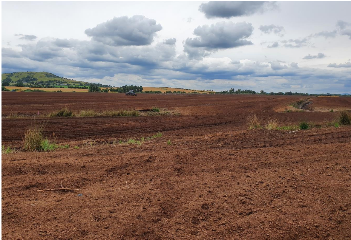
Photo 1: Two tractors with peat harvesting machinery noted to be working on the peatland.