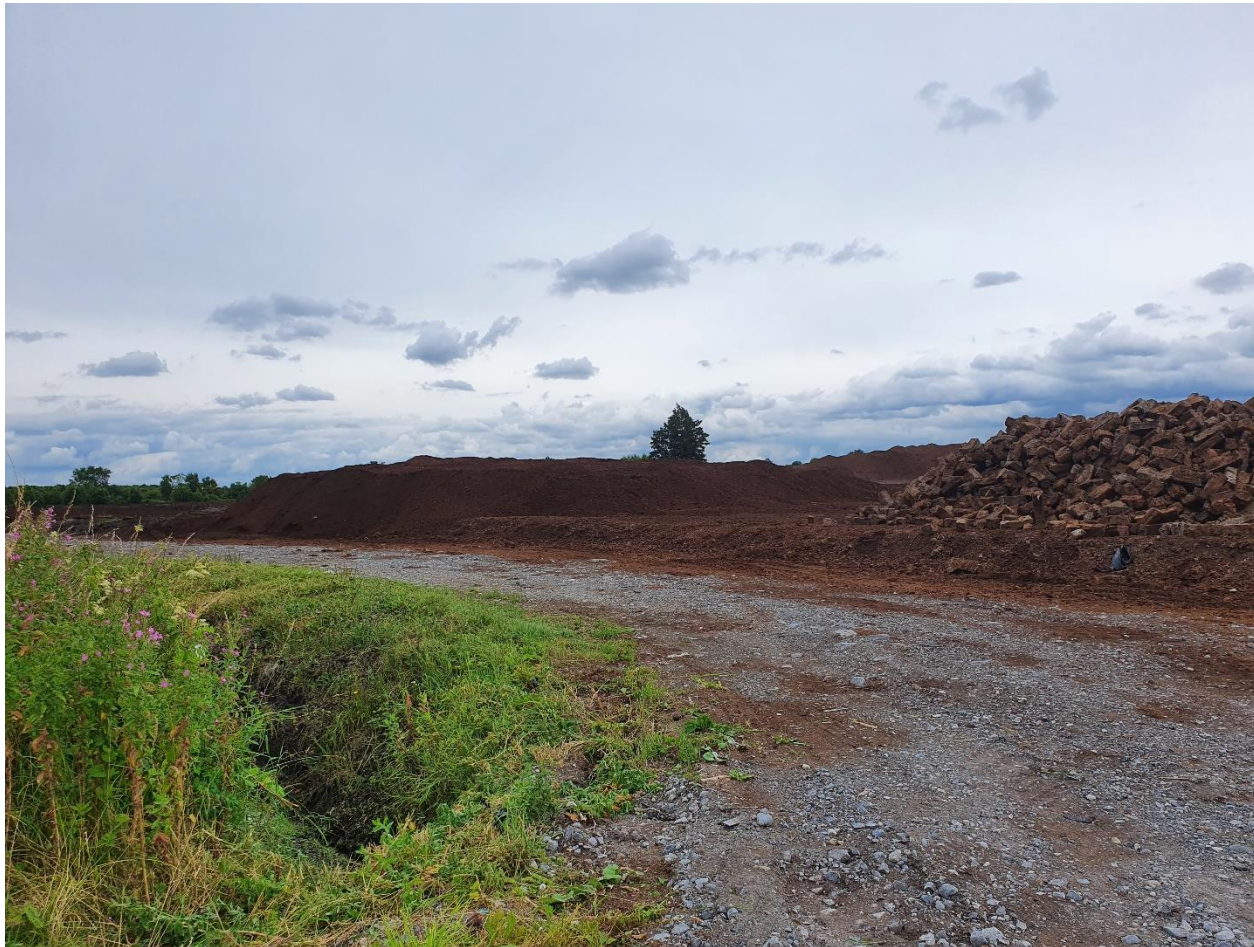
Photo 2: Stockpiles of milled peat and sod peat adjacent to the public road noted on the peatland.