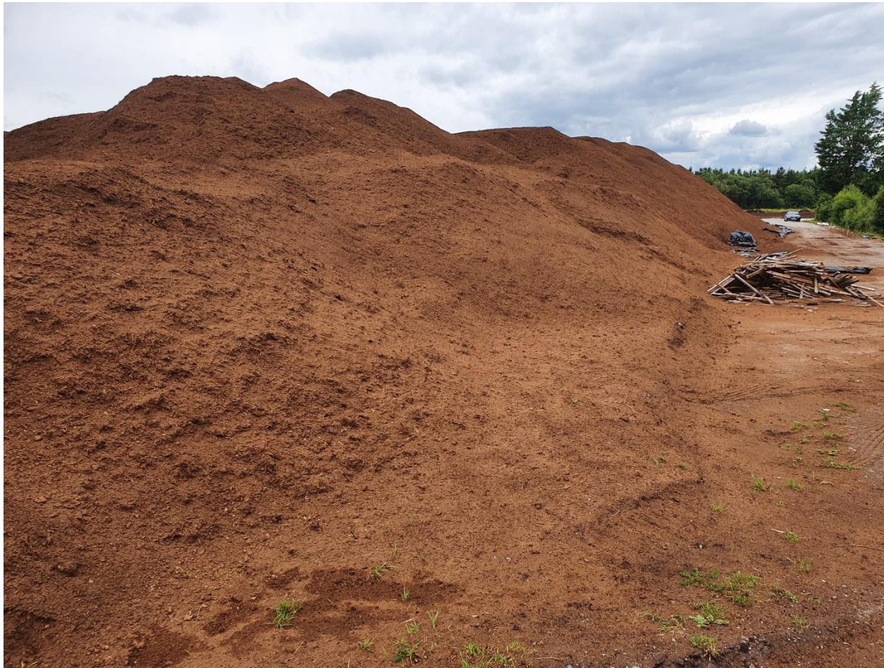
Photo 3: Large stockpile of milled peat noted at northern end of the peatland.