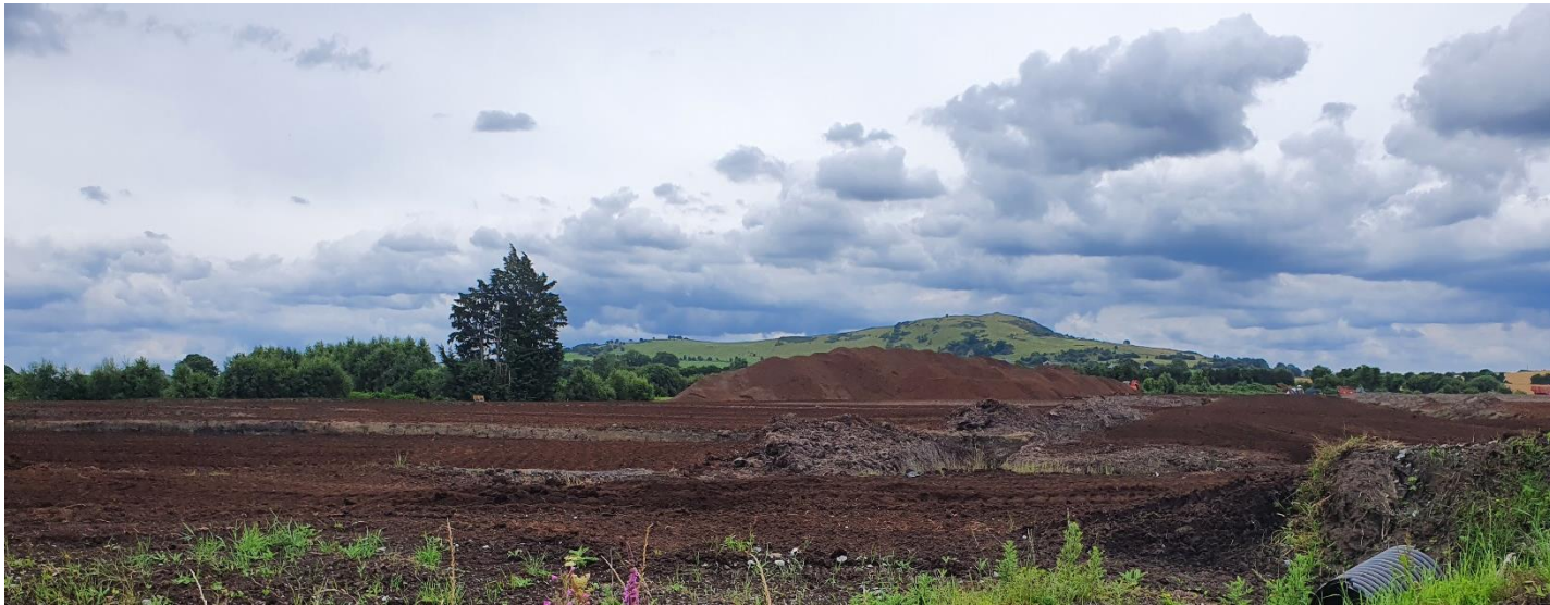
Photo 4: Large stockpile of milled peat at the northern end of the peatland.