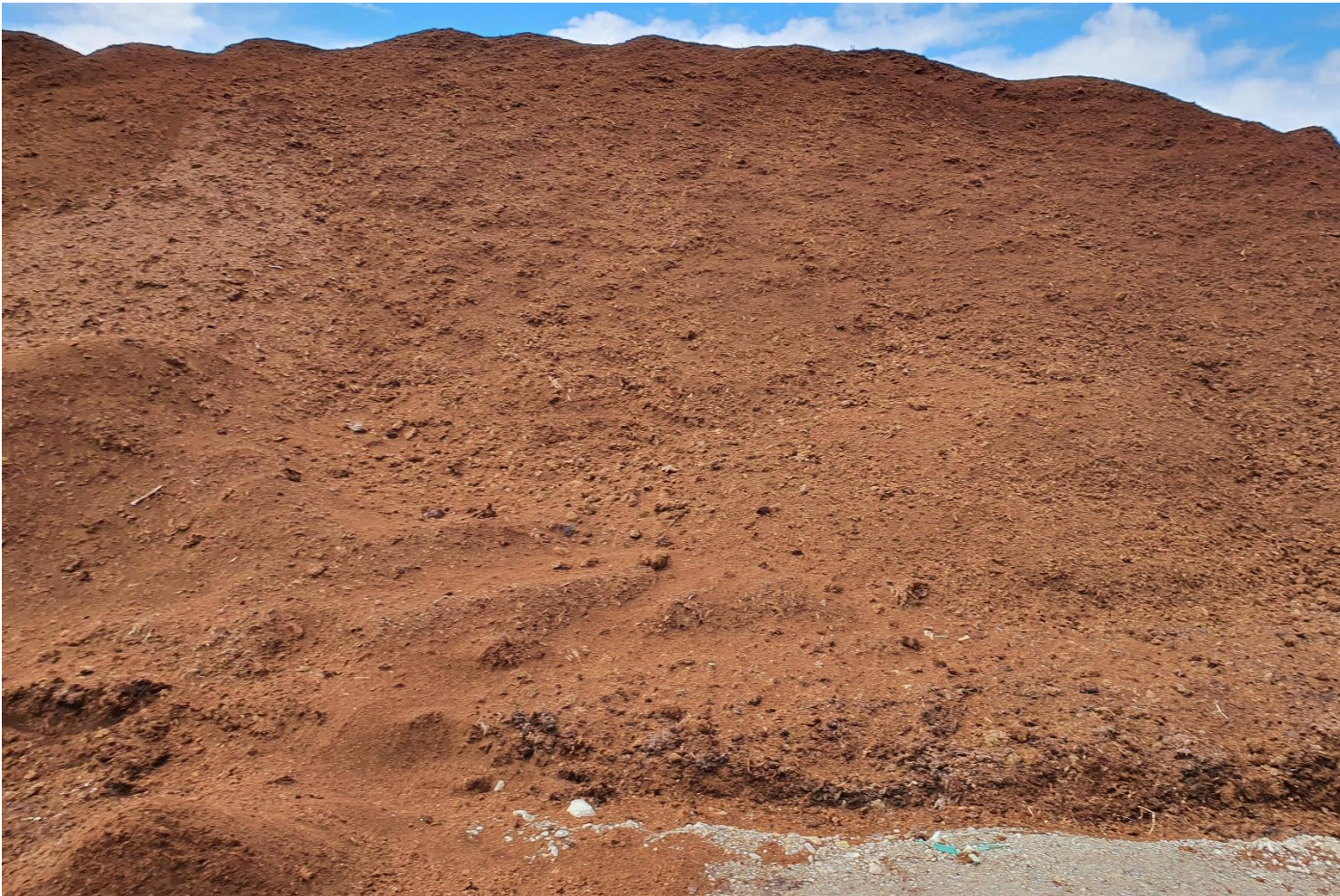
Photo 1: Significant stockpile of milled peat at the northern section of the peatland.