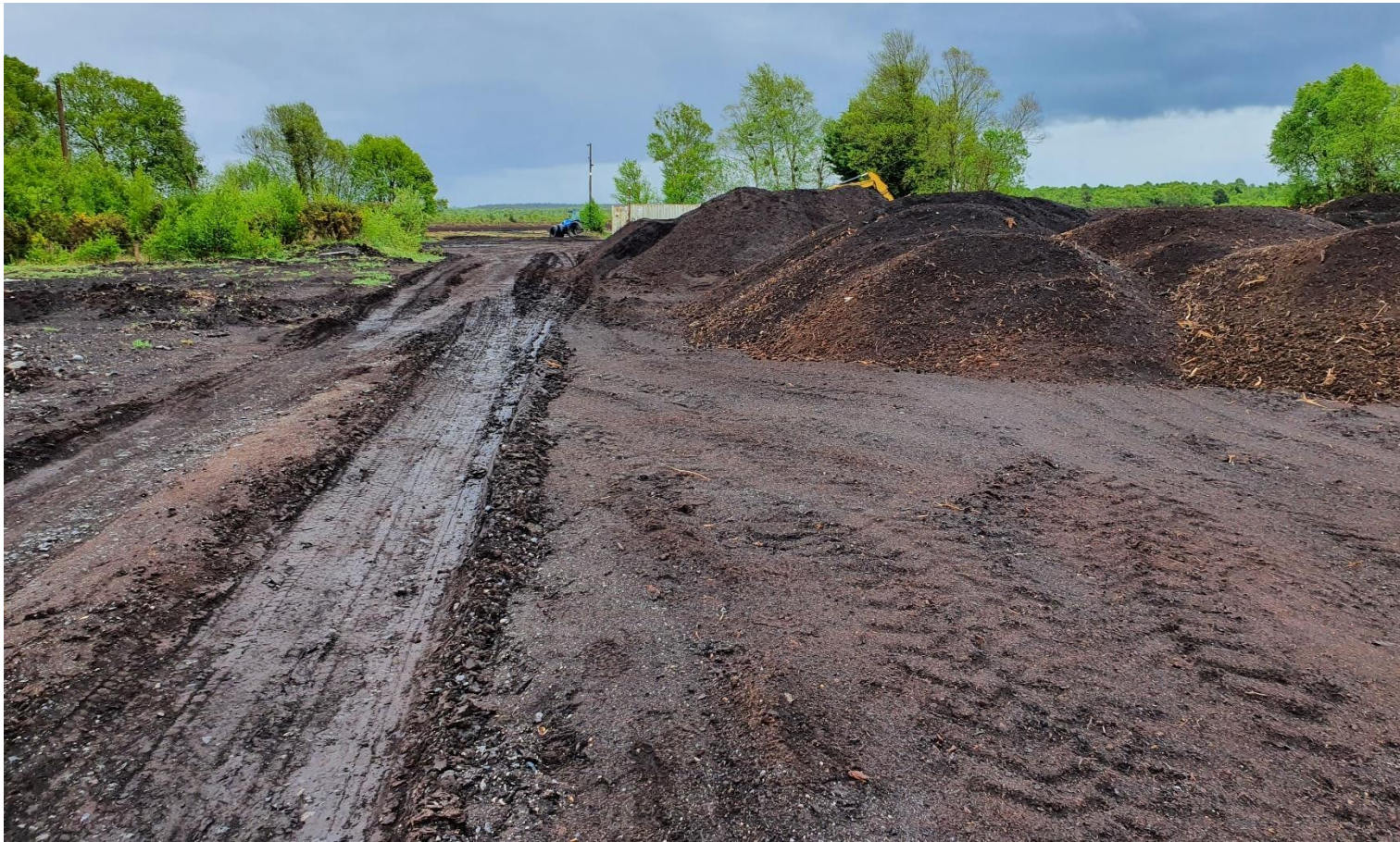
Photo 3: Stockpile of milled peat noted adjacent to the entrance to the peatland.