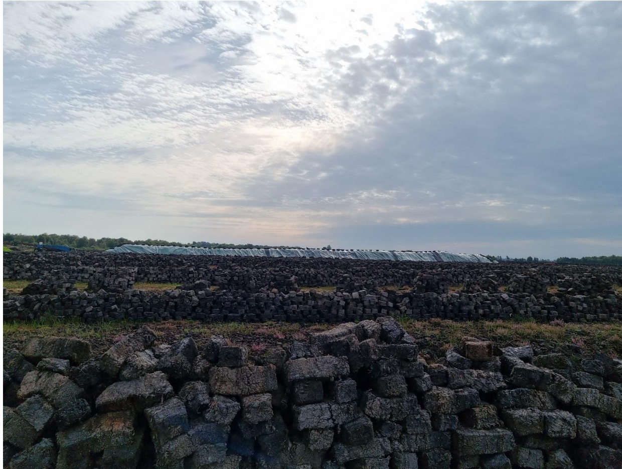
Photo 1: Large sod peat stacked for drying on the peatland with covered large sod peat stockpile noted in the distance.