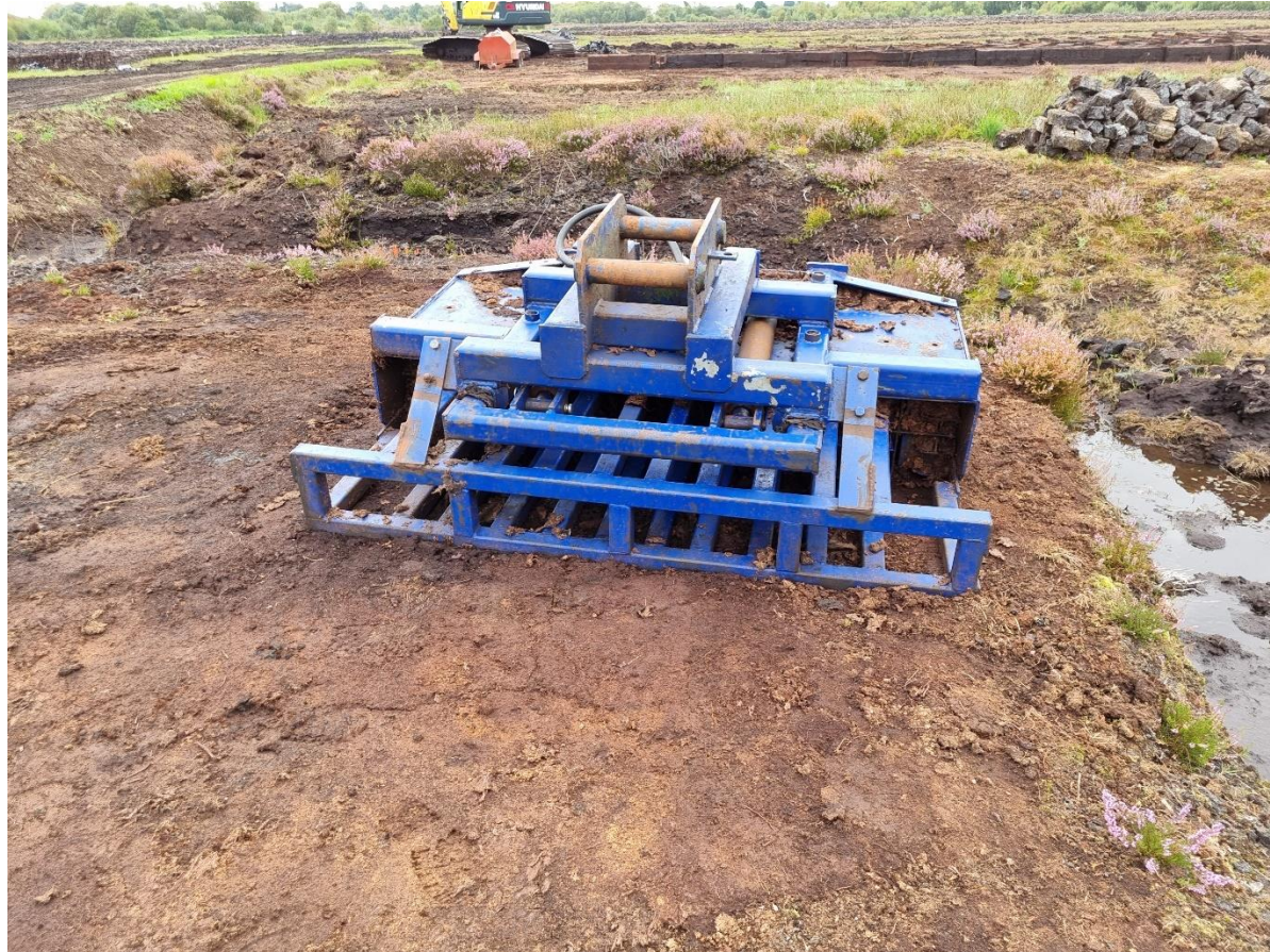
Photo 4: Attachment for large sod peat excavation noted on the peatland.