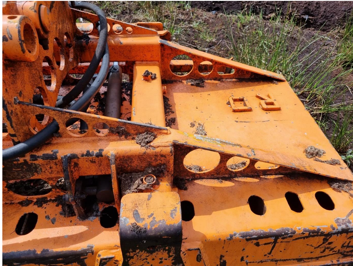
Photo 3: Attachment for excavation of large sod peat noted on the peatland.