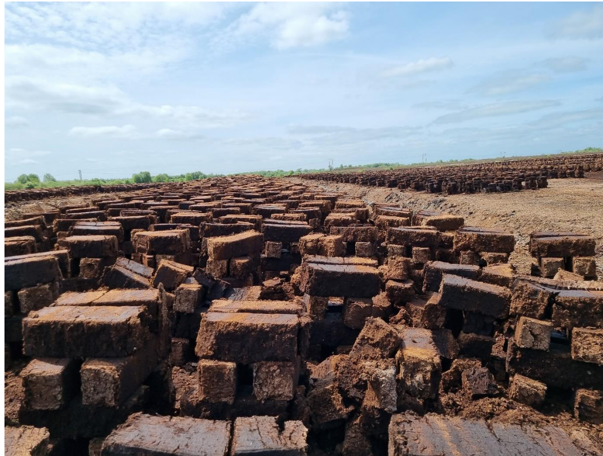
Photo 1 : Large sod peat which was excavated and left on the peatland to dry.