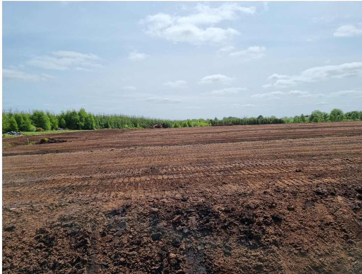
Photo 4: Recently cleared area at southern section of peatland, with excavator noted in the distance.