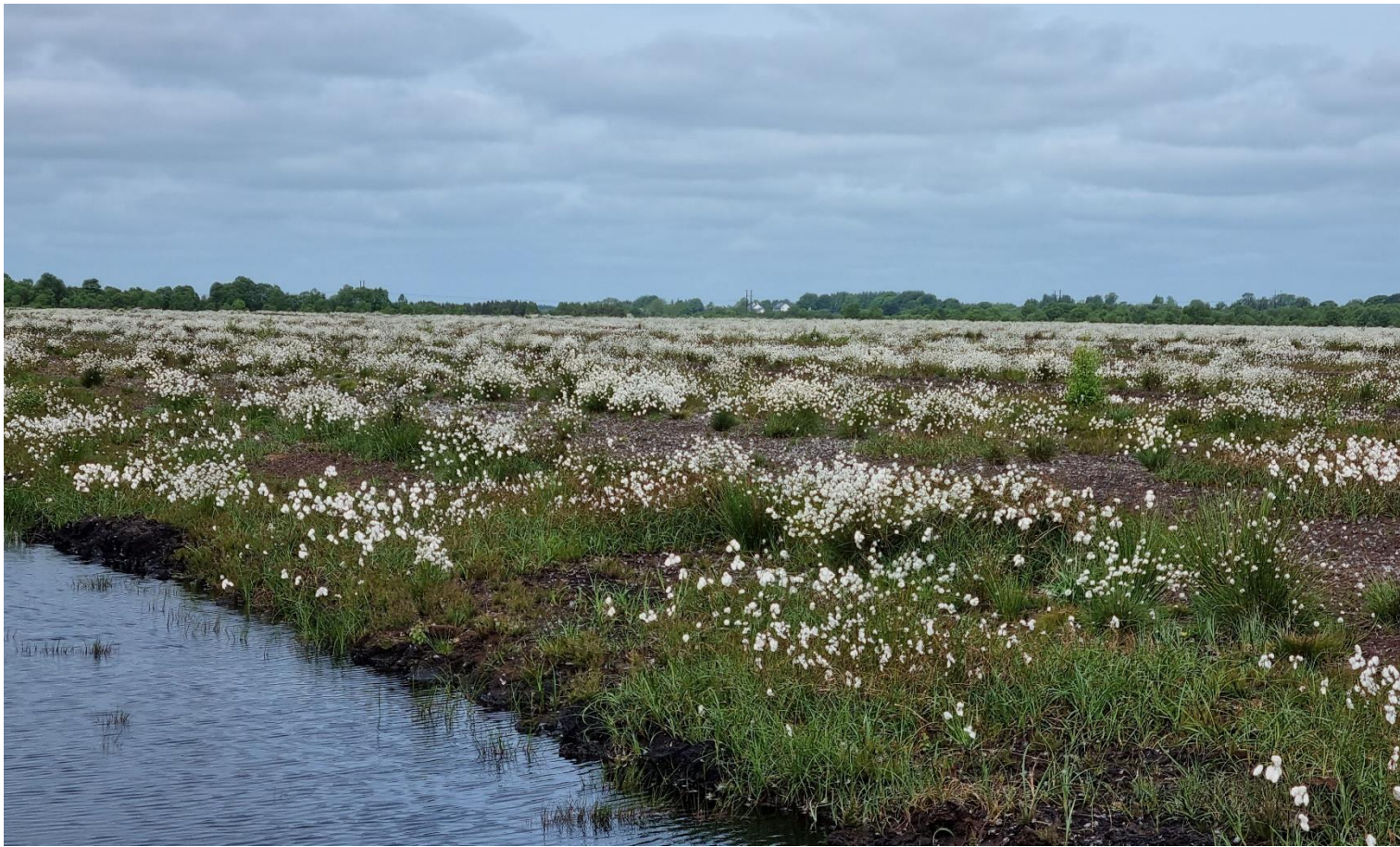
Photo 1: Significant covering of bog cotton noted on the peatland.