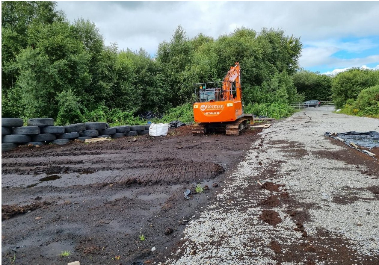
Photo 2: Excavator (with Gorman Earthworks Ireland Ltd logo) at the loading area.