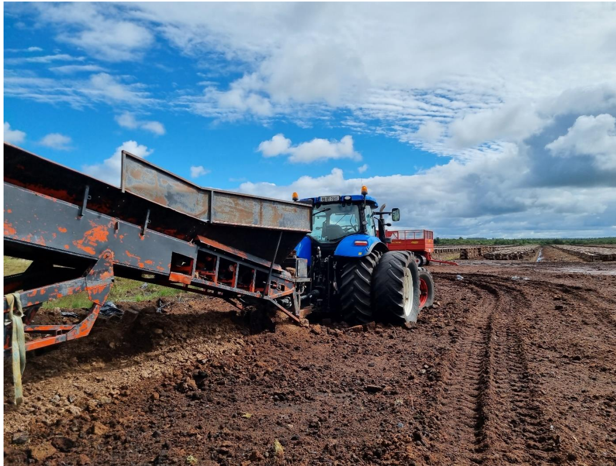
Photo 4: Elevator for loading the sod peat noted at the loading area.