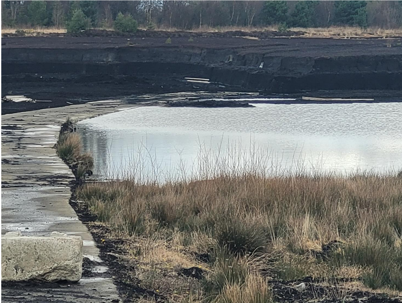
Photo 1: Ongoing significant ponding of water noted within Area G.