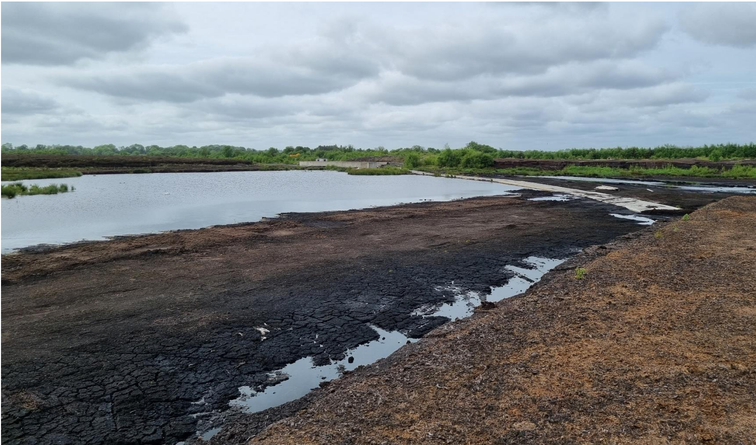
Photo 2: Water levels appeared to have lowered recently within Area G.