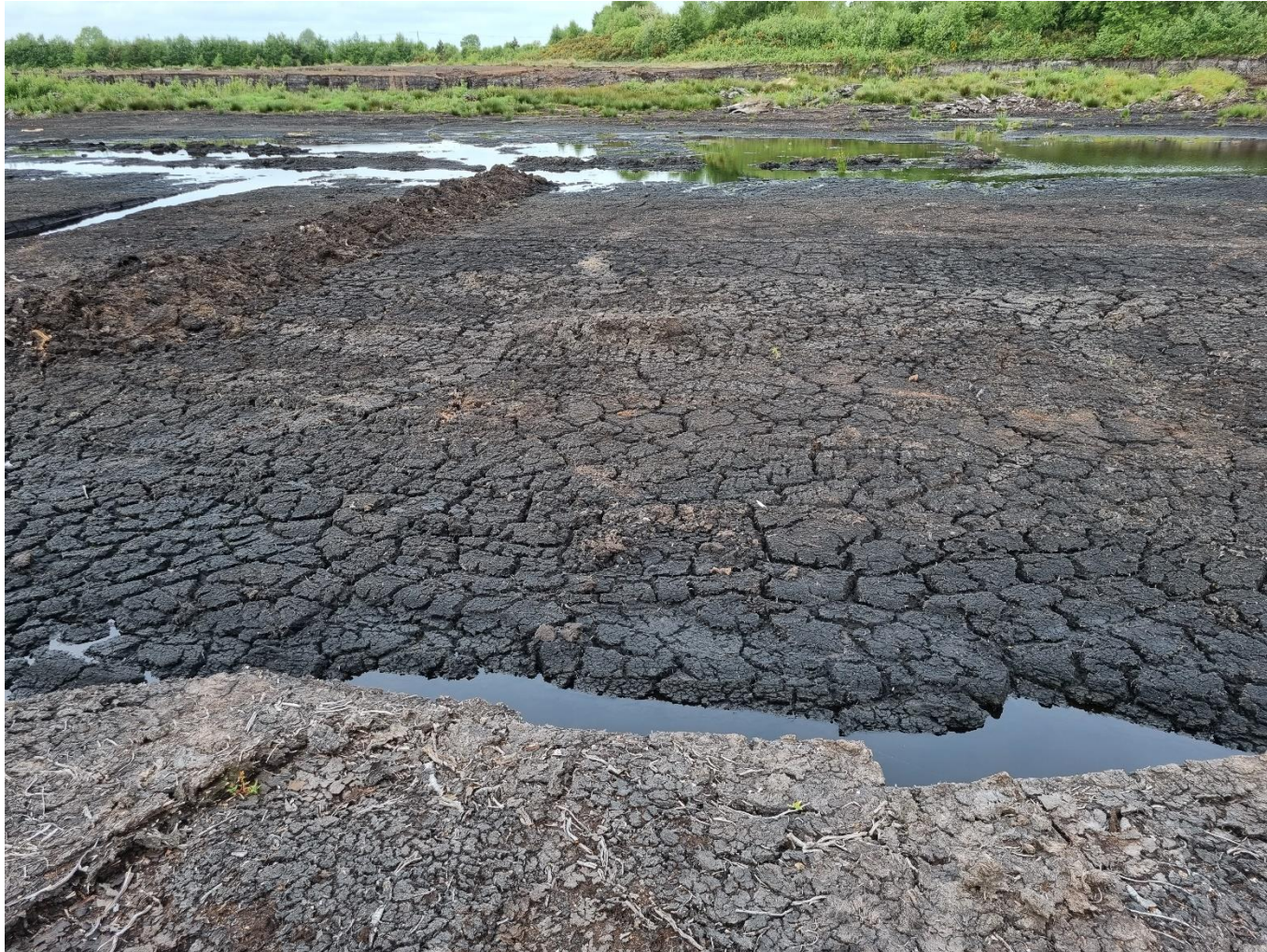
Photo 1: Visible cracking and drying of the peatland noted within Area G.