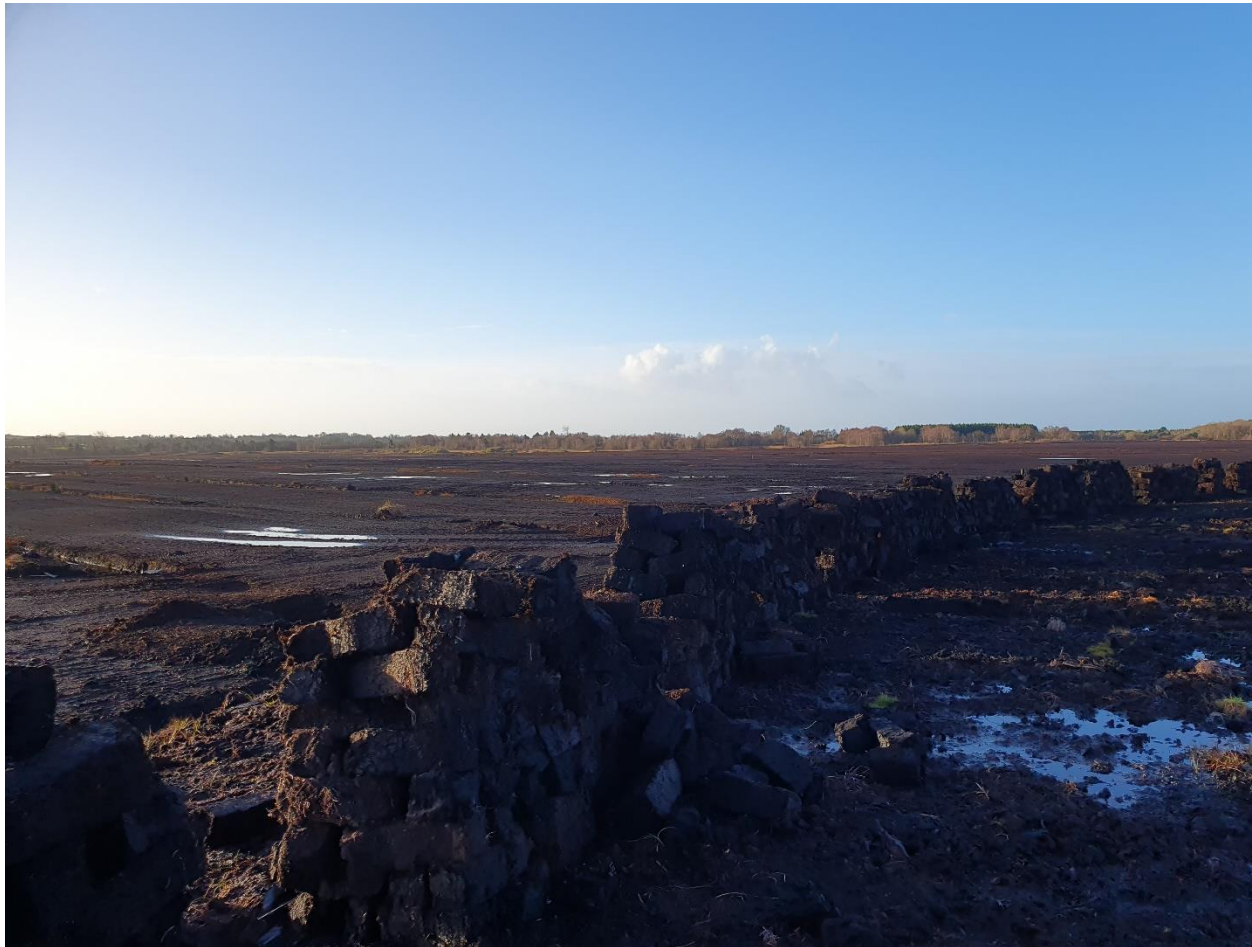
Photo 2: Excavated large sod peat left out on the peatland for drying.