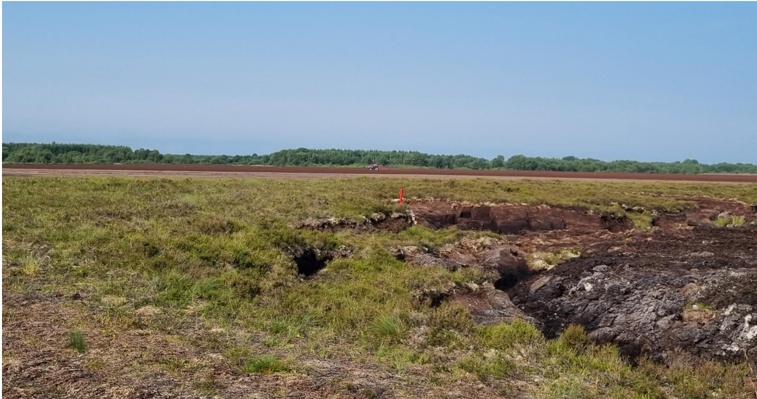
Photo 1: Peat extraction ongoing during the visit - Note milling of peat taking place by tractor with attachment.