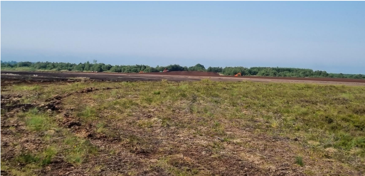
Photo 2: Large stockpile of milled peat noted along with three excavators.