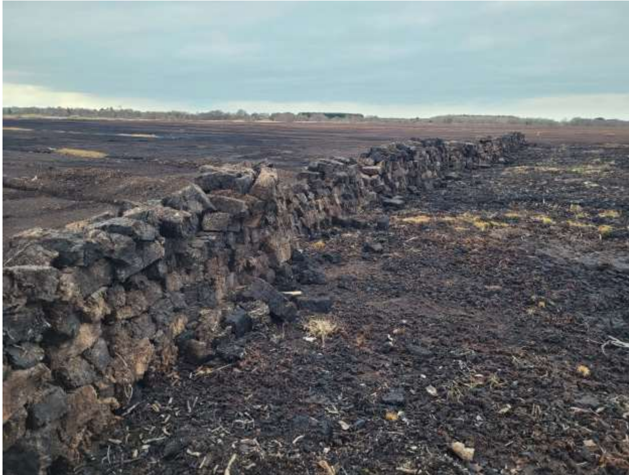
Photo 2: Excavated large sod peat left out on the peatland for drying.