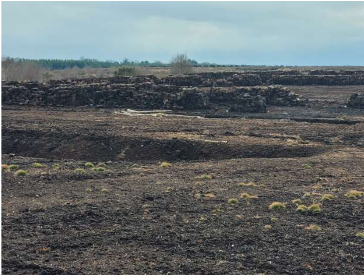
Photo 1: Walled sod peat noted at the northern area of the peatland.