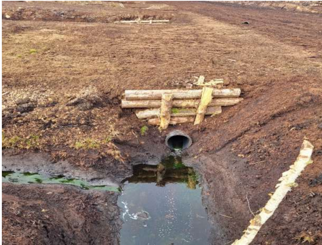
Photo 3: Recently completed drainage and access works noted during the visit.