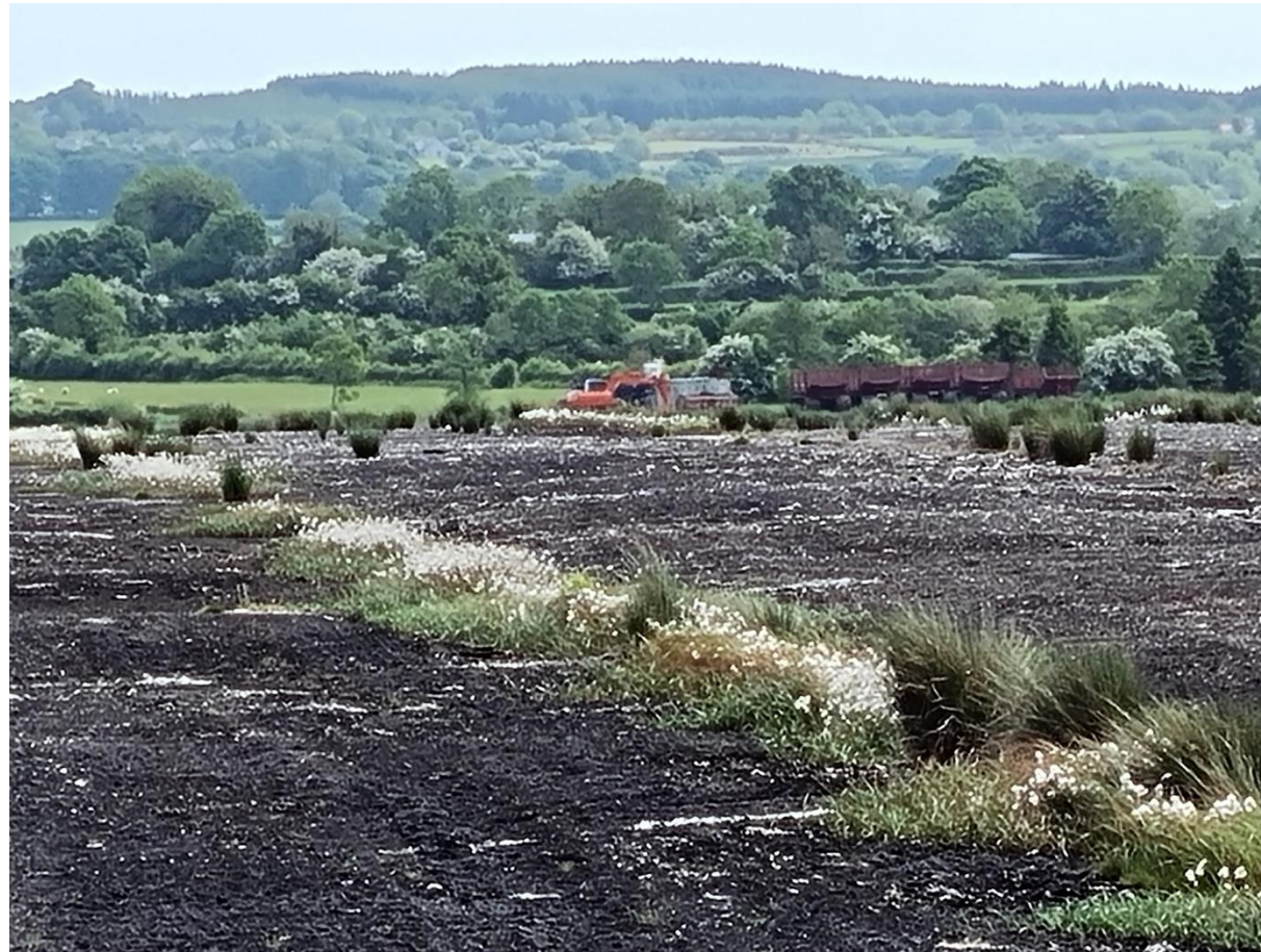
Photo 3: Machinery for peat extraction/harvesting noted to be parked adjacent to the loading area.