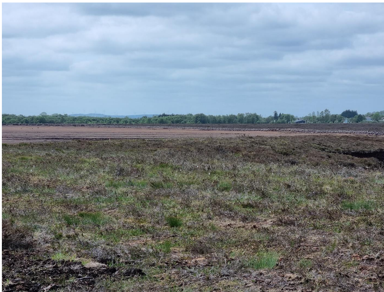
Photo 1: Row(s) of large sod peat stacked for drying along the northern end of the milled peat section of the peatland.