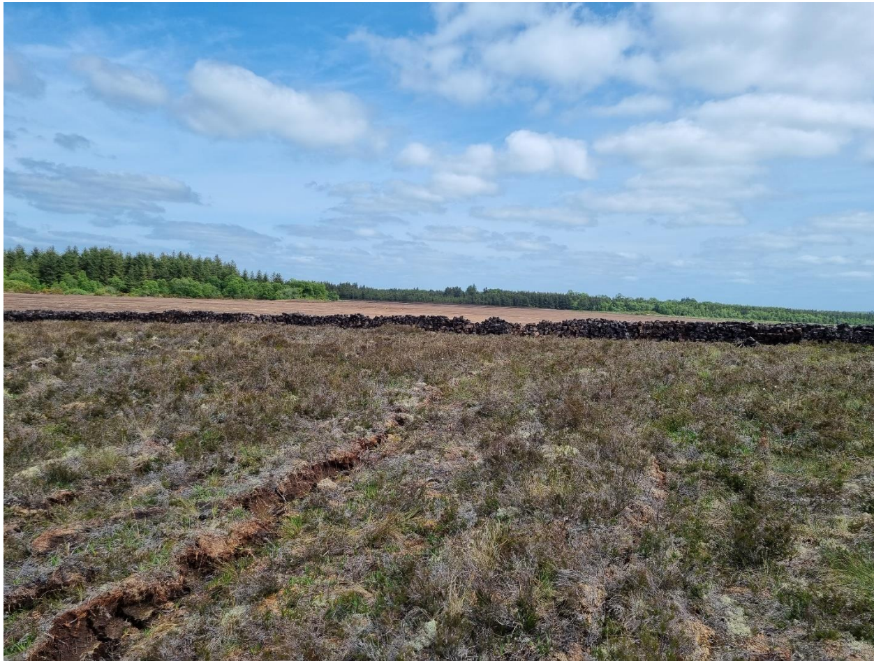
Photo 2: Row(s) of large sod peat stacked for drying along the northern end of the milled peat section of the peatland.