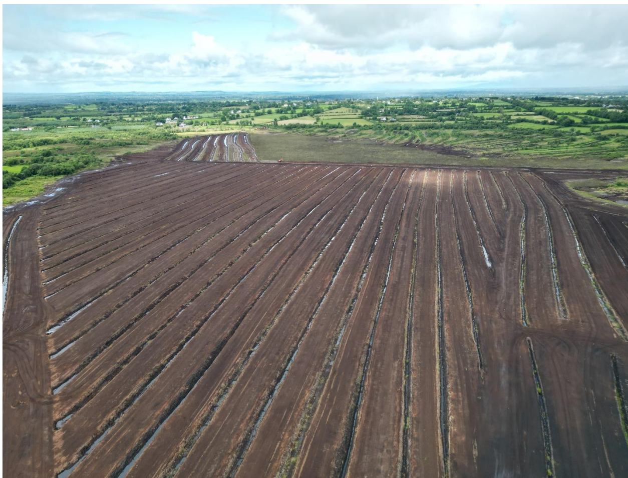
Photo 5: Significant quantities of water noted in the drainage network on the peatland.