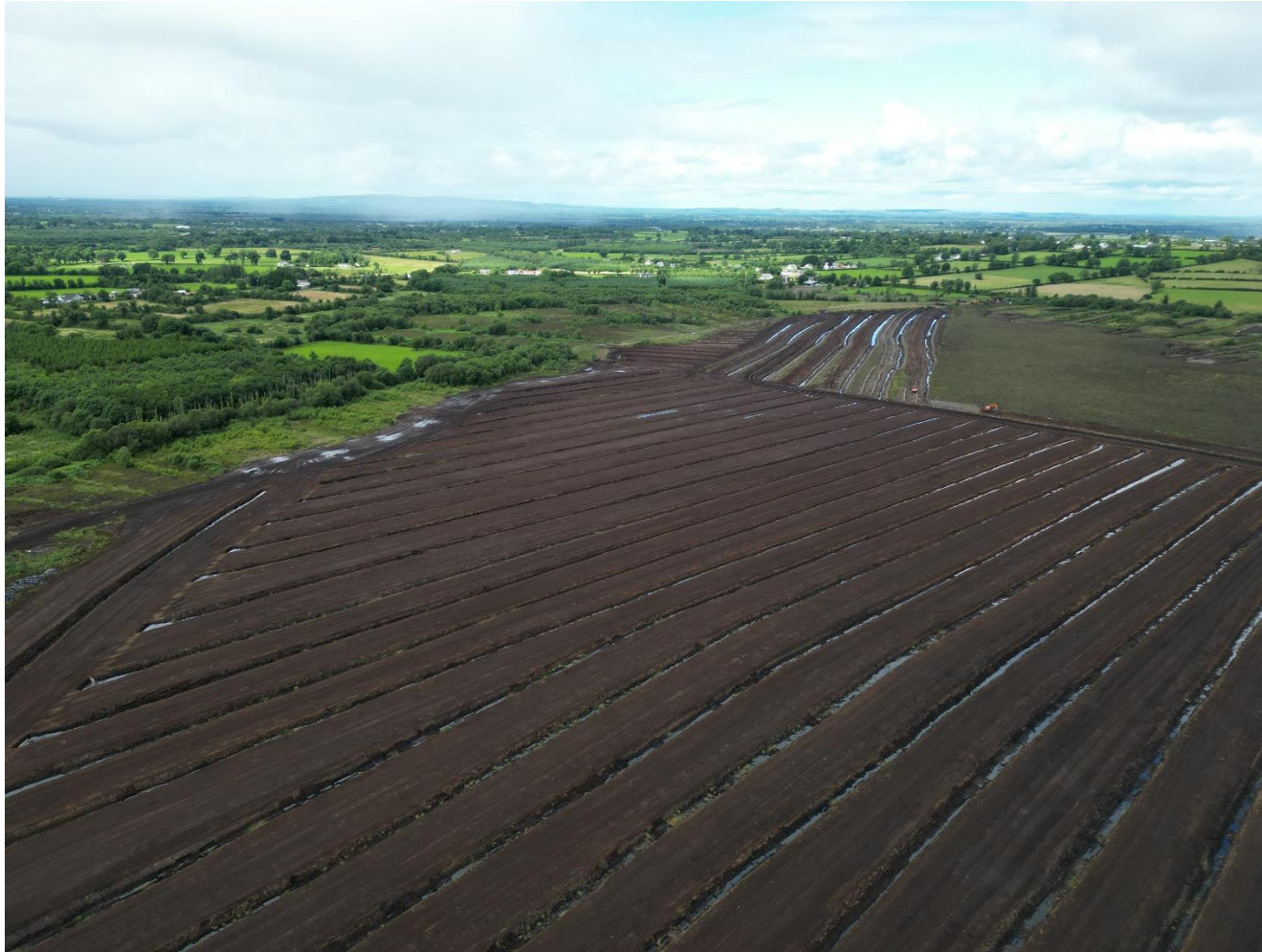
Photo 2: Two excavators noted in the North/North Western section of peatland where large sod peat had recently been removed.