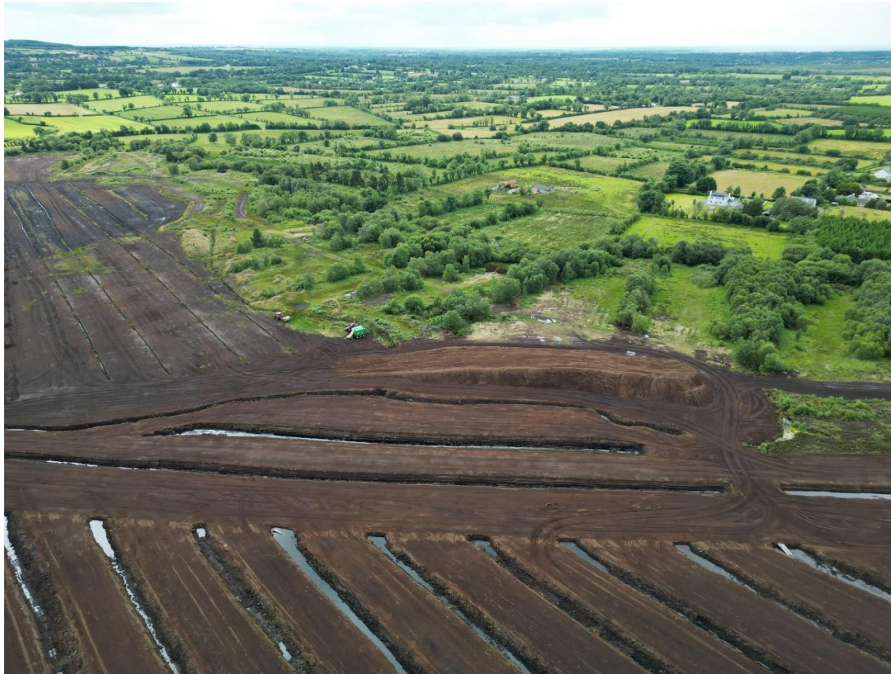
Photo 1: Large stockpile of milled peat in the western/northwestern area of the peatland. Peat harvesting machinery/equipment also noted adjacent to the stockpile.