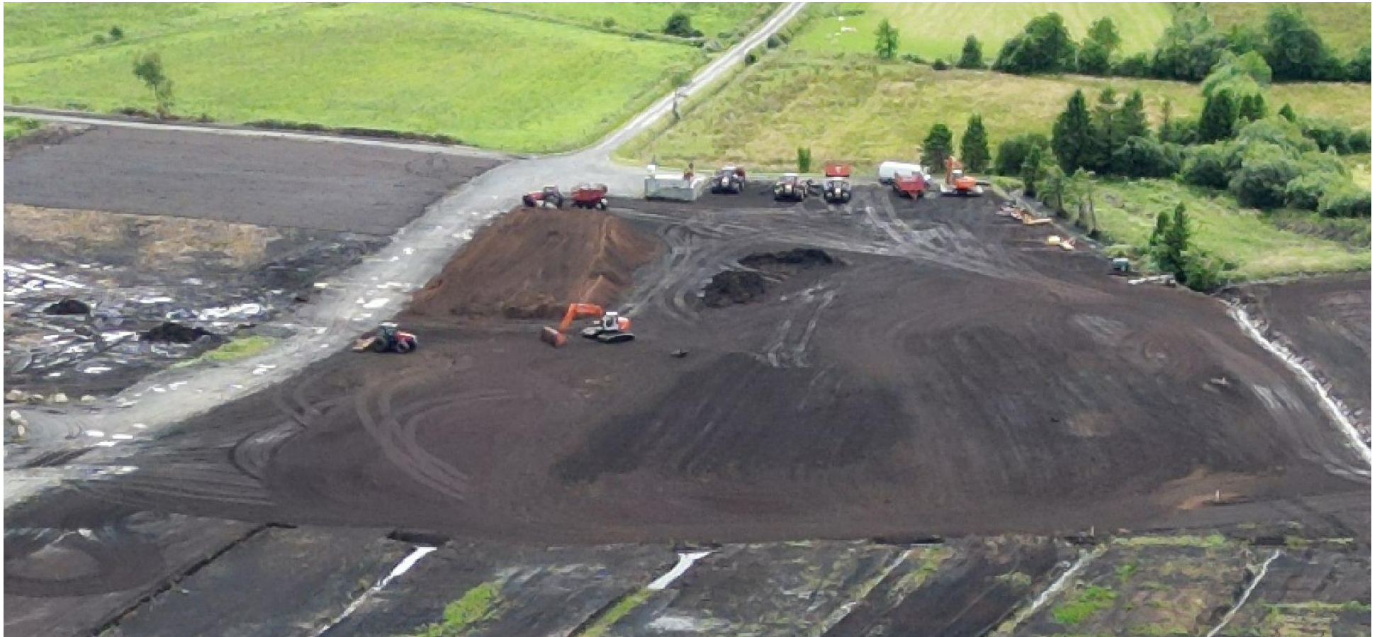
Photo 4: Stockpile of milled peat noted at loading area at the Southern end of the peatland along with excavators and peat harvesting machinery/equipment.