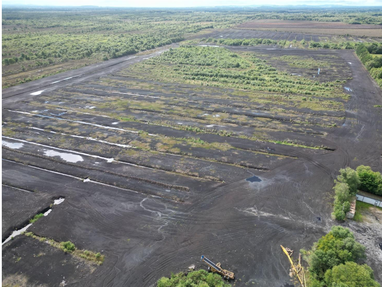
Photo 1: Peat extraction had not taken place recently on some rows on the peatland.