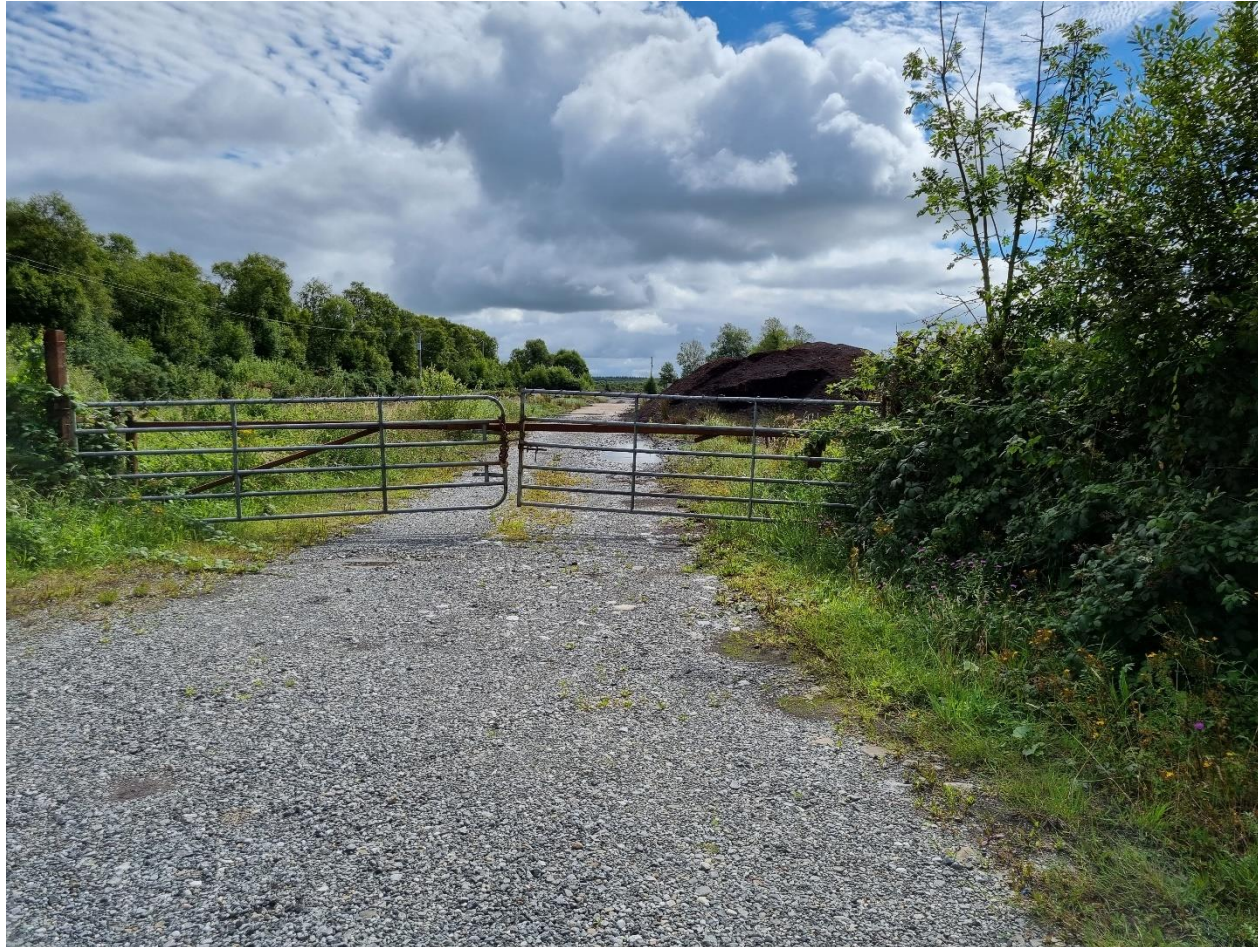
Photo 3: Stockpile of milled peat noted adjacent to the entrance to the peatland.