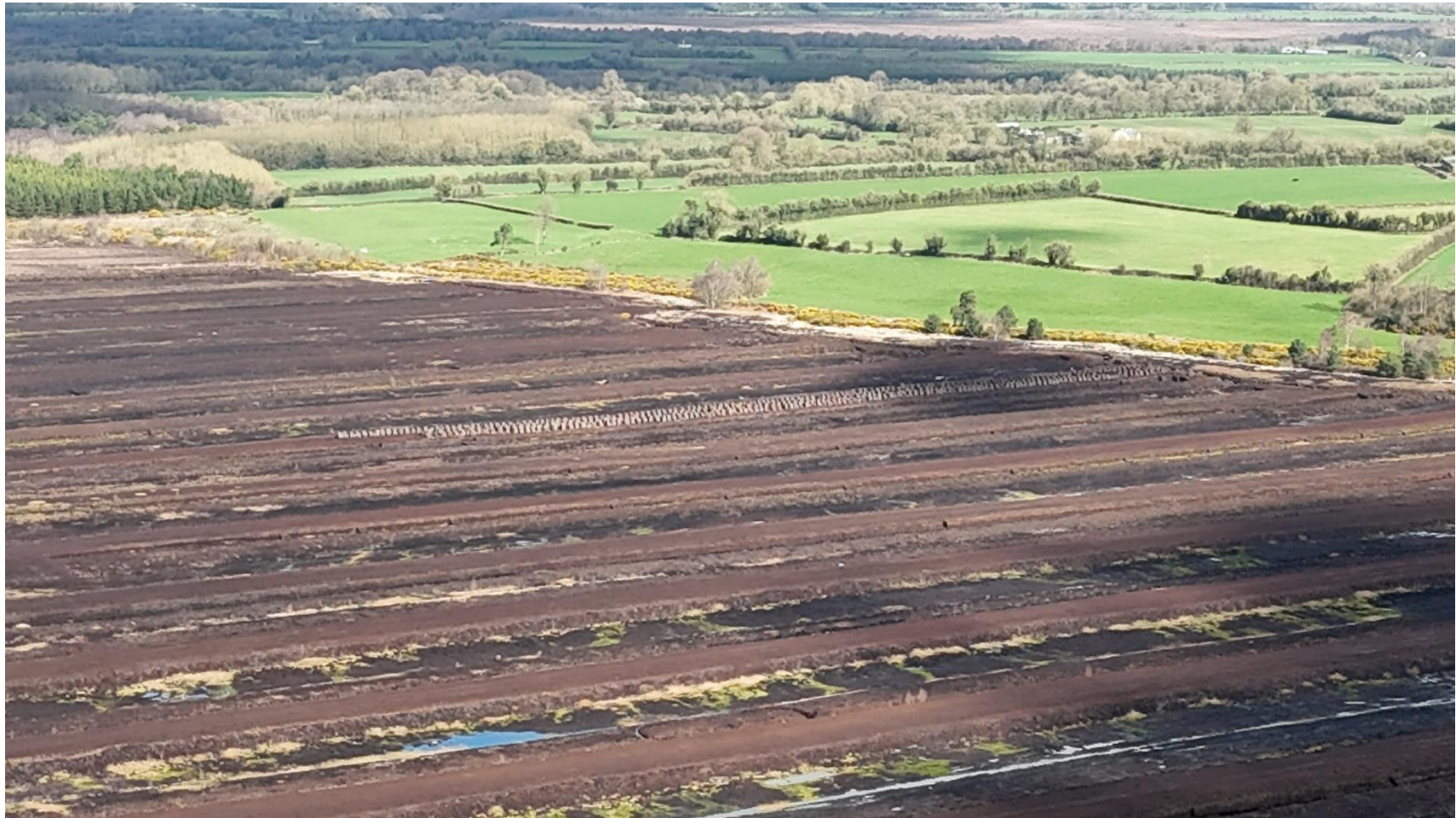
Photo 2: Photo showing remaining large sod peat left on the peatland.