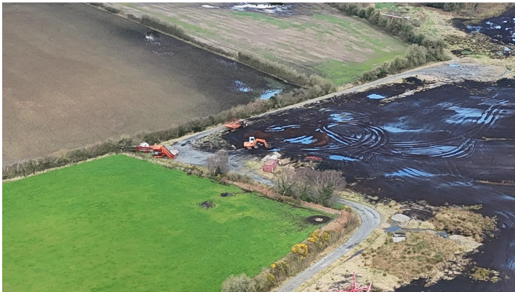
Photo 3: Machinery noted to be parked on the westerns side of the peatland.