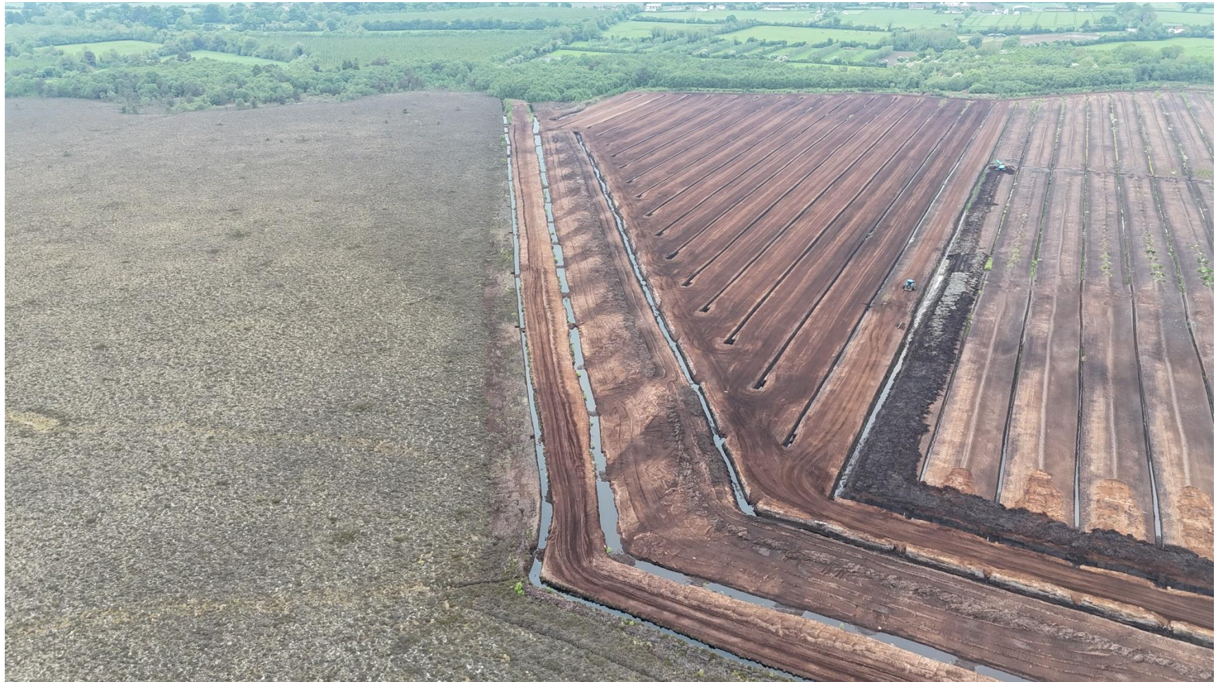
Photo 1: Drainage works were noted to be taking place on the peatland, note untouched peatland on the left of photo.