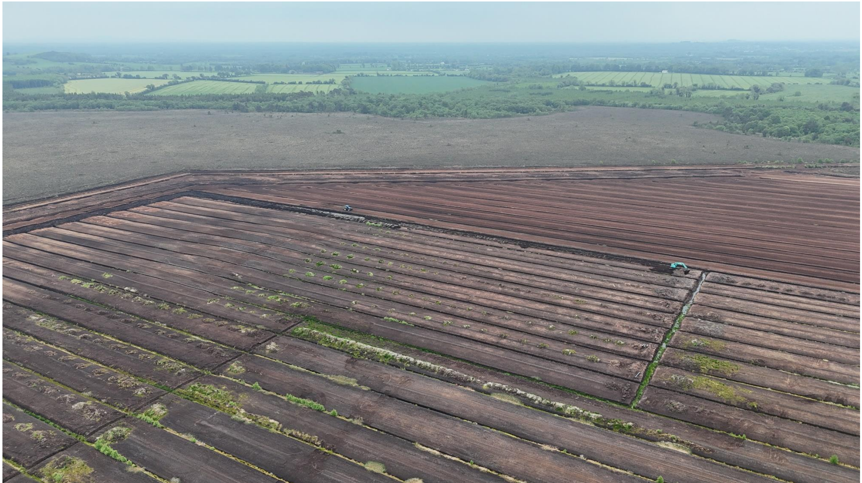
Photo 2: Drainage works were noted to be taking place on the peatland.