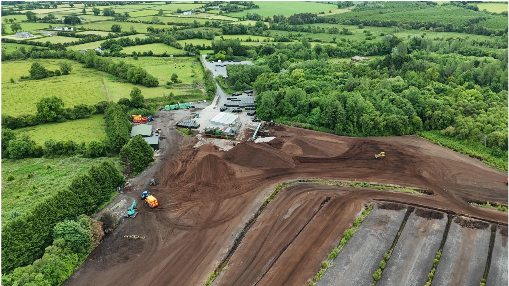
Photo 1: Overview of factory area with stockpiles of milled peat noted along with peat extraction machinery.