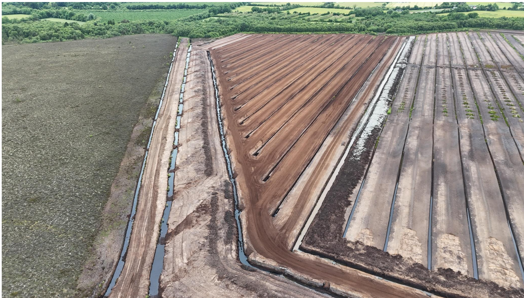
Photo 3: Overview of South Western part of the peatland prior to the collection of the milled peat. Also, note the untouched virgin bog on left of photo and drainage network.