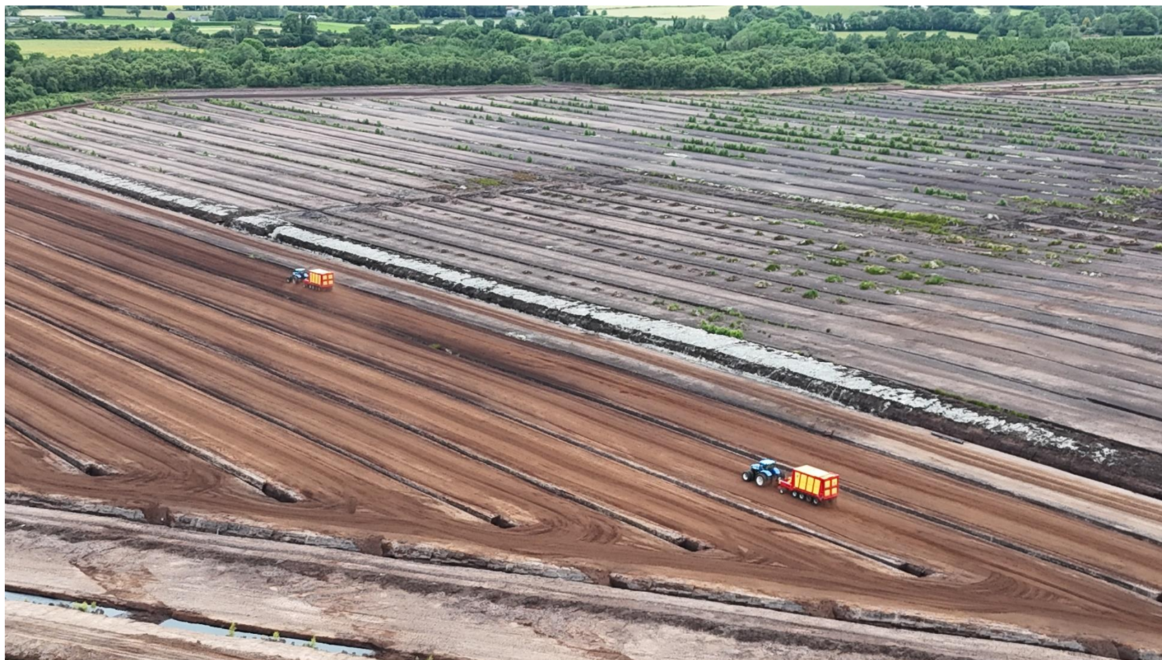
Photo 5: Two Tractors and trailers ('Bog Hog's') collecting milled peat at the South Western part of the peatland during the visit.