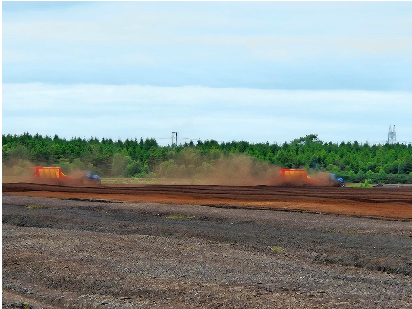
Photo 6: Significant dust emissions noted from the transport of the milled peat back to the bagging/processing plant area.