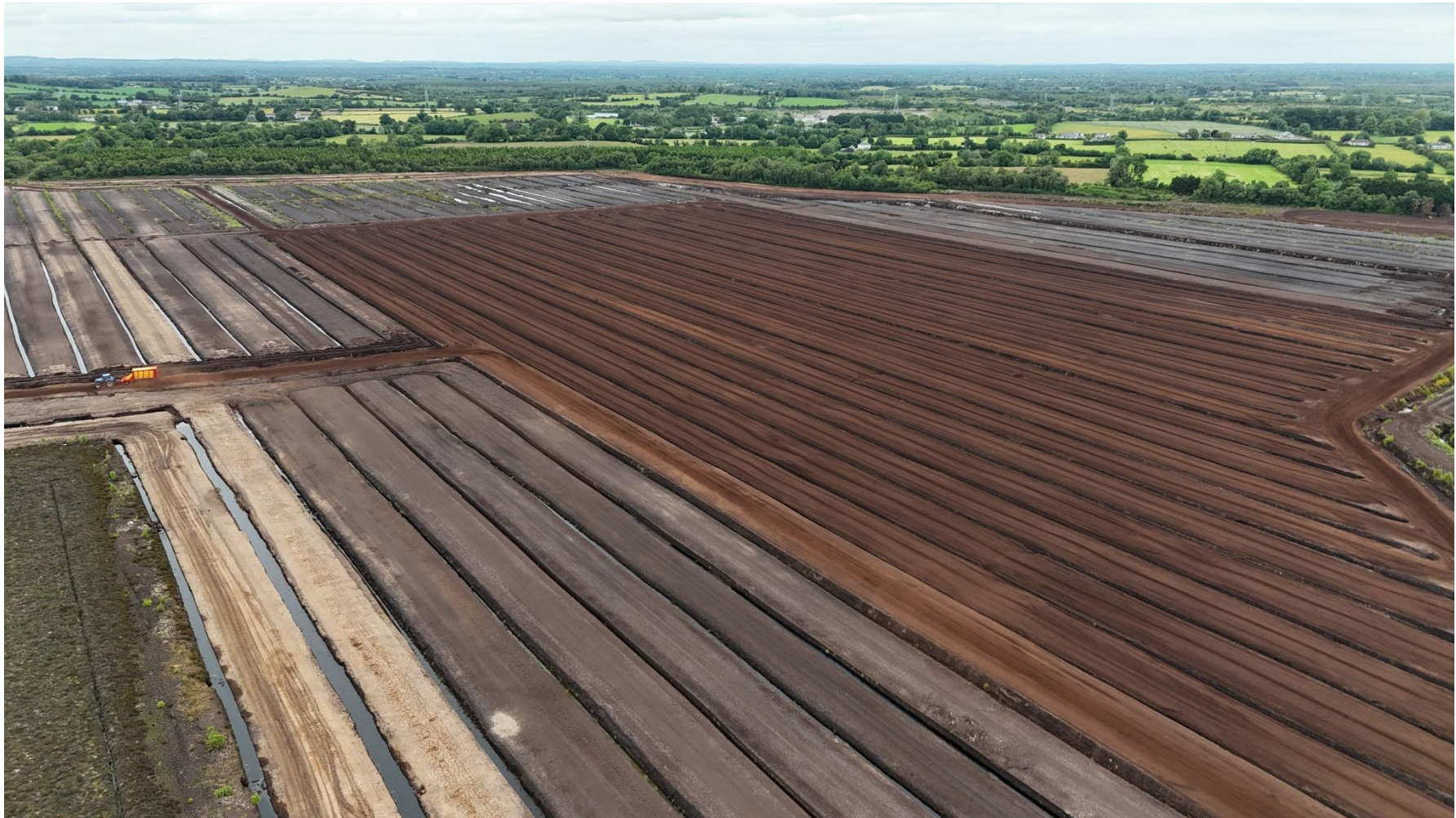
Photo 2: Photo of central part of the peatland where peat extraction had taken place recently (note dark brown colour). Also, note tractor and trailer (‘Bog Hog’ ) going to the South western part of the peatland to collect milled peat.