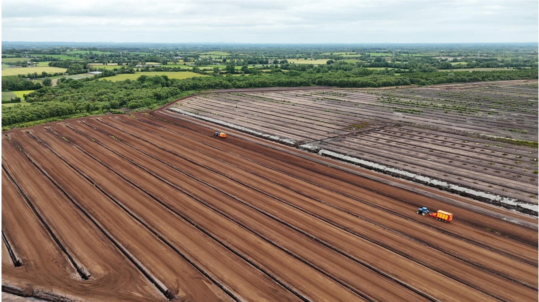
Photo 4: Two Tractors and trailers ('Bog Hog's') collecting milled peat at the South Western part of the peatland during the visit.