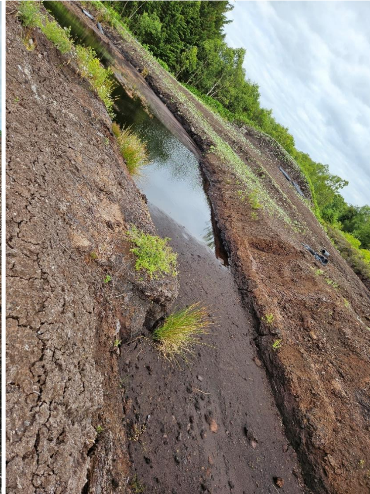
Photos 7 & 8: Drainage network with significant sediment build up noted at the South Eastern corner of the peatland.