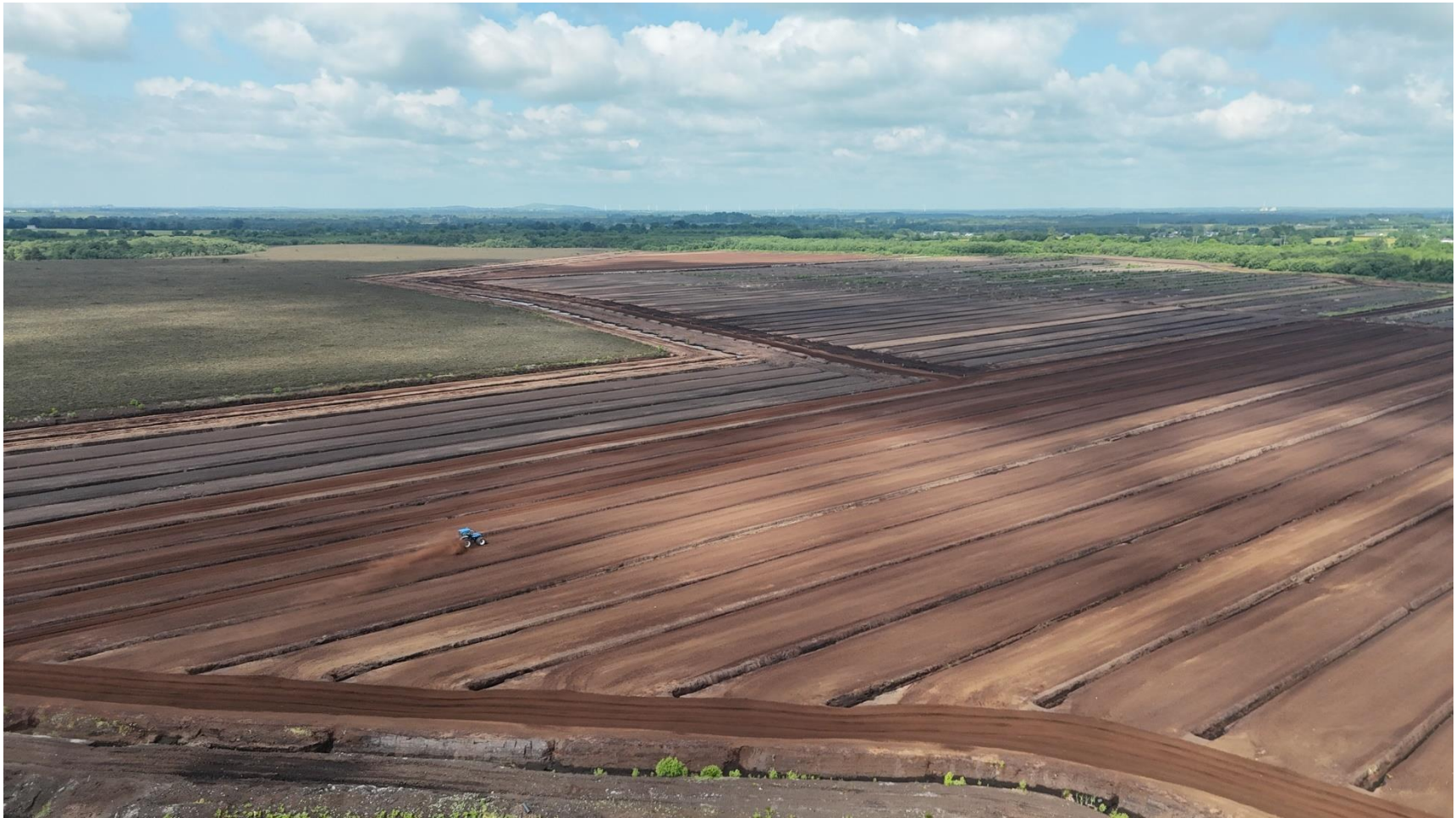
Photo 4: Milled peat extraction was noted to be taking place during the visit.