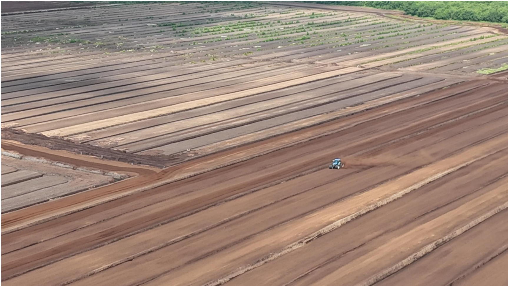
Photo 2: Milled peat extraction was noted to be taking place during the visit.