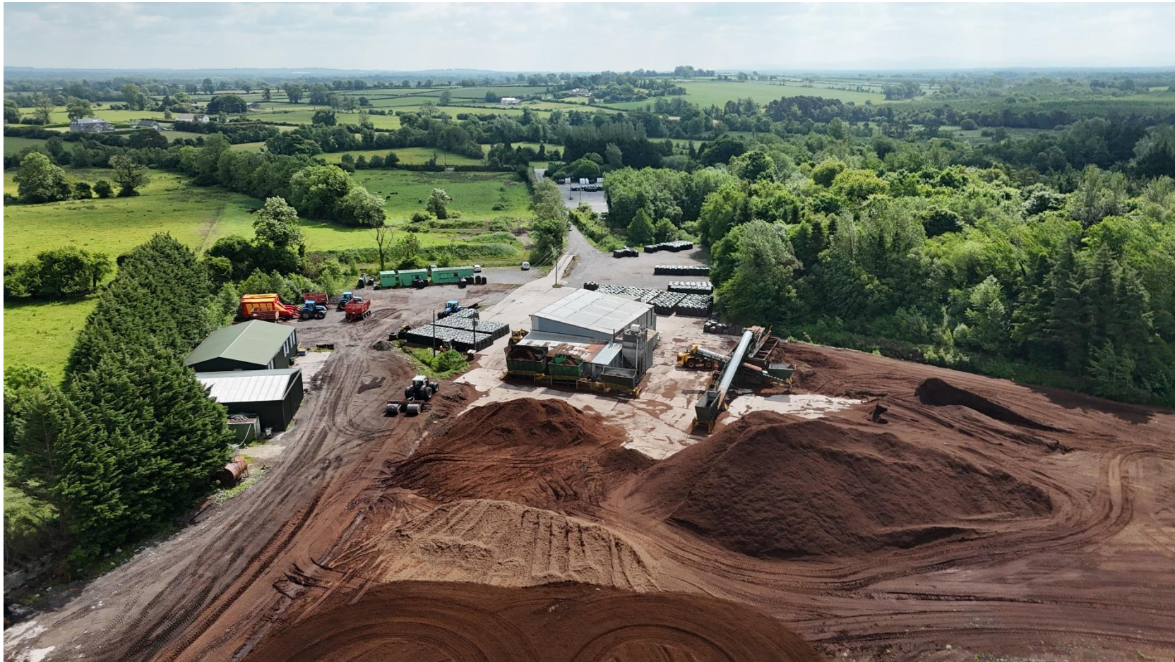
Photo 7– Photo of milled peat stockpiles adjacent to the bagging plant.