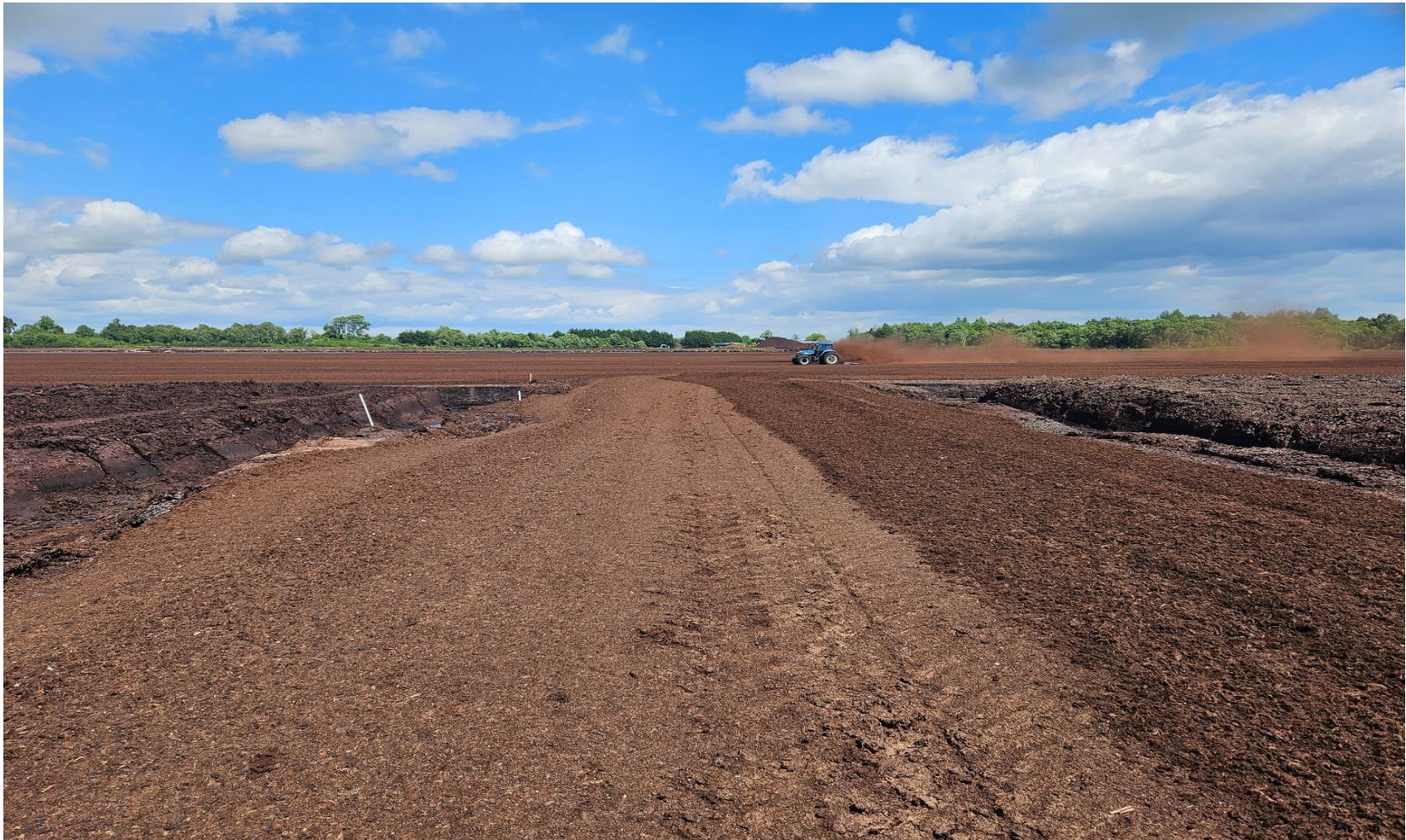
Photo 6– Milled peat extraction activities were ongoing during the visit.