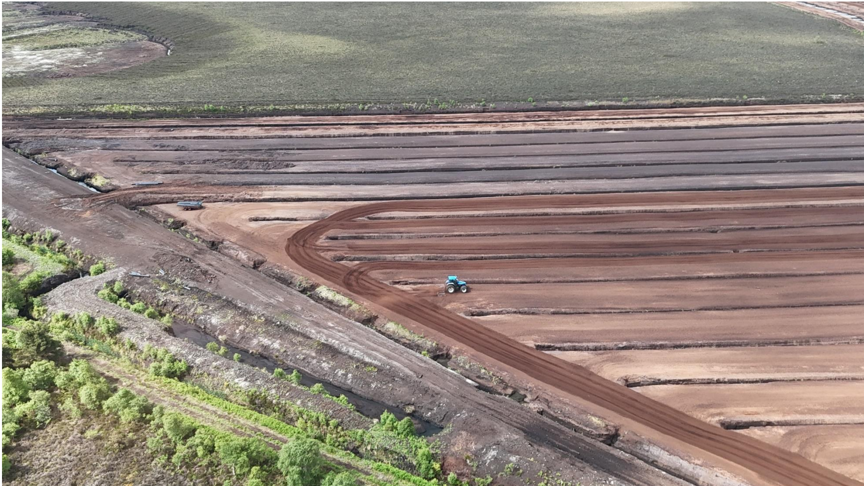
Photo 3: Milled peat extraction was noted to be taking place during the visit.