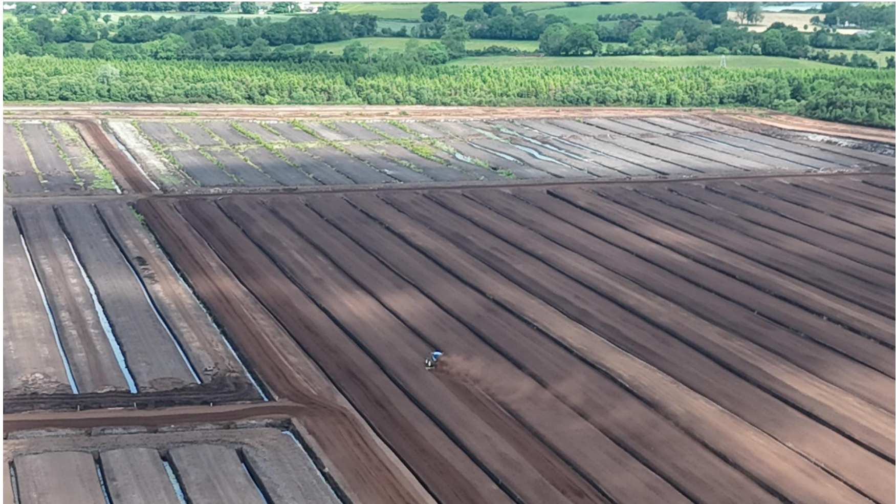
Photo 1: Milled peat extraction was noted to be taking place during the visit, note significant dust emissions arising.