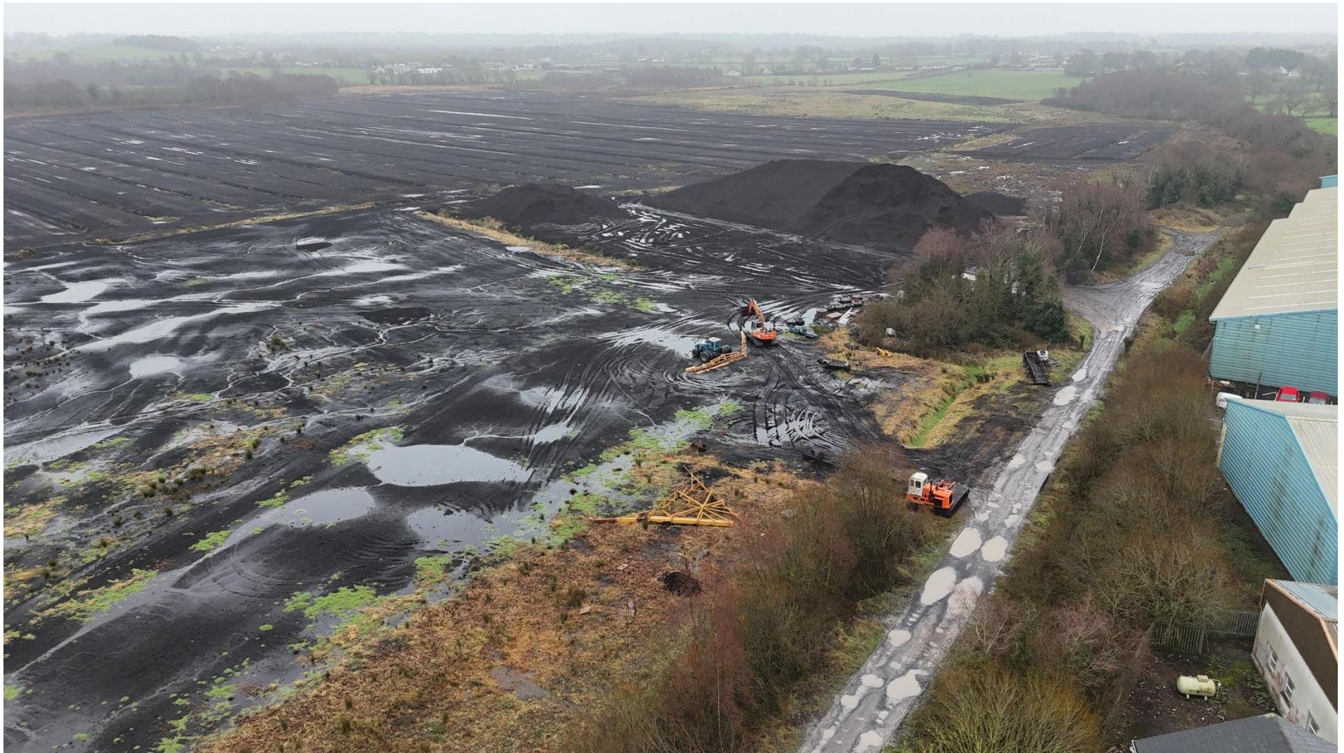
Photo 1: Peat extraction machinery noted to be parked on the peatland.