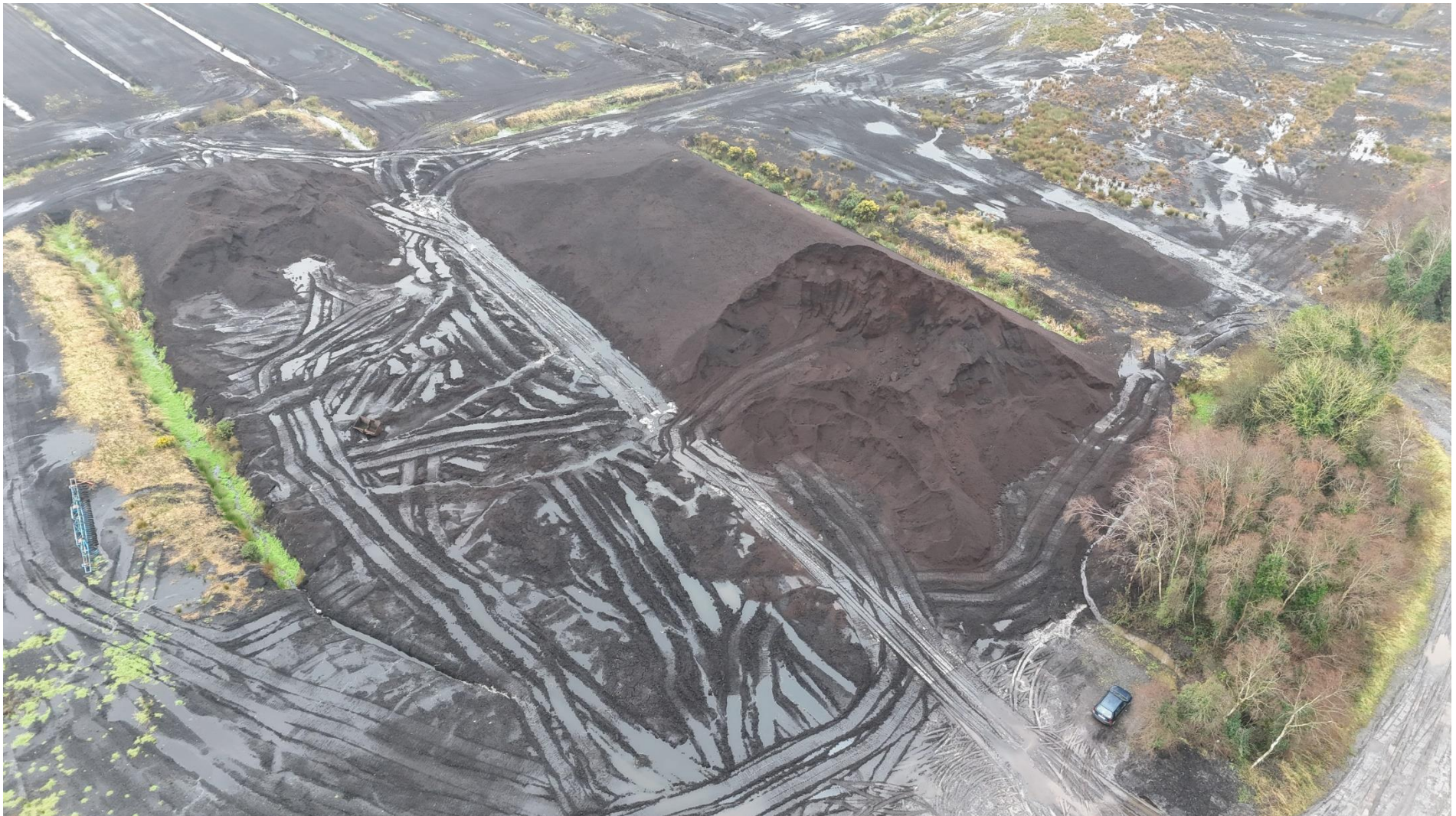
Photo 2: Stockpiles of milled peat at the peatland (Note significant quantities of milled peat had been removed since the EPAs visit in July 2023).