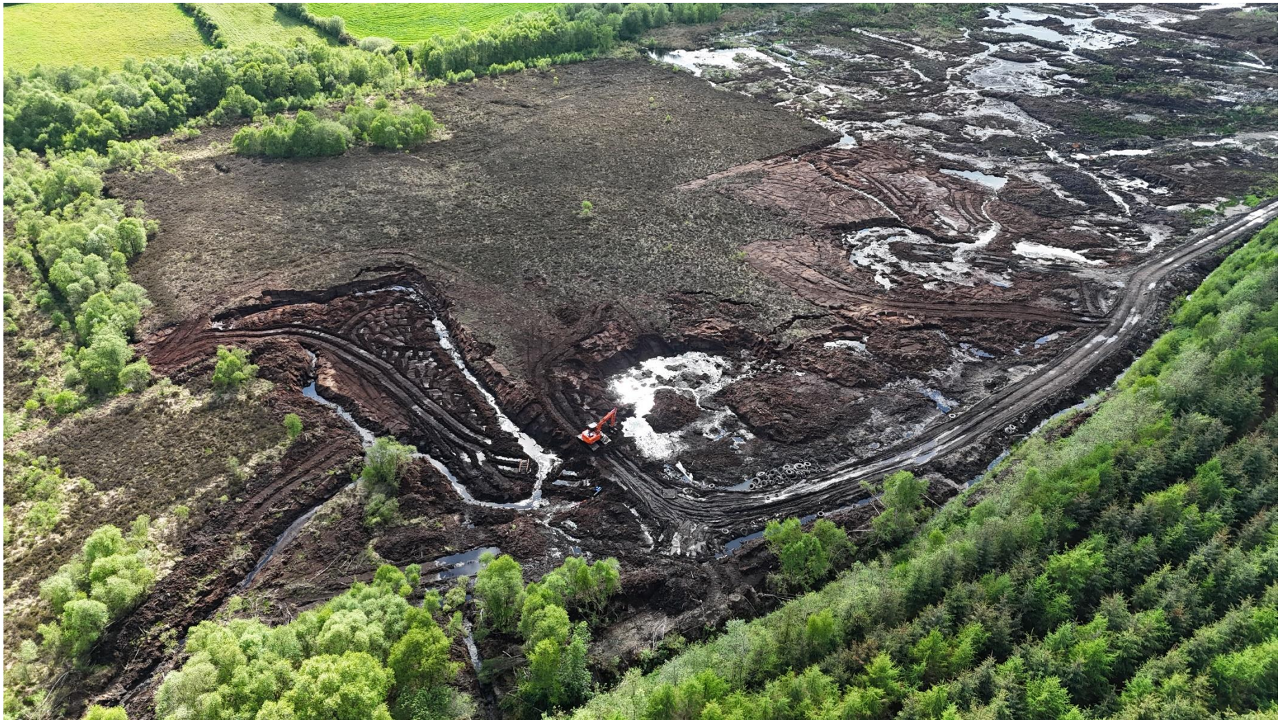
Photo 1: Peat extraction was noted to be taking place in the southeastern end of the peatland.