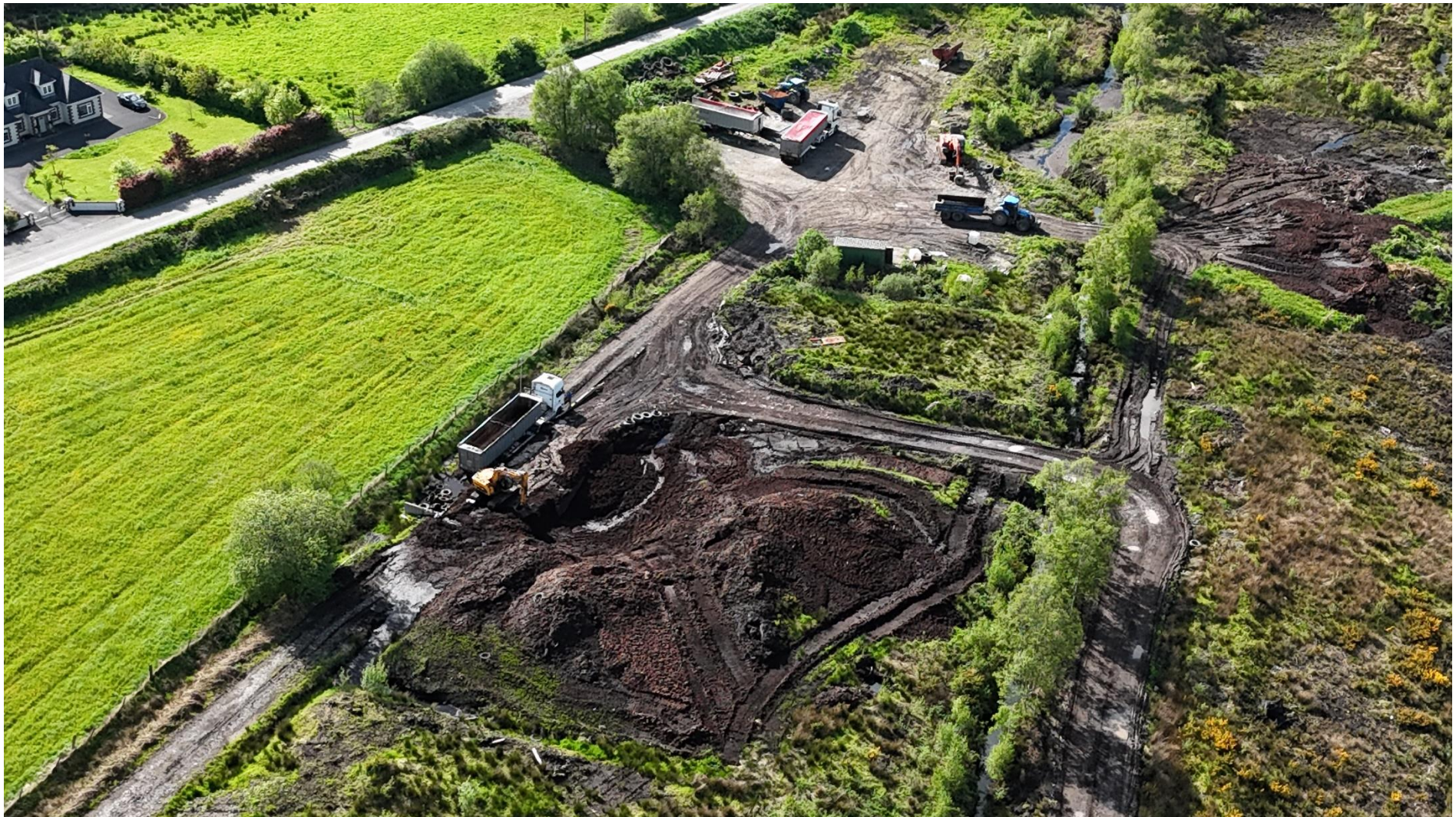
Photo 2: Photo showing peat loading operations in the Northwestern end of the peatland.