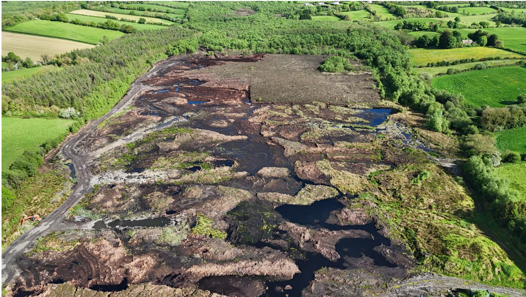
Photo 4: Photo showing the extent of peat extraction operations which have taken place on the peatland.