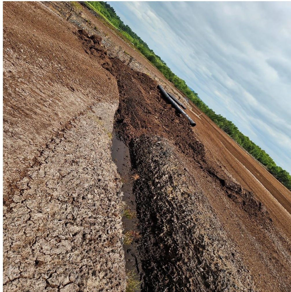
Photo 5: Drainage works noted at the Northern part of the peatland.