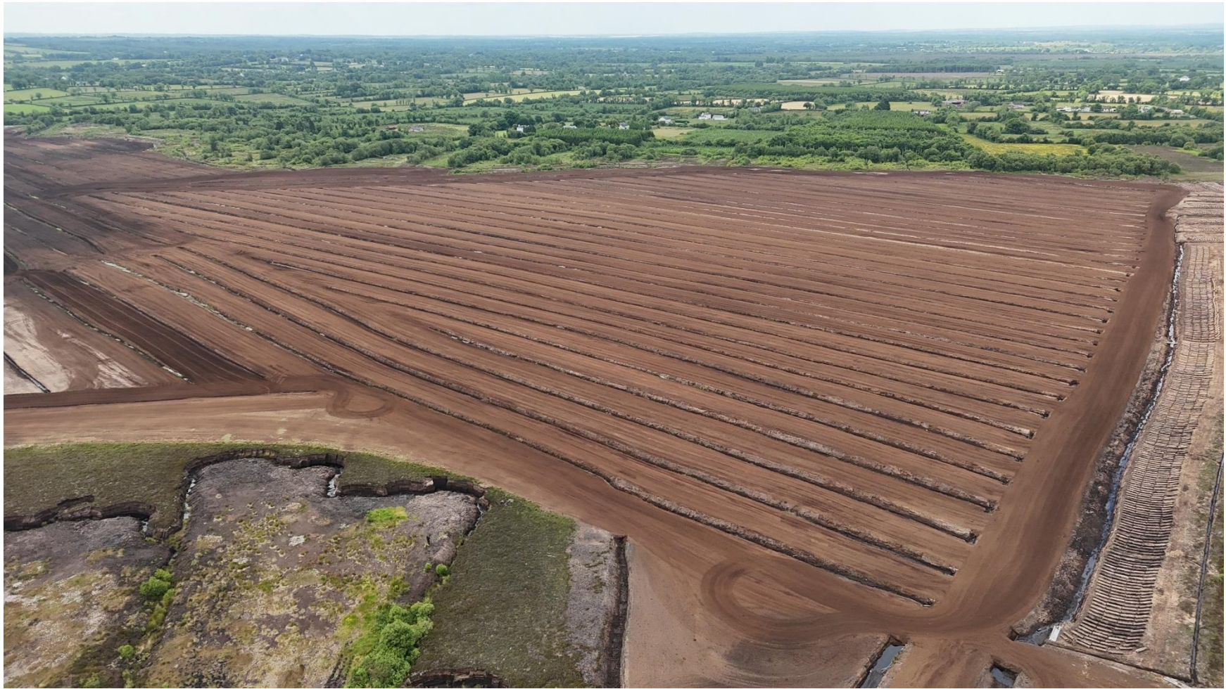
Photo 3: Photo of the western side of the peatland with large sod peat left to dry also noted (on right of photo).