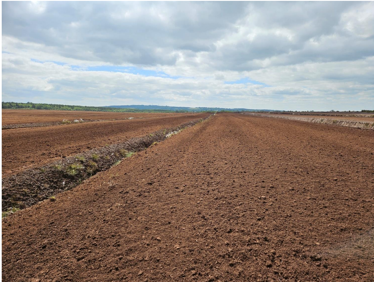
Photo 4: Recently ‘milled’ peat noted on the peatland awaiting further processing prior to collection and removal off the peatland.