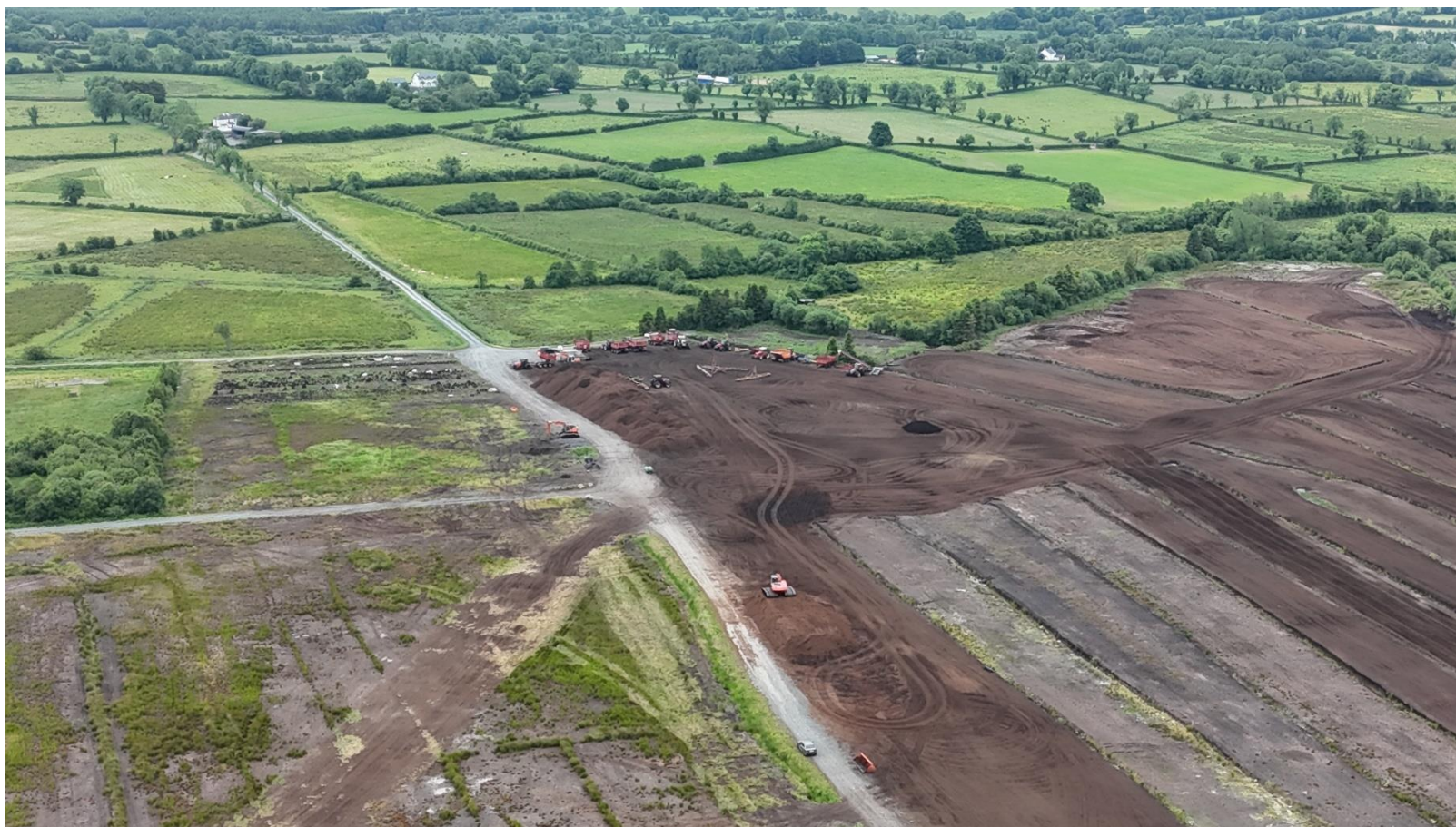
Photo 6: Stockpiles of milled peat and peat extraction and harvesting machinery noted at the loading area.