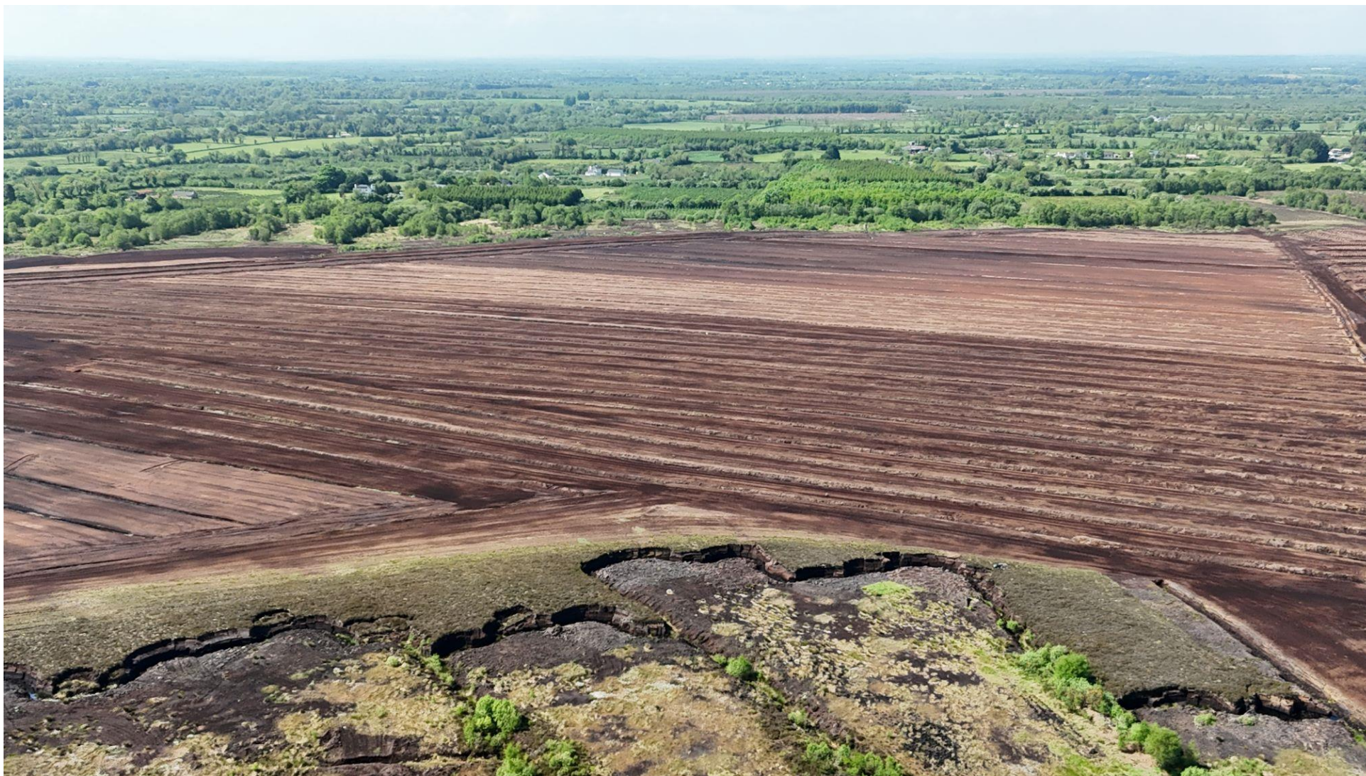
Photo 2: Area along the western/north western side of the peatland where drains had been cleared.