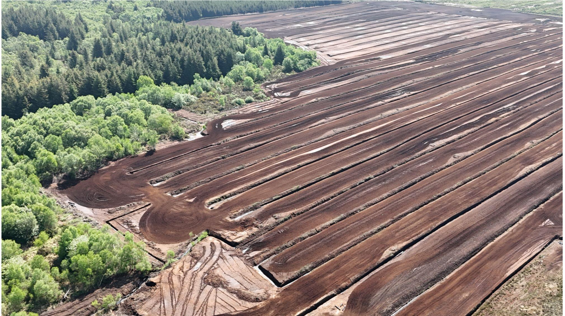
Photo 1: Area to the north east of the peatland where there was evidence of recent peat milling activity.