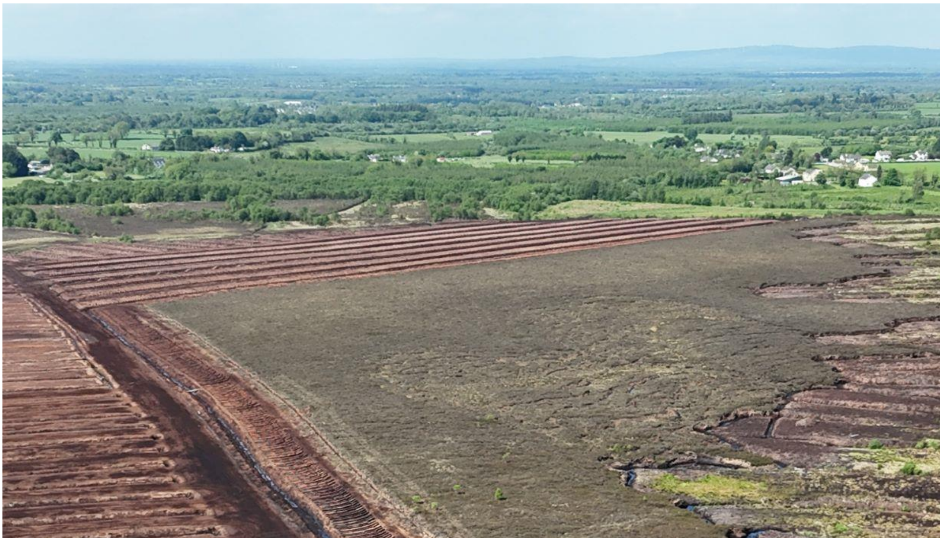
Photo 3: Area at the north western part of the site where large sod had recently been excavated.