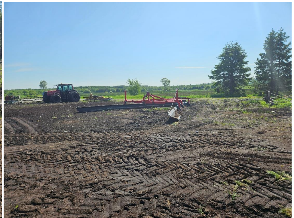
Photos 9 & 10: Milled peat extraction machinery and equipment noted at the loading area.