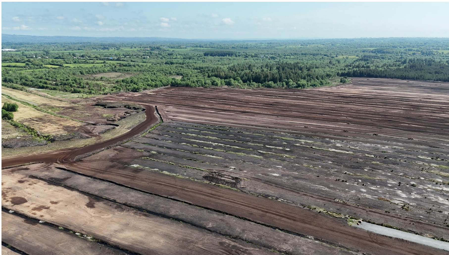
Photo 2: General overview of the North/North eastern section of the peatland.