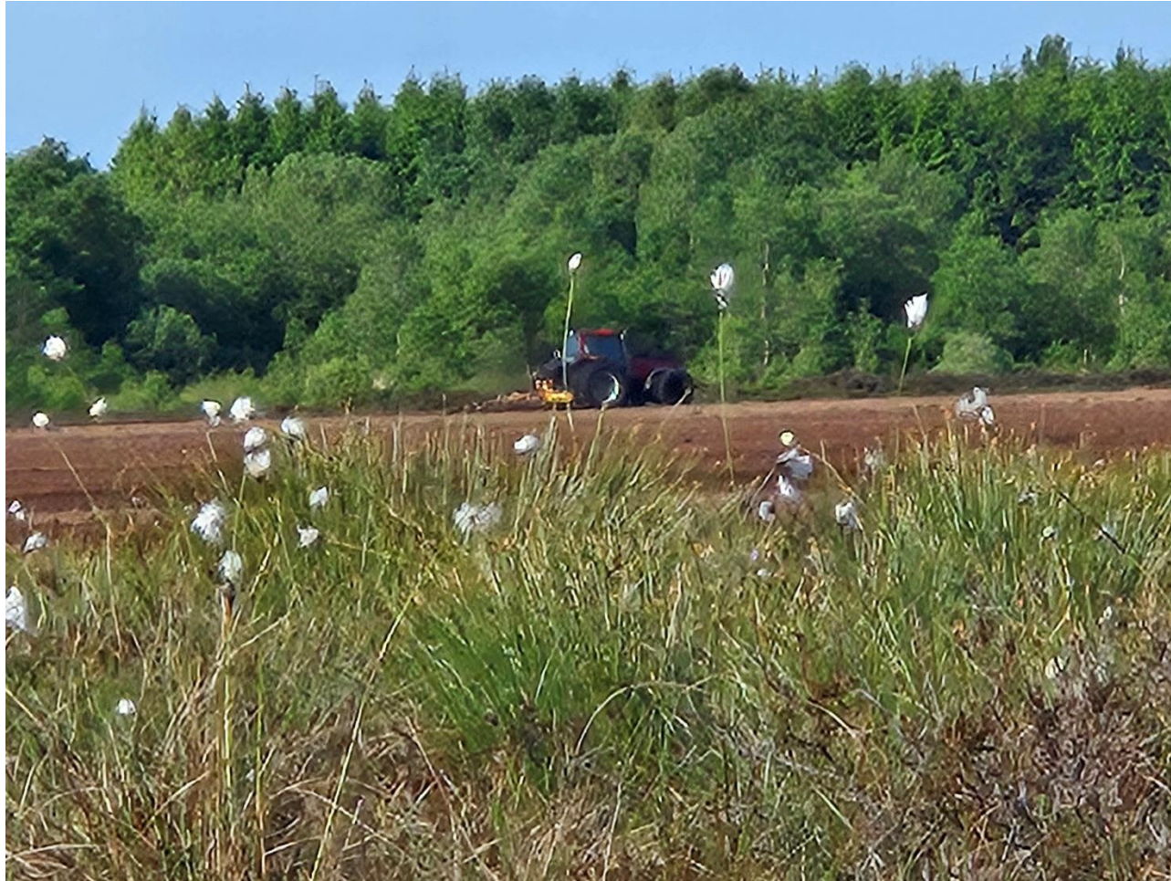
Photo 6: Milled peat harrowing was noted to be taking place during the visit.