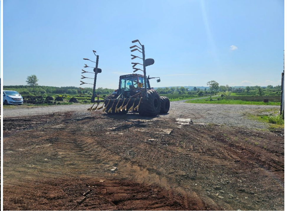
Photos 7 & 8: Milled peat extraction machinery and equipment noted at the loading area.