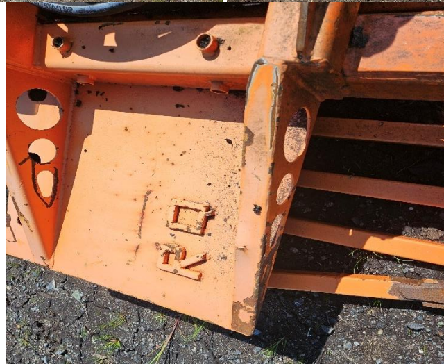
Photos 11, 12 & 13: Large sod peat extraction attachments were noted at the loading area.