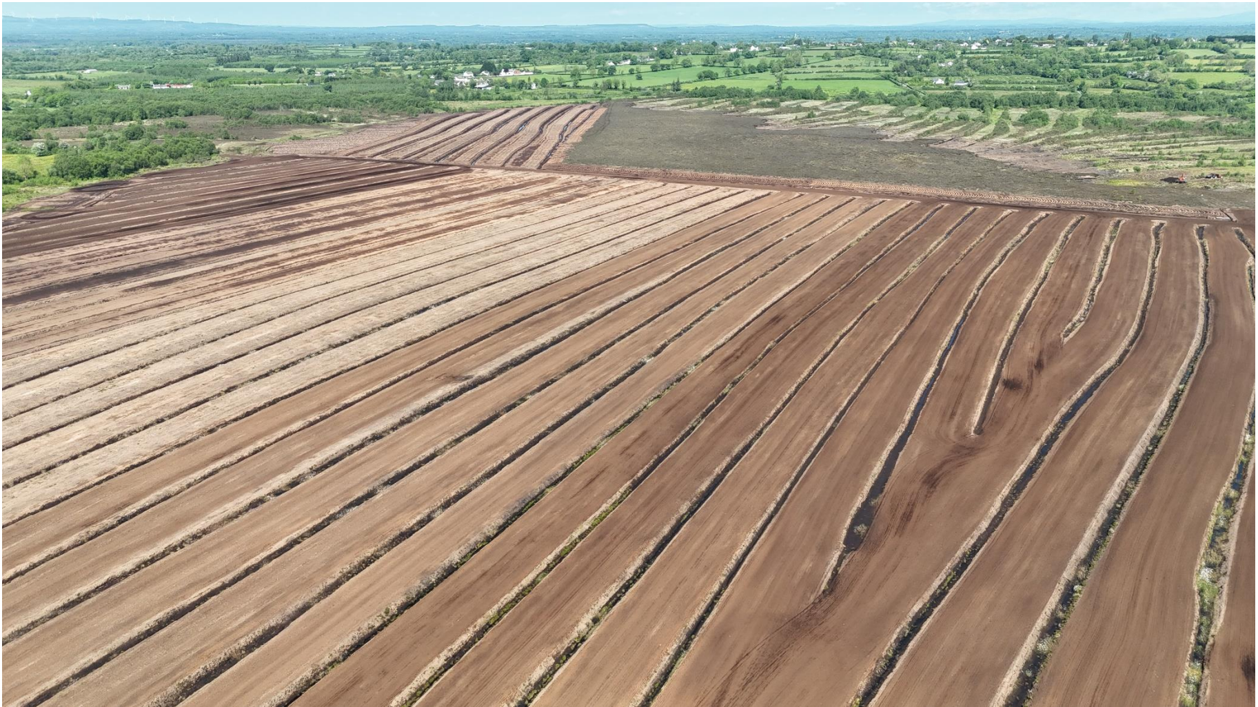
Photo 1: General overview of the North western section of the peatland.