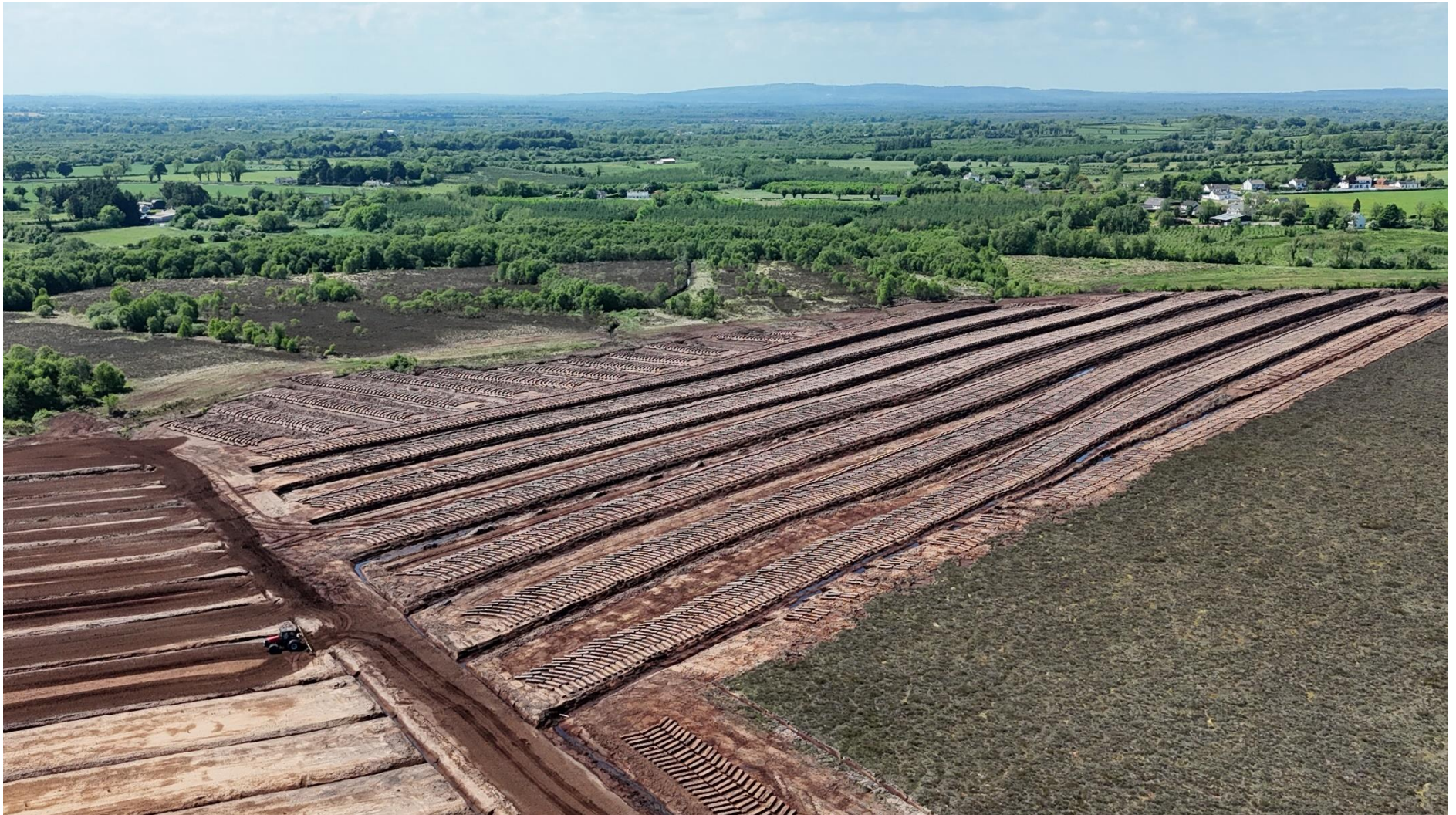
Photo 5: View of section of the peatland where large sod peat had recently been excavated, note milled peat extraction taking place also.