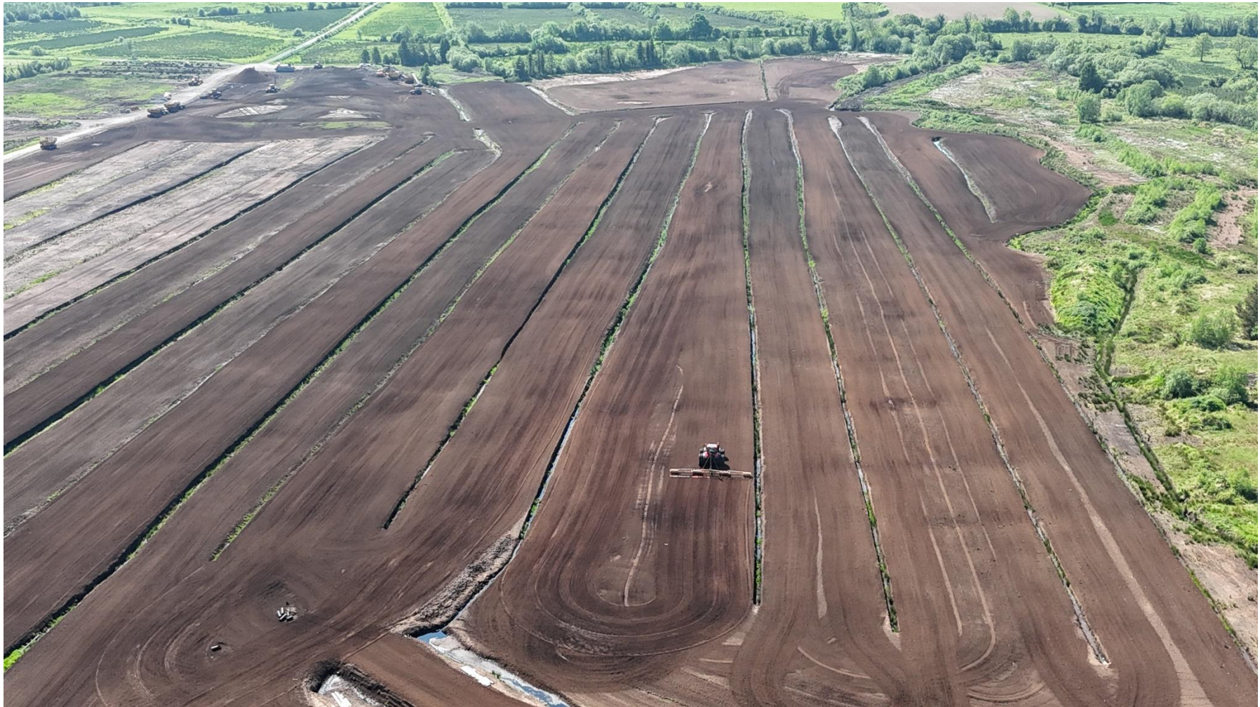
Photo 4: Milled peat harrowing was noted to be taking place during the visit.